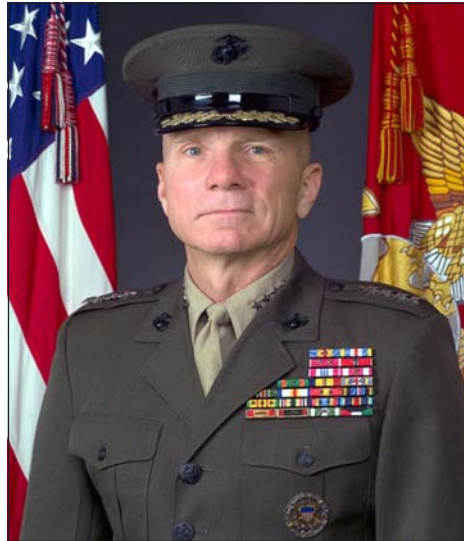
Gen. M. W. Hagee, Commandant of the U.S. Marine Corps

Our Corps has never been stronger, and all Americans are extremely proud of your magnificent performance and unwavering