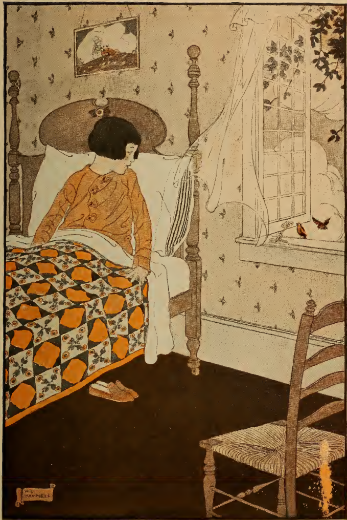
Bed in Summer