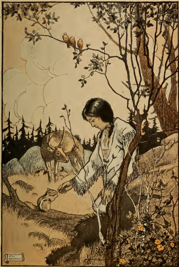
Hiawatha and Old Nokomis