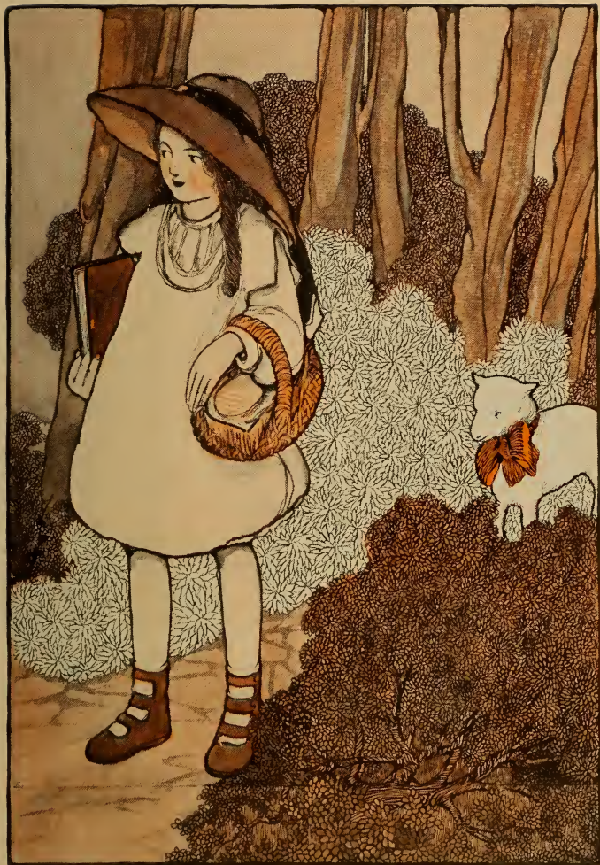
Mary and her Lamb