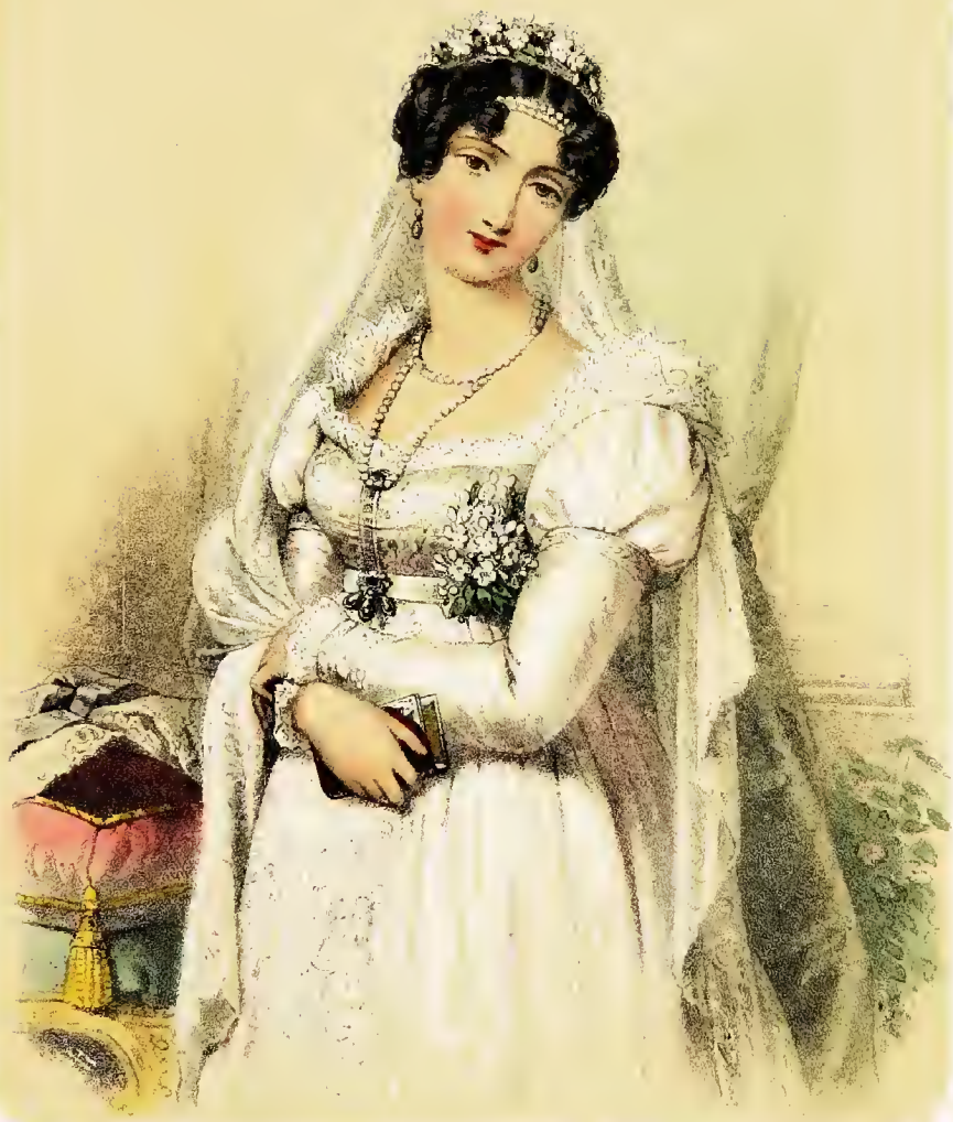
Illustration of a bride