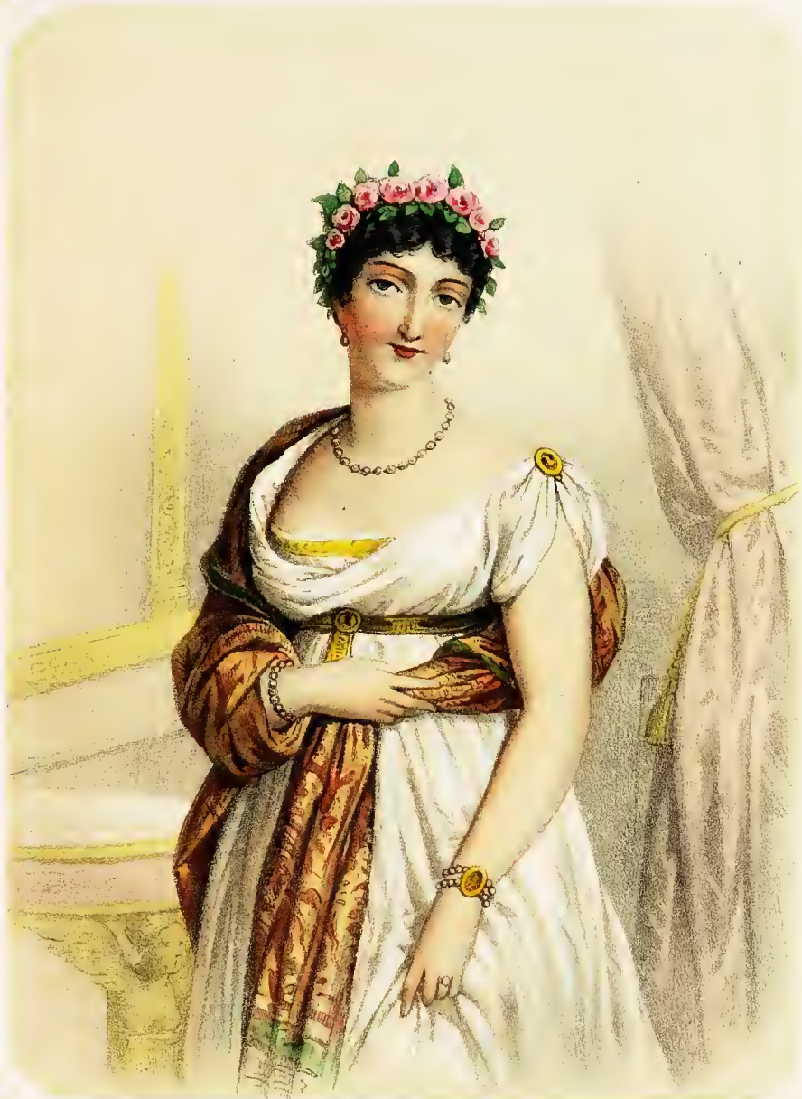
M LE TALLIEN.