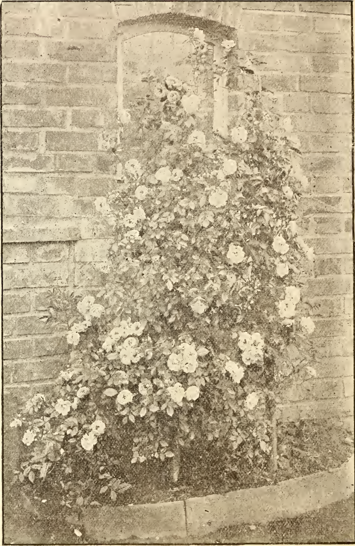
THE YELLOW RAMBLER (AGLIA).

INTRODUCED BY JACKSON & PERKINS, NEWARK, N. Y.