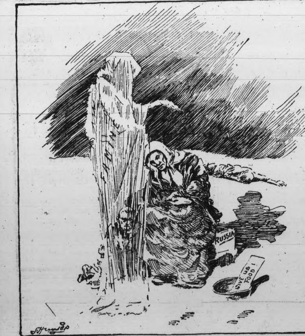
COMMON HUMANITY DEMANDS THAT WE HELP