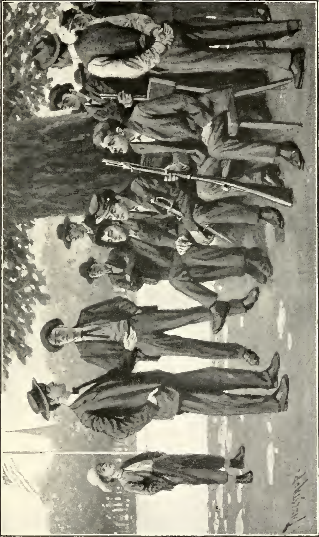
"I'M NO TRAITOR."