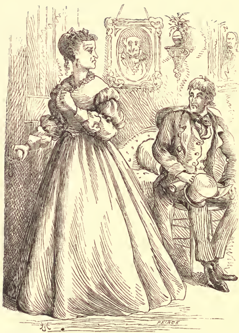
She marched out of the room, slamming half a dozen doors after her. PAGE 158.