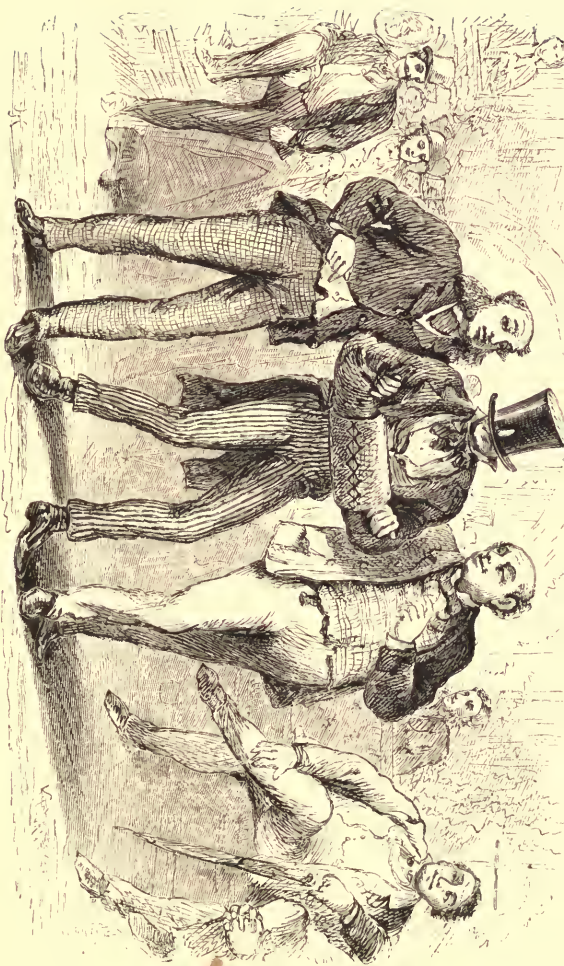
Yielding to pressing urgency on the part of my escort, I crossed the threshold of the reception-