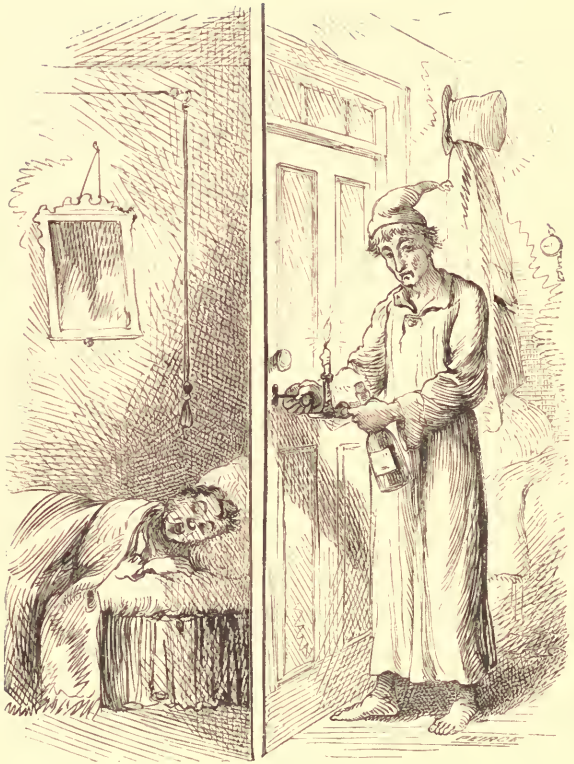
Samaritan-like, I have sometimes called — PAGE 66.