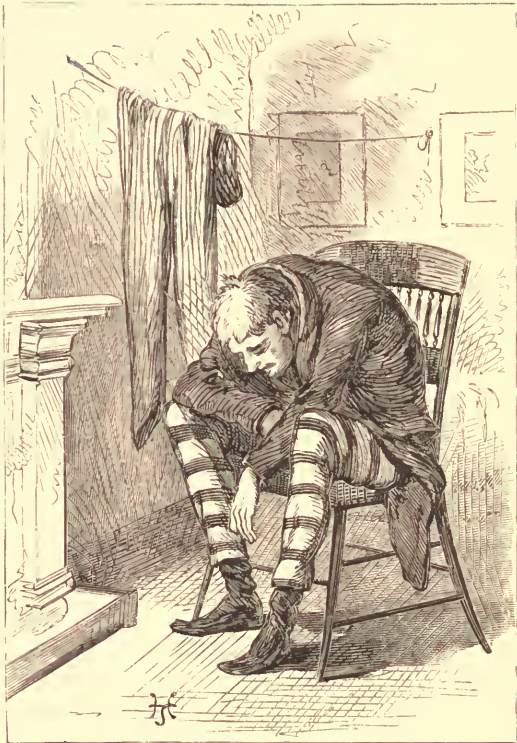
Drawing myself in front of a warm fire, my thoughts became as busy as a fulling-mill. — PAGE 112.