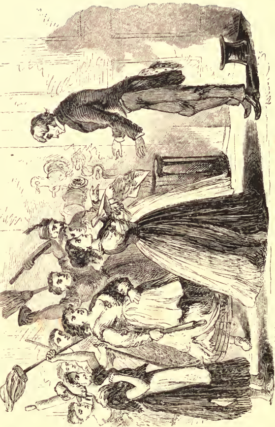
“That, sir!” — pointing her finger to the spot, — “that infamous intimation.” — PAGE 53.