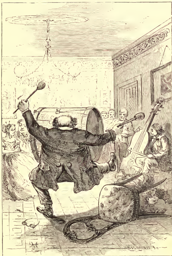
Suiting his actions to the words, with his drum he commenced revolving around the room. — PAGE 32.