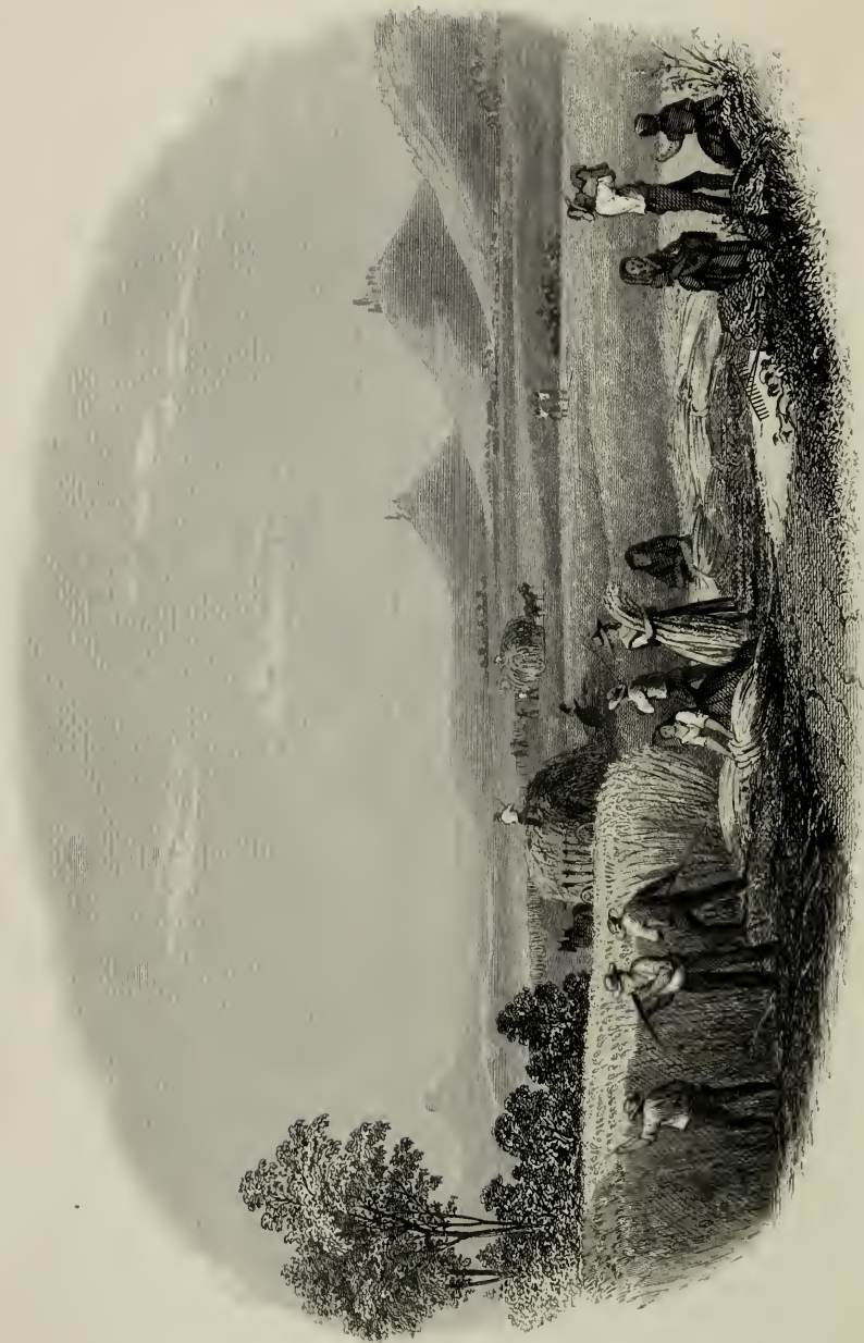
THE CASTLES OF THE GLENN.