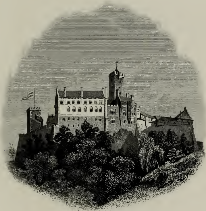
The Wartburg near Eisenach.