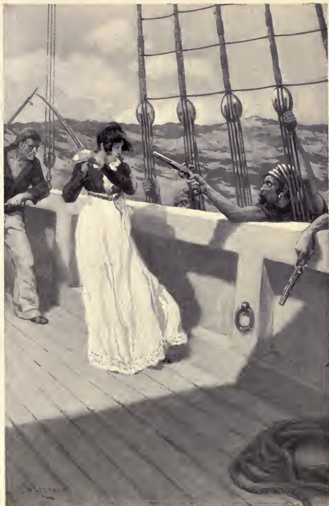
"AS THE PIRATES REACHED THE DECK, THEODOSIA GRASPED A CUTLASS."