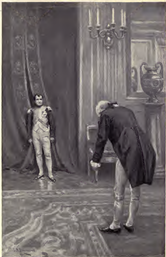
"THE HERO OF MARENGO, AUSTERLITZ, AND JENA STOOD BEFORE HIM."