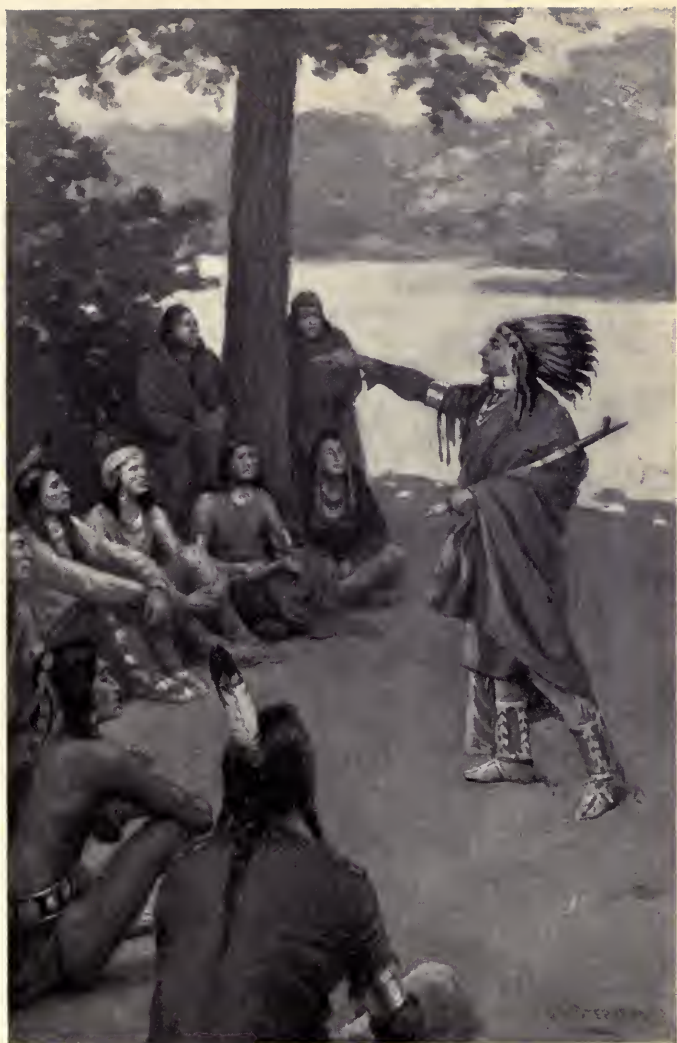
"AARON BURR, IN THE DRESS OF A CREEK CHIEF, STEPPED INTO THE CENTRE OF THE COUNCIL, AND THUS ADDRESSED THE MEETING:"