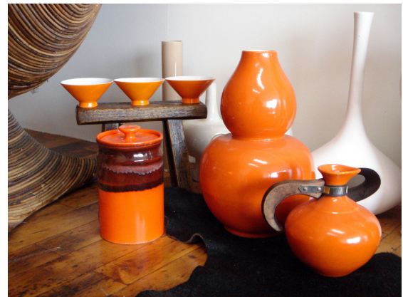
His interest in mid-century modern design goes beyond the books. 2