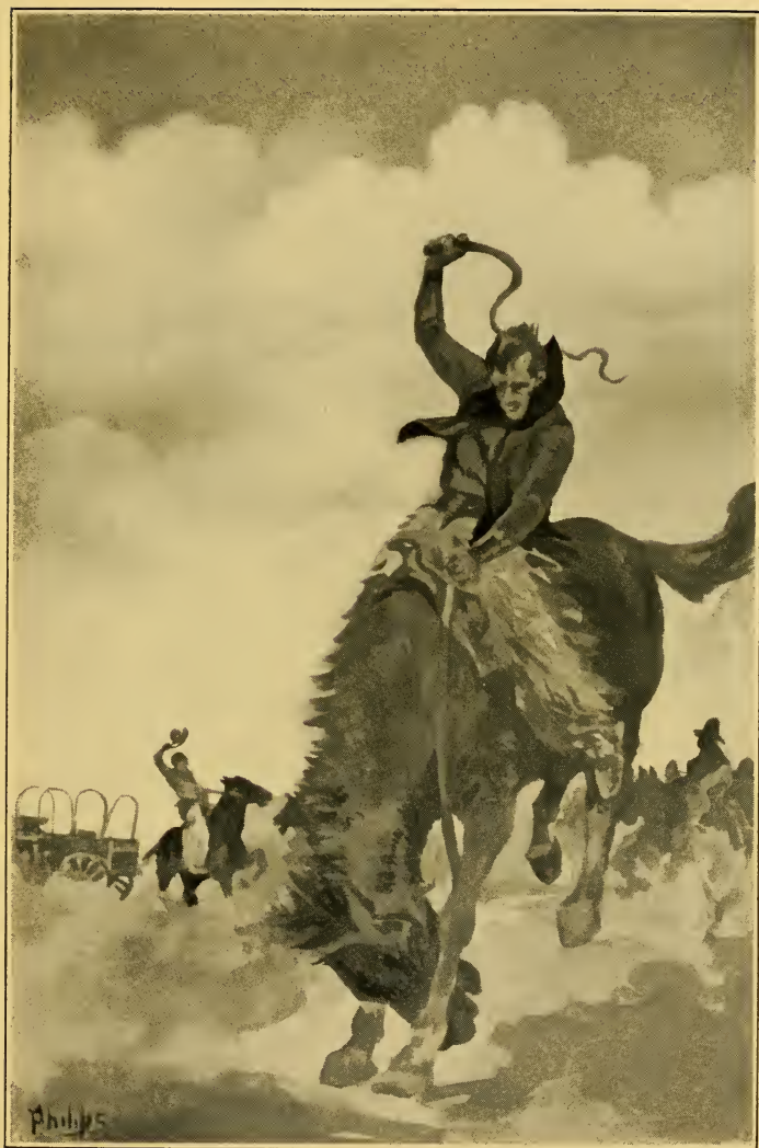
"I'll Ride You, Old Bronk, to Your Death."