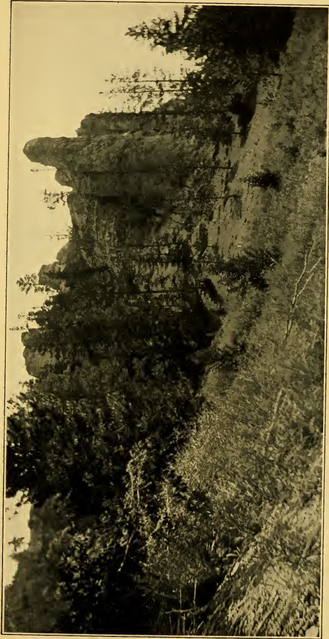
Rock House on Bridger.