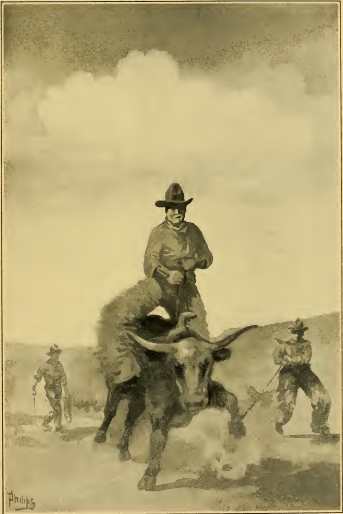
"When the Steer's a Flying Circus."