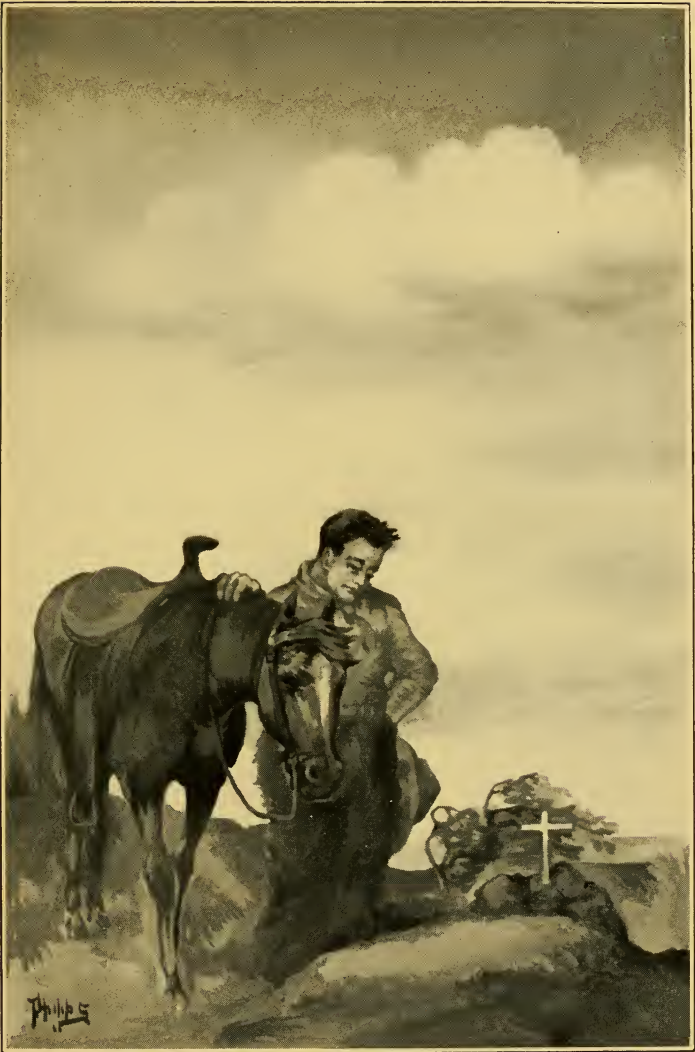
"A Mother's Son is Sleeping Here."