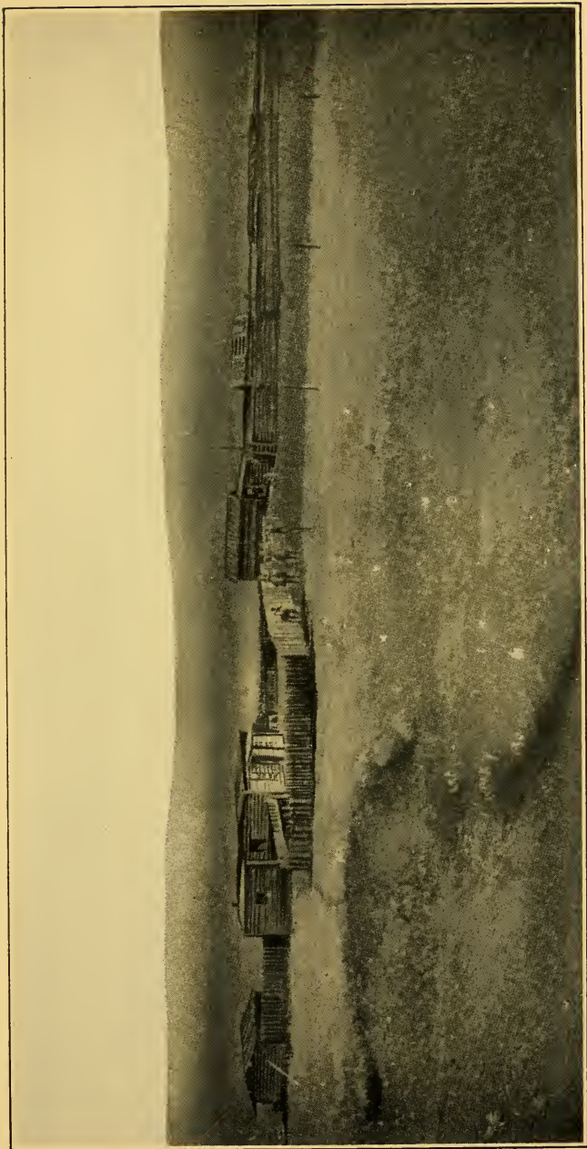
The Old Stockade Ranch Buildings.