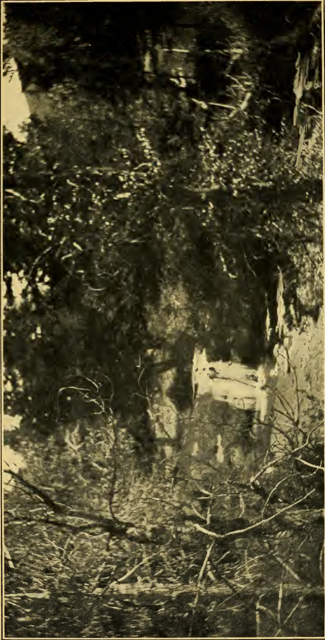
Bridger Creek Falls.