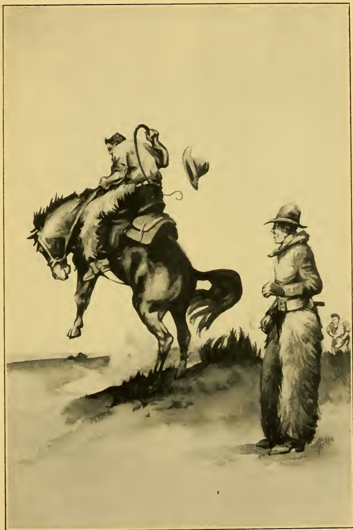
"And I'll Ride Your Bronk for Dough."