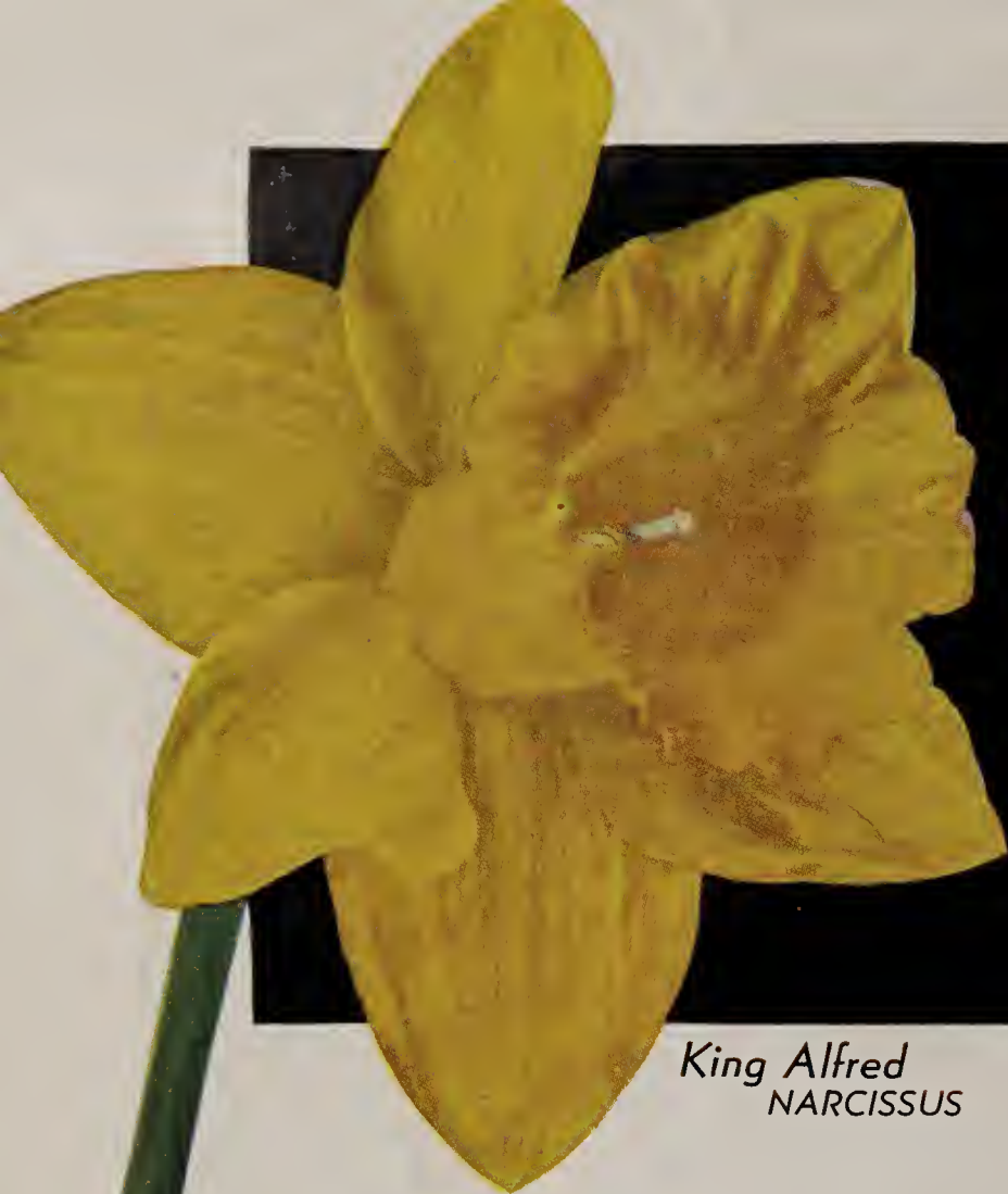
King Alfred NARCISSUS