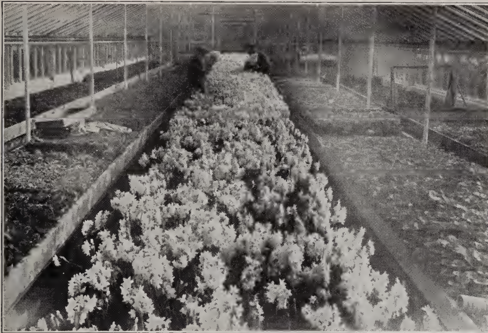
Texas-Grown Paper-White Narcissus Bulbs in Bloom in Cincinnati Greenhouse.