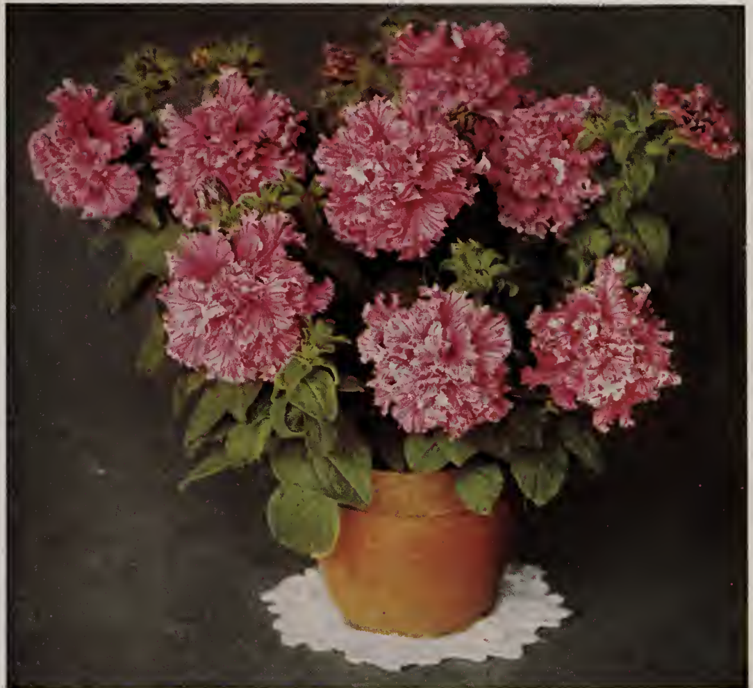
New Double Flowering Fringed Petunia, "World Beauty." Named and Introduced by the American Bulb Co.

The introduction of the three Petunia strains listed on this page has caused the public to become " Petunia conscious " and further resulted in providing " real profit " for the grower who had the foresight to culture them. The following testimonials, two of the many we have received, will indicate to some extent at least the opinion of some of our florist friends regarding the same. To provide large plants for spring sales, sow seed early.