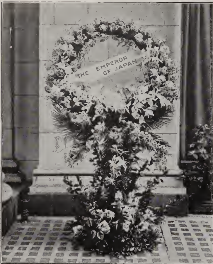
"THE ARISTOCRAT OF LILIES"

Standing Wreath Composed of Orchids and Lilium Rubrum (Magnificum). "Oriental Orchids." There is no Lily that lends itself so gracefully to floral work of all kinds. Has a particular charm all of its own. Easily grown.