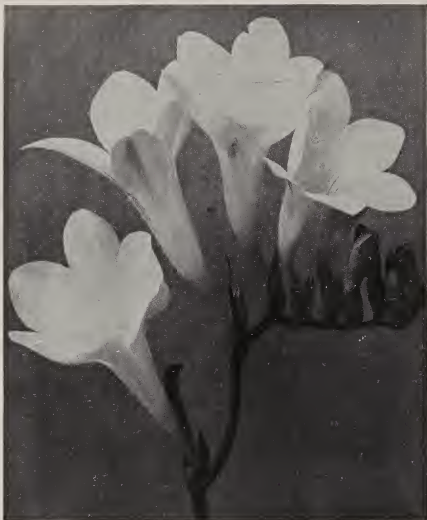
Freesias, A. B. C. Imp. "Purity Superflora."