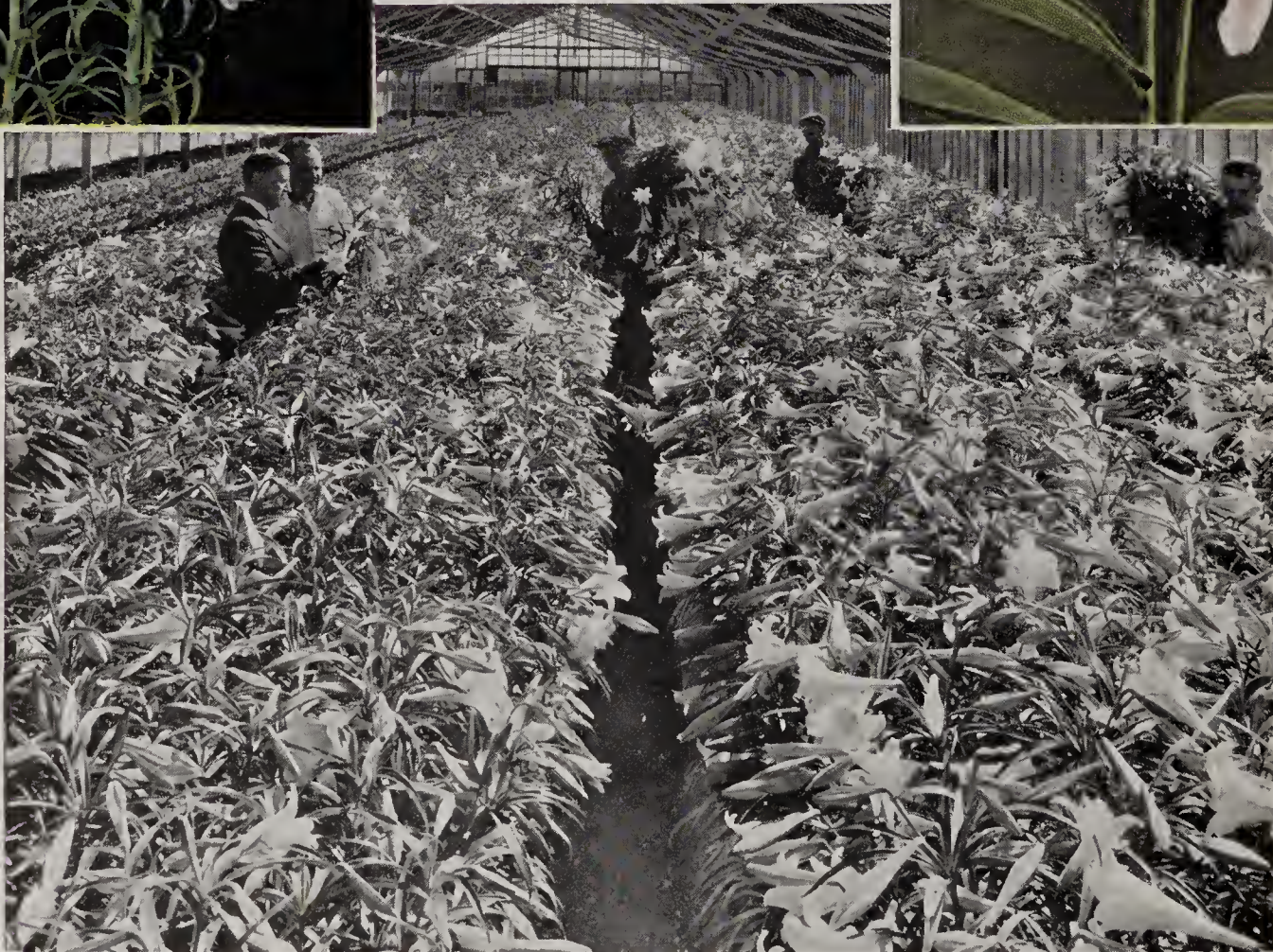
House of Lilies Produced From A. B. C. Bulbs by the Premier Rose Gardens, Maywood, Ill. Photograph taken April 13, 1935.