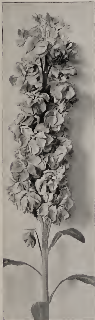
Stocks—Ball Branching or Column.