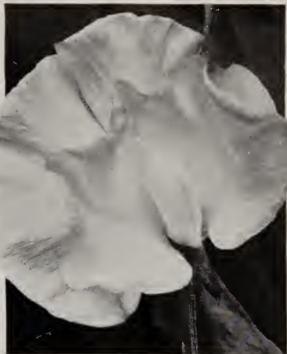
Early Sweet Pea—"Hope." The "Last Word" in White Sweet Peas.