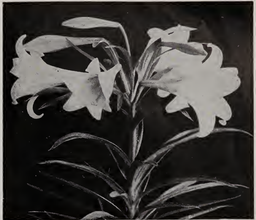
A. B. C. Improved "Erobu."