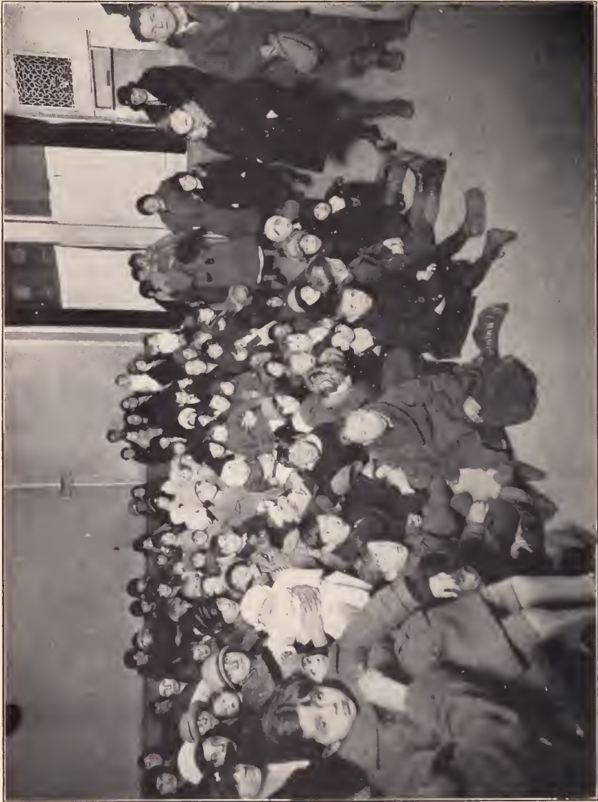
Waiting for the Christmas Party to begin. Just a few of the youngsters who come. 1926