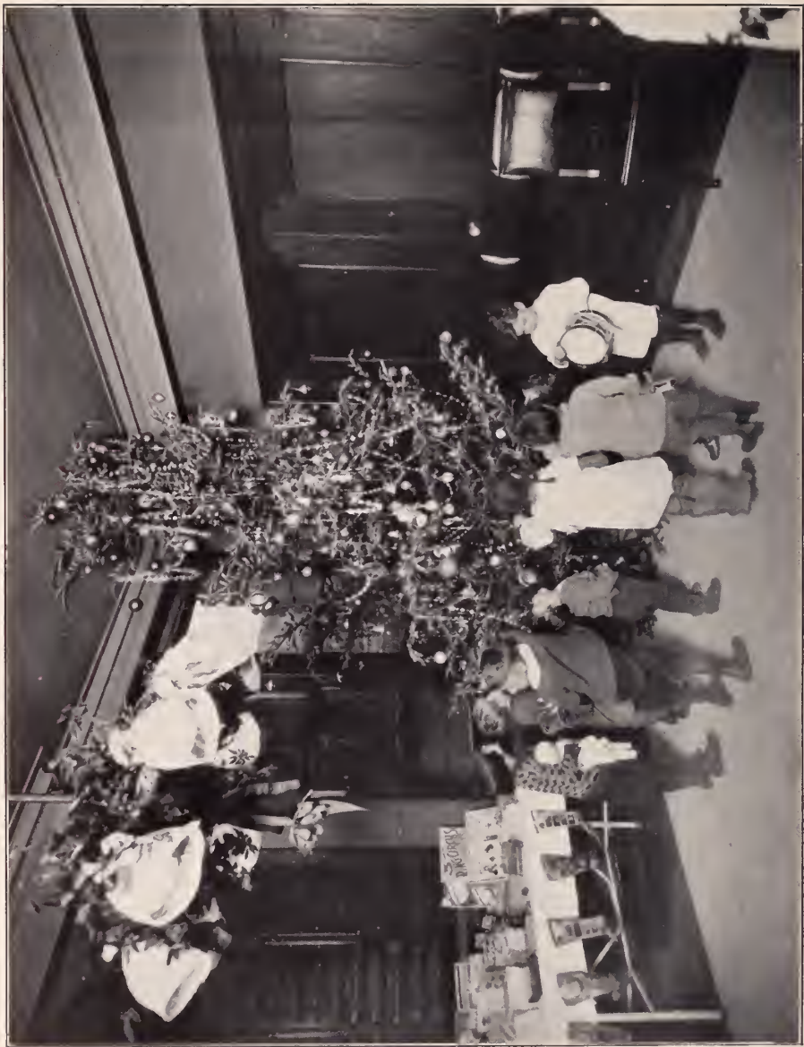
Looking for Santa Claus, Christmas Party, 1926