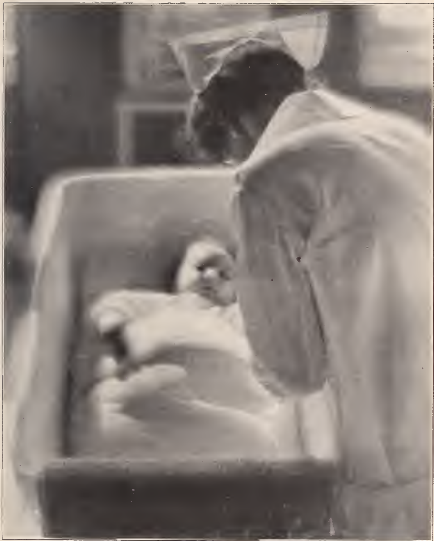
The object of our effort, care and solicitation: "THE BABY IN THE CRIB"