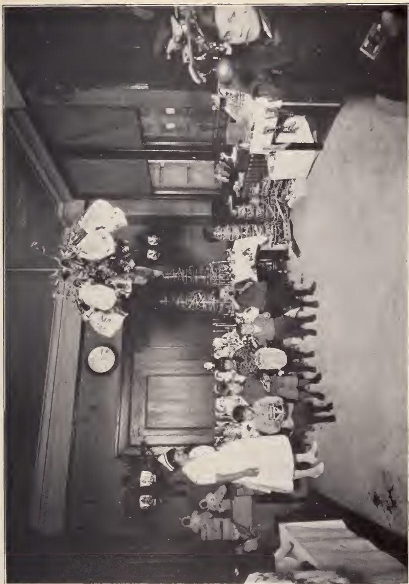
"And this is the way we select our toys . . ." Christmas Party, 1926