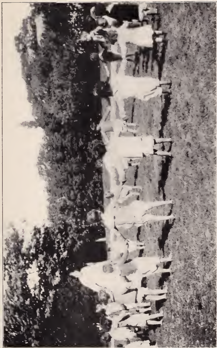
Play-time at the Summer Branch Hospital