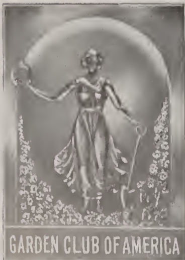
Awarded us twice by the Garden Club of America.