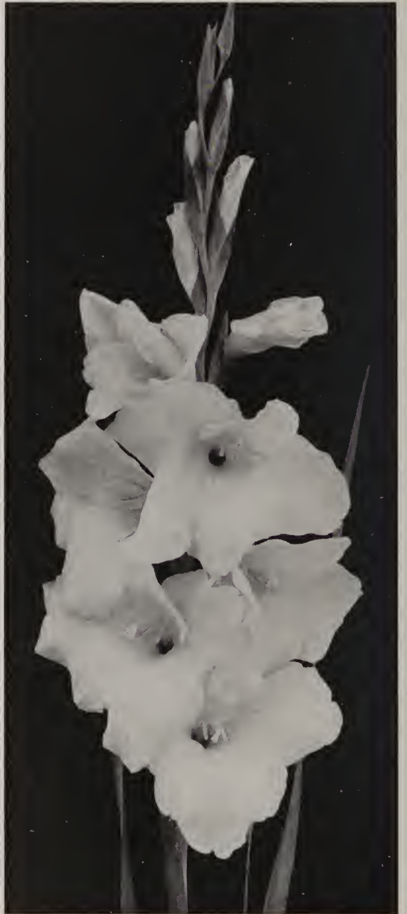
STAR OF BETHLEHEM: (right) Six to eight immense pure white florets open at one time to give this Gladiolus great distinction. It is worthy of a place in every good collection.