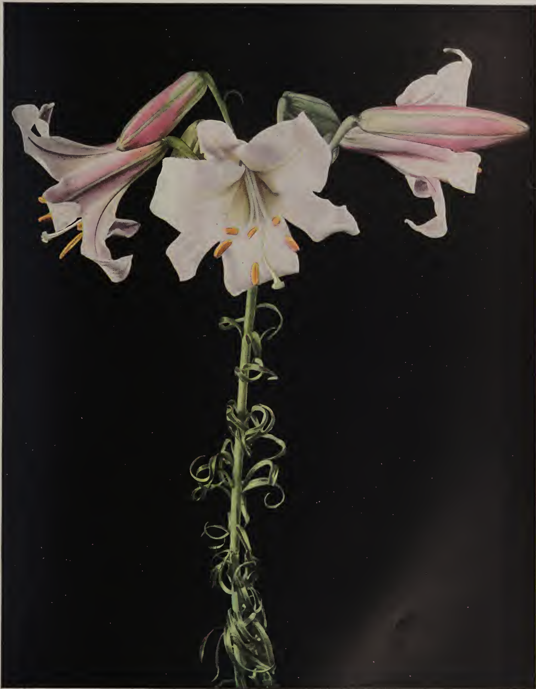
Lilium Regale (The Royal Lily)

Success with Lilies is among the proudest achievements that the gardener knows. They lend themselves to effects that are unsurpassed for beauty and nobility. The Regal Lily is one of the most beautiful and one of the hardiest, as well as the easiest to grow. It is worthy of a place in every garden.