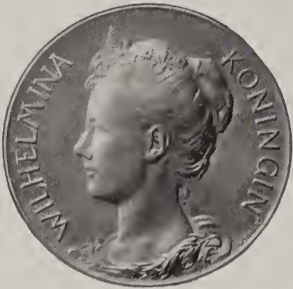
Awarded us by Her Majes- ty, Queen Wilhelmina of the Netherlands at the In- ternational Flower Show, 1930.

A few of the gold medals bestowed on us for merit . . . .