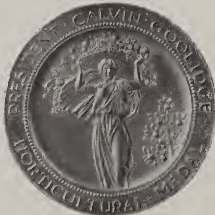
Awarded us by President Calvin Coolidge for Horti- cultural Achievement.