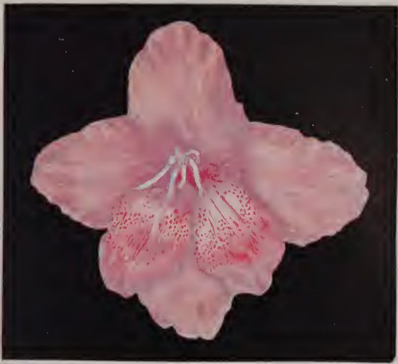
Prince of India