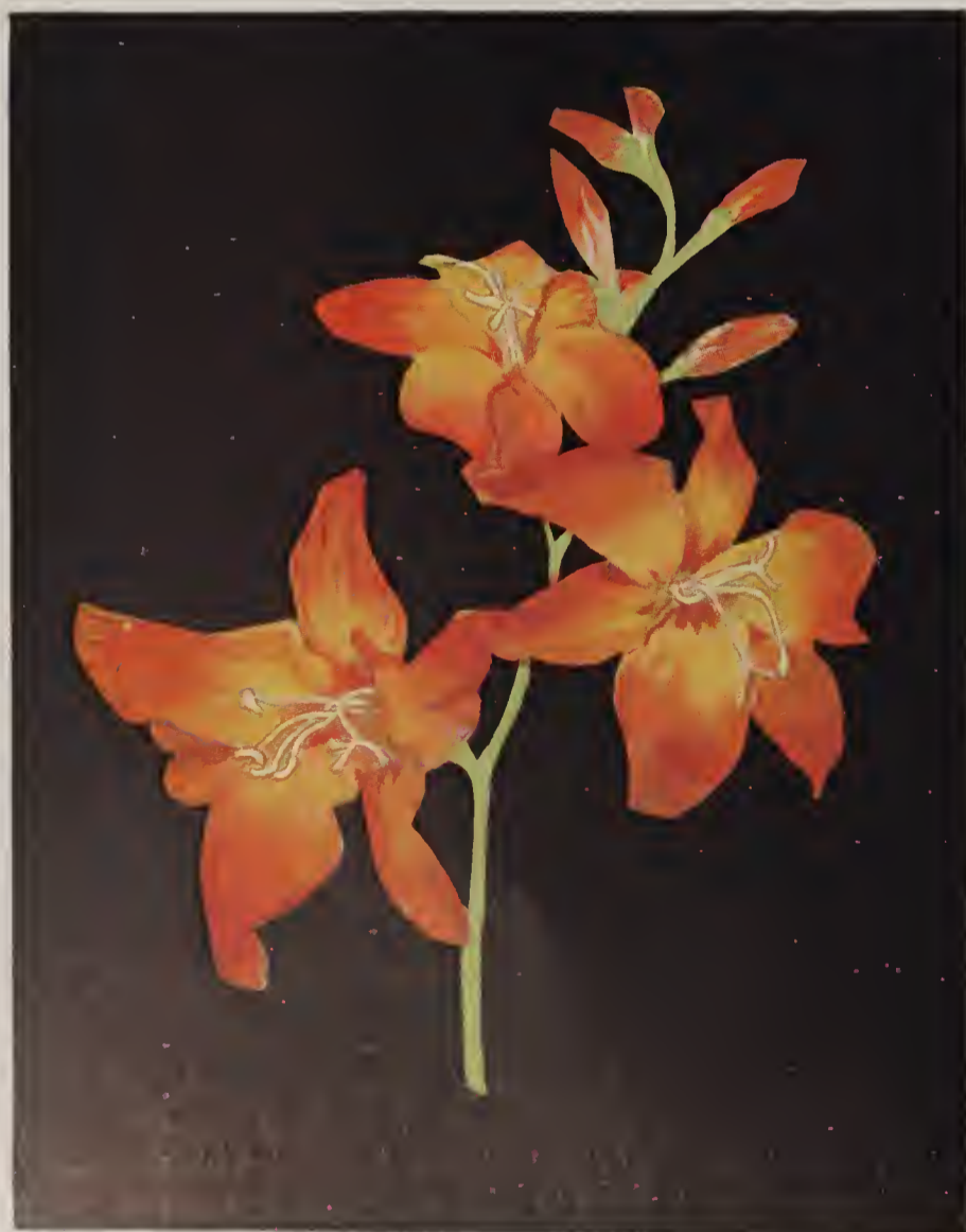
Montbretia "His Majesty"