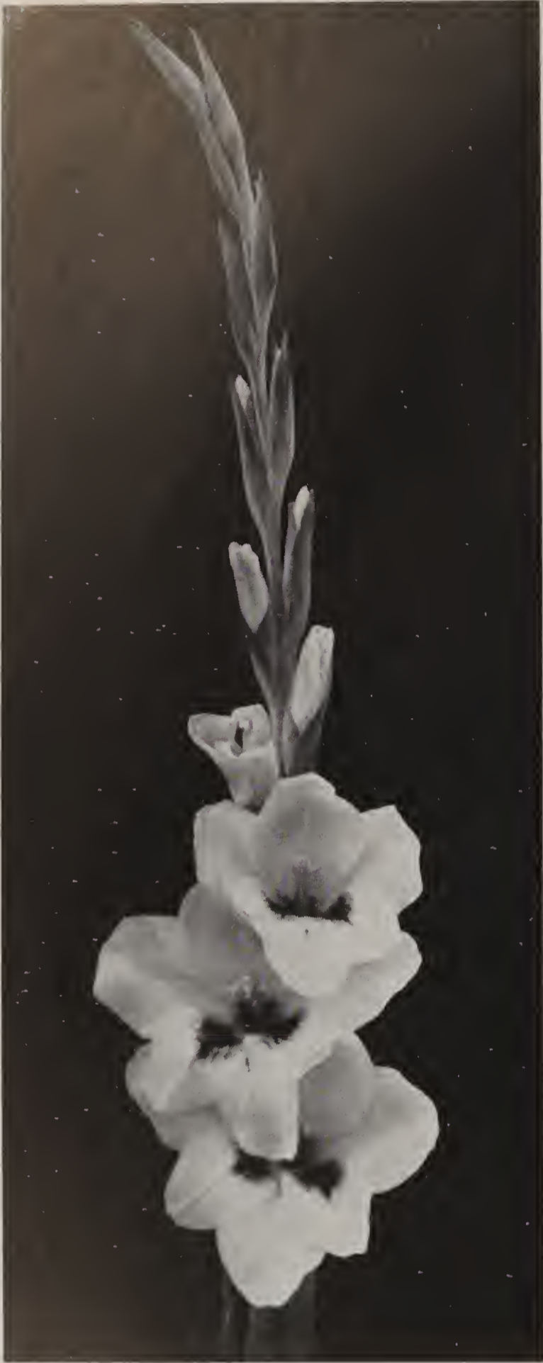
ZAUBERFLOETE: (left) A beautiful decorative variety. Its peach-rose-red coloring makes it excellent for color harmonizing. A new Glad with a promising future.