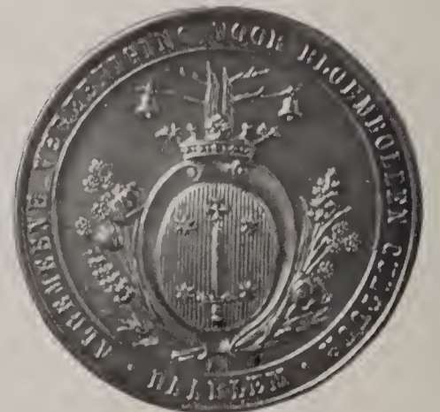
Awarded us three times by the Holland Bulb Growers' Association of Haarlem, Holland.