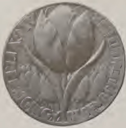
Awarded us for our exhibit in the 1935 International Spring Flower Show at Heemstede, Holland.