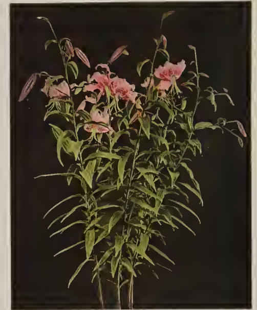
Lilium Speciosum Magnificum

Smaller bulbs at correspondingly lower prices