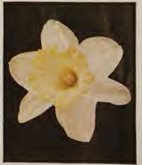
Leedsii Narcissus Gertie Millar