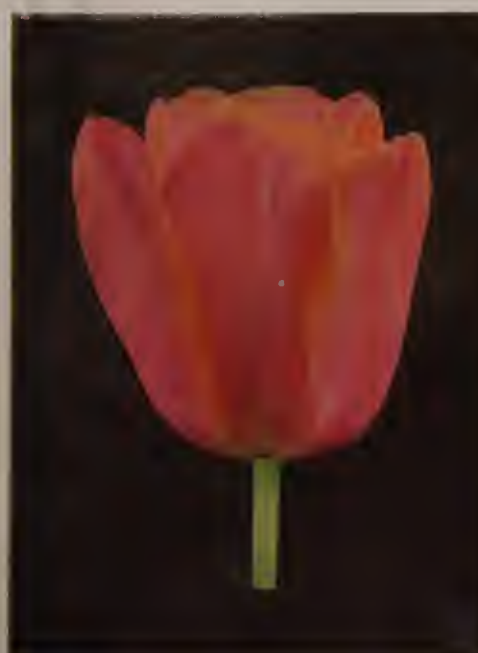
Hybrid tulip AMBROSIA (Height 30 inches) $1.00 per 10; $6.50 per 100