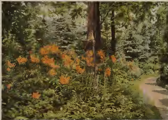
A Naturalized Planting of Lilium Hansonii

For other varieties of lilies, please consult our 1936 edition of "BEAUTY FROM BULBS"