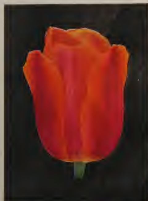
Hybrid tulip DIDO (Height 32 inches) $3.95 per 10; $6.00 per 100