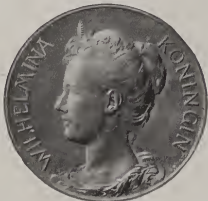
Awarded us by Her Majesty, Queen Wilhelmina of the Netherlands at the International Flower Show, 1930.