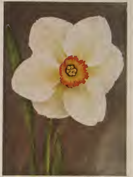
A typical Barrii Narcissus

Total 90 extra strong flowering bulbs. Regular List Price . . . . . $11.55 Special Price . . . . . 10.25