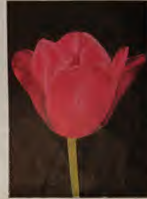
Hybrid tulip BARBARA PRATT (Height 36 inches) $1.55 per 10; $12.00 per 100