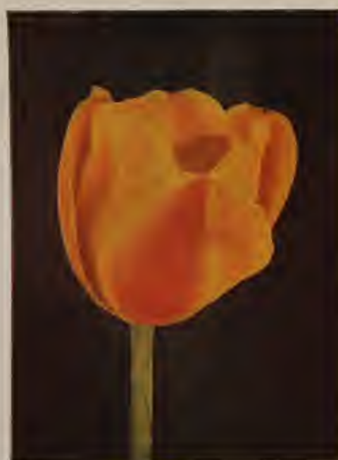
Breeder tulip DILLENBURG (Height 32 inches) $1.15 per 10; $8.00 per 100