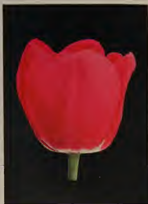
Darwin tulip KING GEORGE V (Height 26 inches) $1.15 per 10; $8.00 per 100