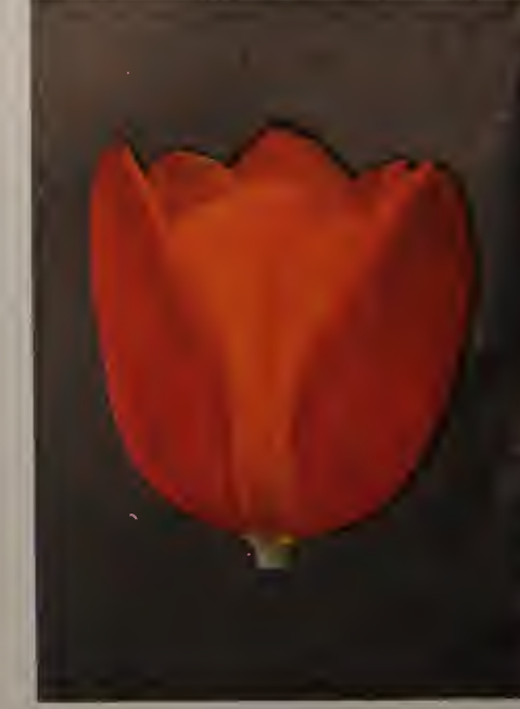
Breeder tulip LUCIFER (Height 28 inches) $1.15 per 10; $8.00 per 100