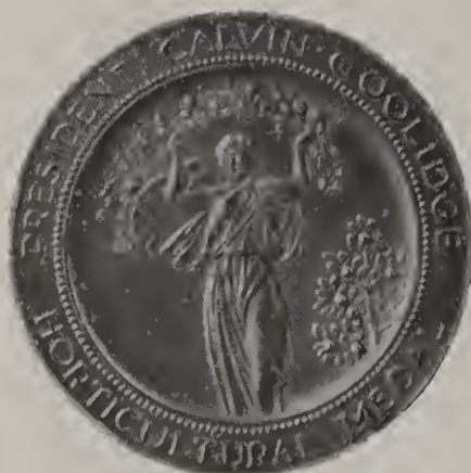
Awarded us by President Calvin Coolidge for Horticultural Achievement.