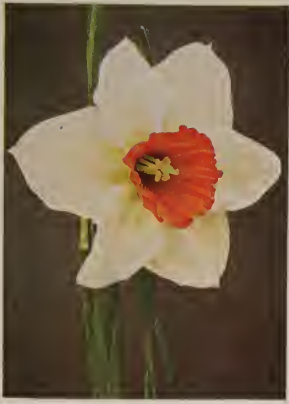
Incomparabilis Narcissus Francisca Drake