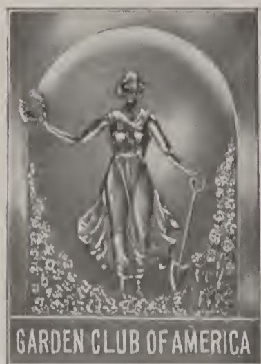
Awarded us twice by the Garden Club of America.