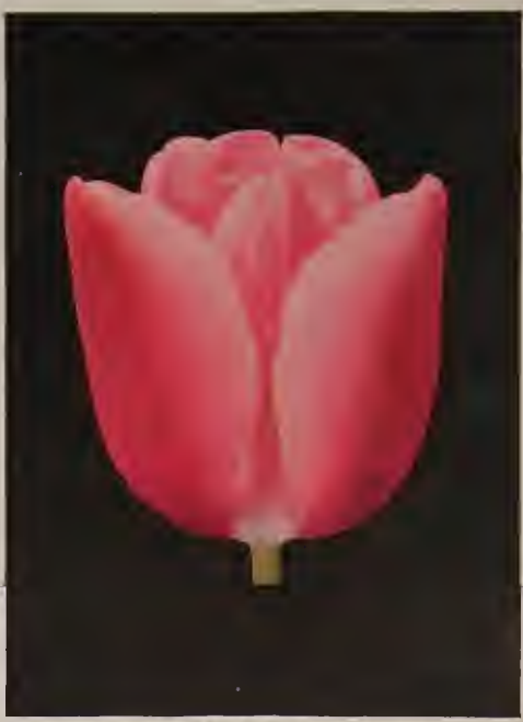
Darwin tulip LA FIANCÉE (Height 32 inches) $3.95 per 10; $6.00 per 100