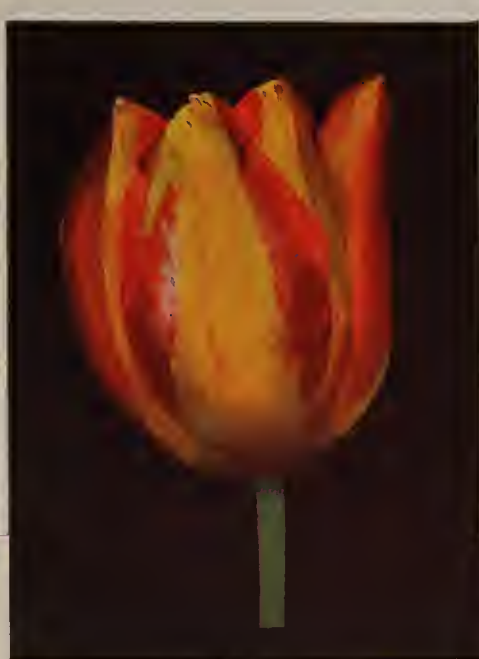
Hybrid tulip JEANNE DESOR (Height 28 inches) $1.15 per 10; $8.00 per 100