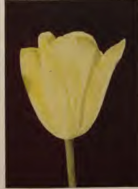
Cottage tulip MOONLIGHT (Height 25 inches) $3.95 per 10; $6.00 per 100