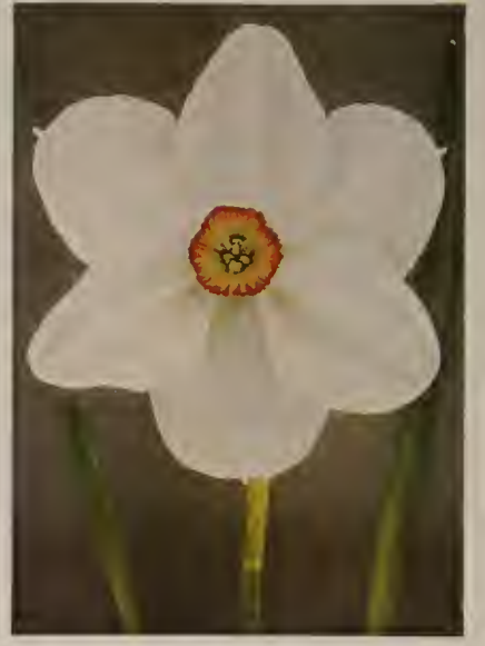
A typical Poeticus Narcissus

A superior mixture made up from the newer varieties of daffodils, containing all types and assuring a 4- to 6-week flowering season. Extra-heavy selected bulbs, $75 per case of 1000; $38 per case of 500; $8 per 100.