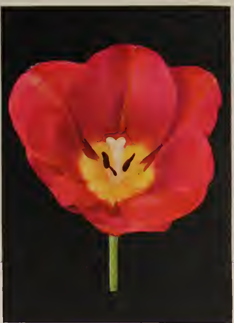
Breeder tulip INDIAN CHIEF (Height 36 inches) $1.35 per 10; $10.00 per 100