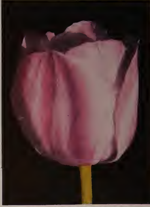
Darwin tulip MELICETTE (Height 28 inches) $1.05 per 10; $7.00 per 100