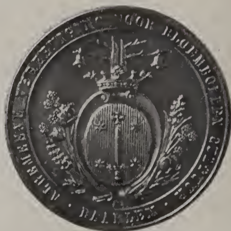
Awarded us three times by the Holland Bulb Growers' Association of Haarlem, Holland.

A few of the gold medals bestowed on us for merit . . . .