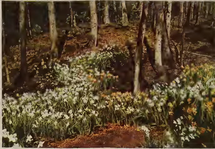
Mixed Daffodils (Narcissi) Naturalized

A fine mixture made up from older varieties of daffodils, but carefully selected and containing all types. Extra heavy selected bulbs, $45 per case of 1000; $23 per case of 500; $5 per 100.