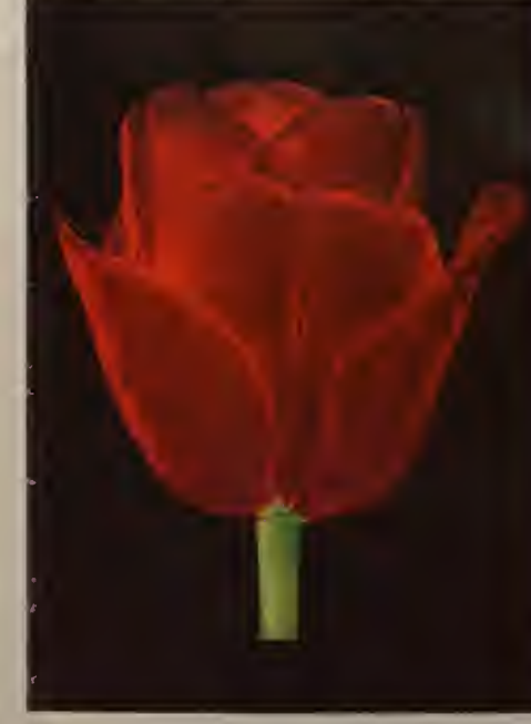
Darwin tulip ECLIPSE (Height 30 inches) $1.75 per 10; $14.00 per 100