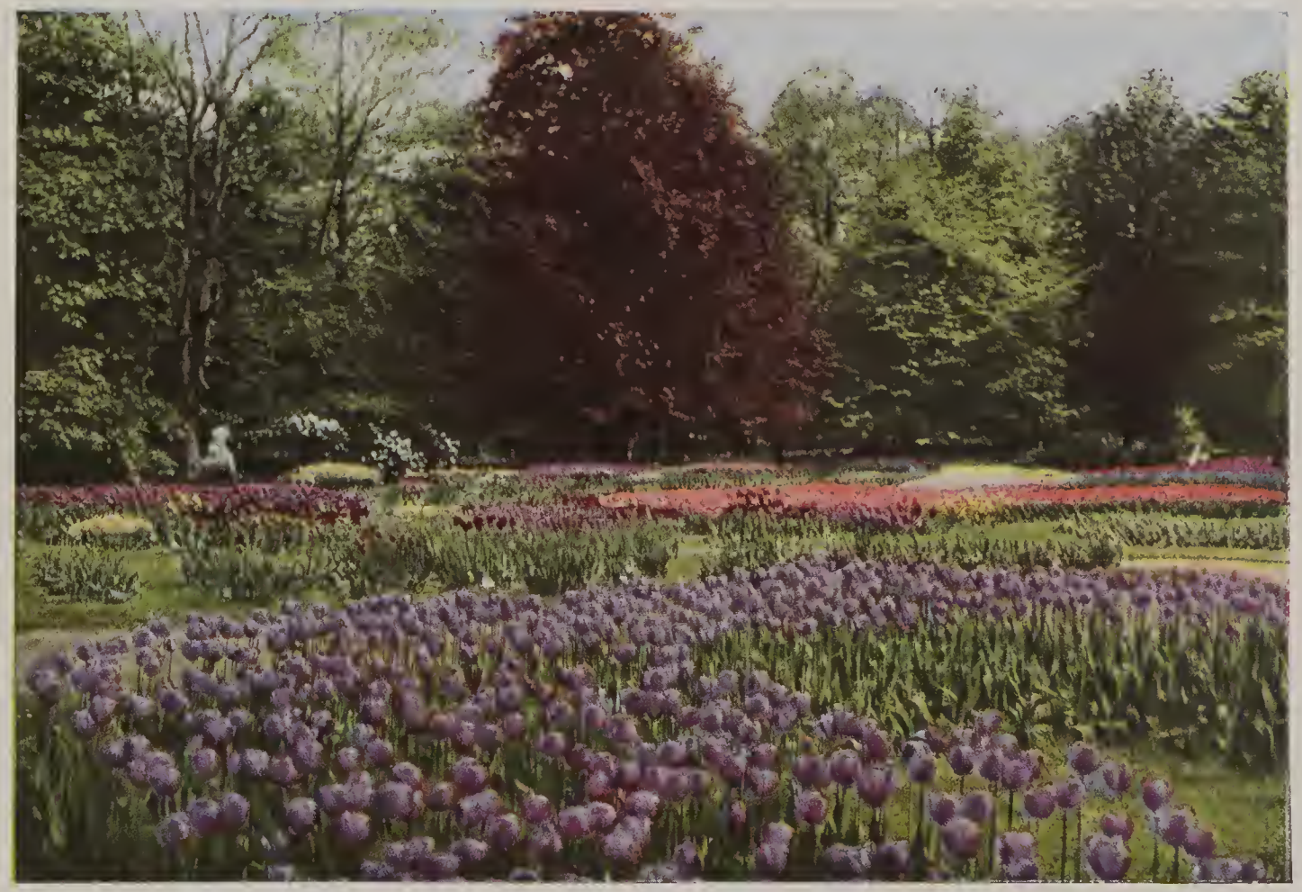
Tulip Time in Holland

JOHN SCHEEPERS, INC., Executive Office: 522 FIFTH AVE., NEW YORK CITY