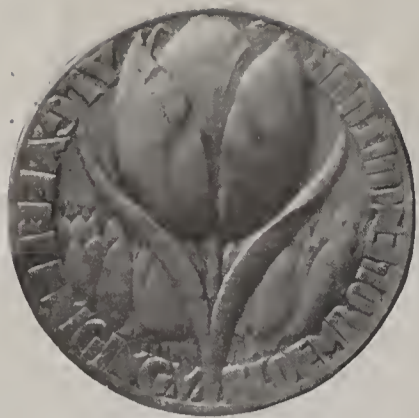
Awarded us for our exhibit in the 1935 International Spring Flower Show at Heemstede, Holland.