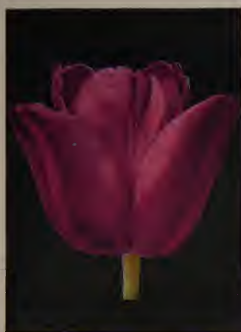
Darwin tulip THE BISHOP (Height 30 inches) $1.10 per 10; $7.50 per 100