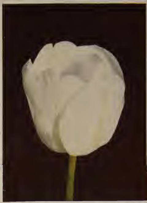
Hybrid tulip CARRARA (Height 24 inches) $1.20 per 10; $8.50 per 100