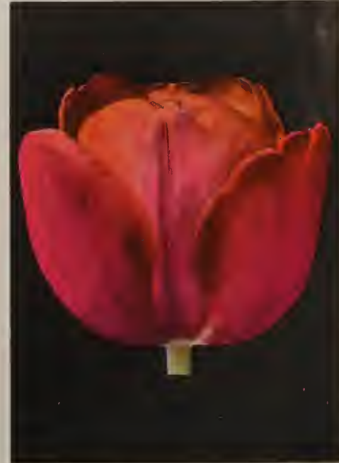
Breeder tulip LOUIS 14th (Height 34 inches) $1.90 per 10; $6.50 per 100