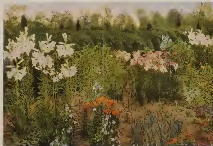
Lilium Candidum and Lilium Regale in the border

COMPLETE CULTURAL DIRECTIONS WILL ACCOMPANY EACH SHIPMENT