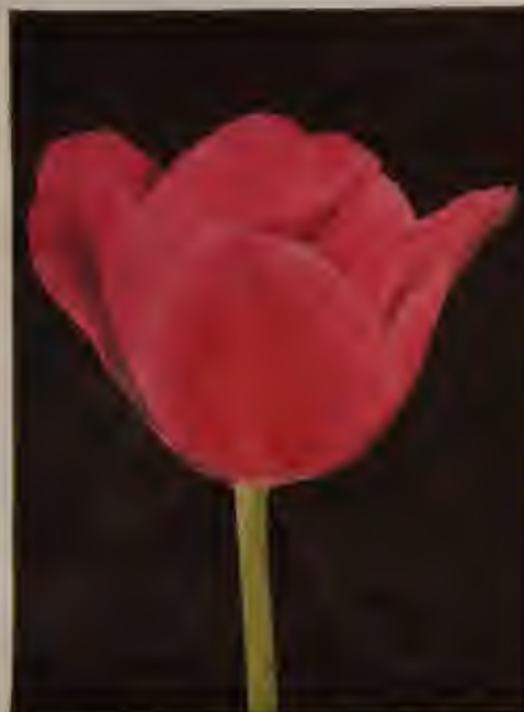
Darwin tulip PRINCESS MARY (Height 35 inches) $1.35 per 10; $16.00 per 100