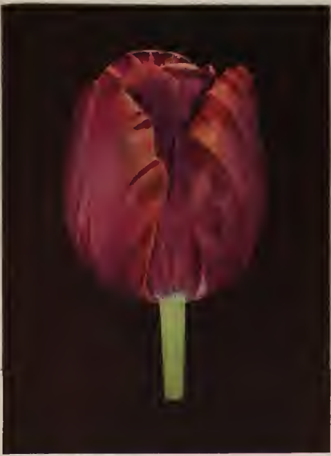
Breeder tulip ROI SOLEIL (Height 32 inches) $1.05 per 10; $7.00 per 100