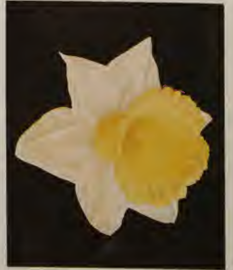
Trumpet Narcissus Robert E. Lee