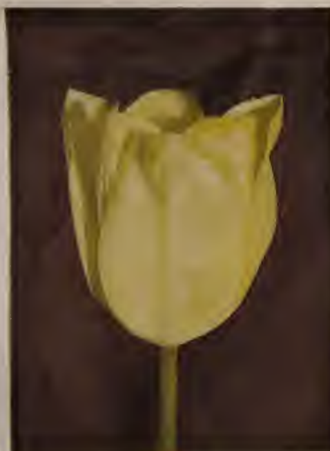
Cottage tulip LEMON QUEEN (Height 28 inches) $1.10 per 10; $7.50 per 100