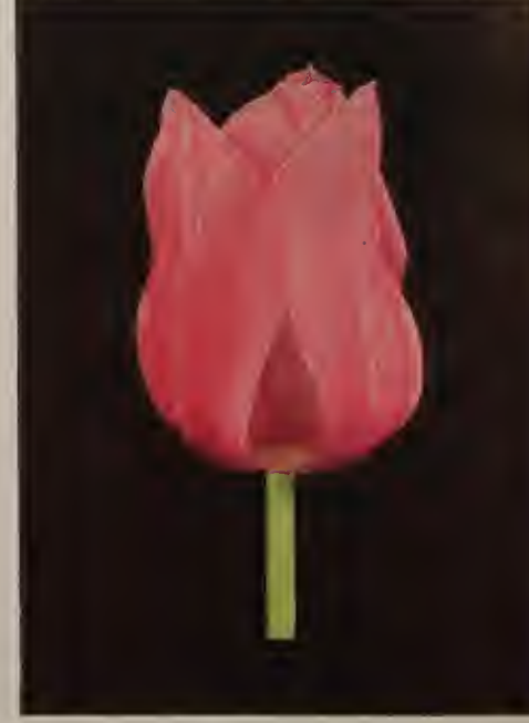
Darwin tulip VENUS (Height 30 inches) $3.95 per 10; $6.00 per 100