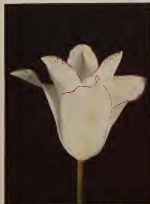
Lily-flowering tulip ELEGANS ALBA (Height 24 inches) $1.60 per 10; $12.50 per 100