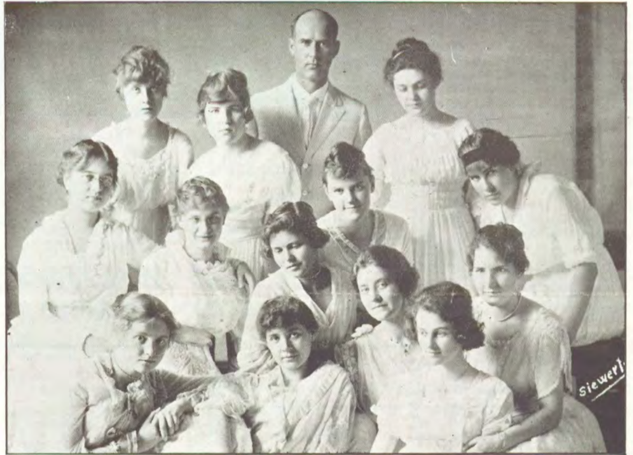
GIRLS' GLEE CLUB 1915-16