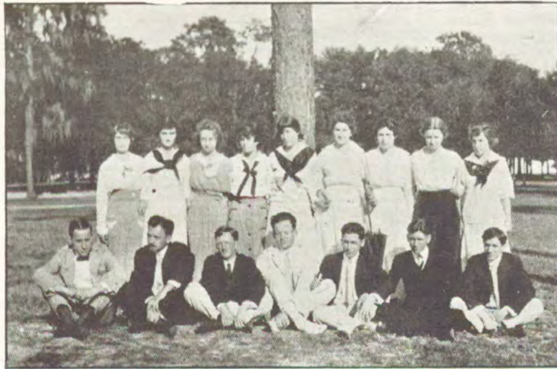
SOPHOMORES OF 1915-16

Once upon a time there was a college girl, who didn't go home during vacation and assume direction of the entire family.—Ex.