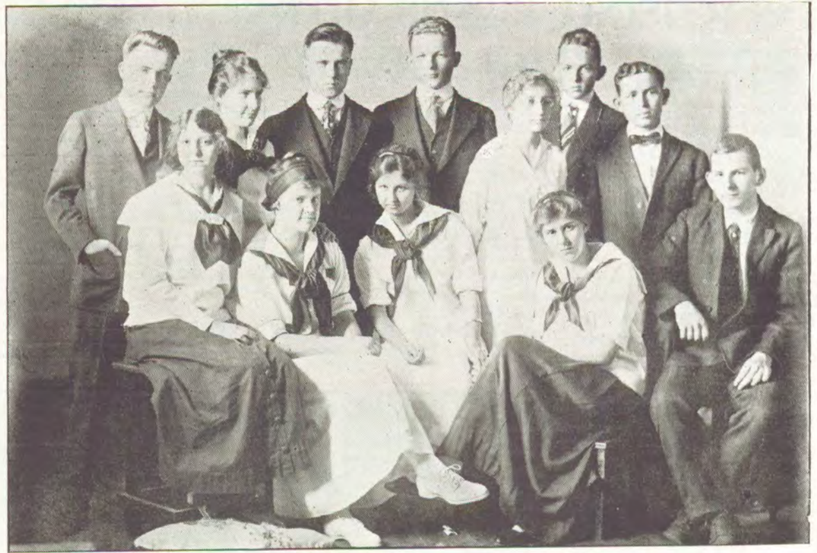
SENIOR ACADEMY CLASS '16

Delivered Daily 10c a Week All Kinds of Job and Book Work Neatly and Carefully Done.