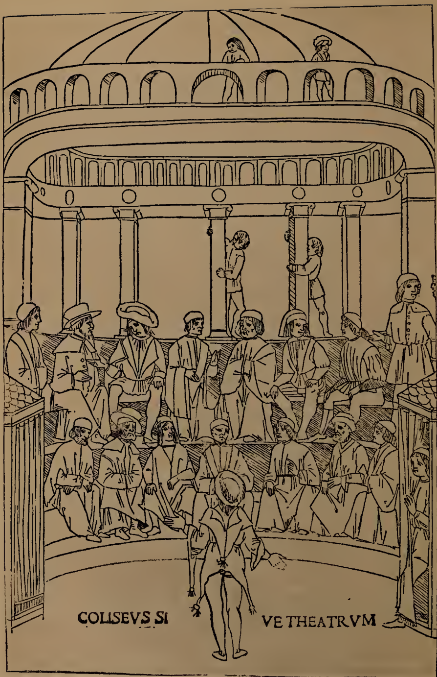
FROM THE VENICE TERENCE OF 1499