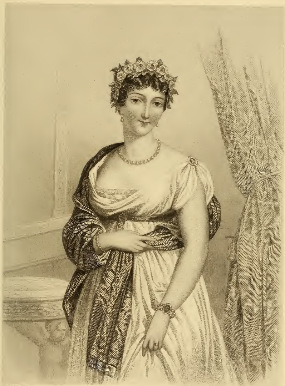
PRINCESSE DE CHIMAY.