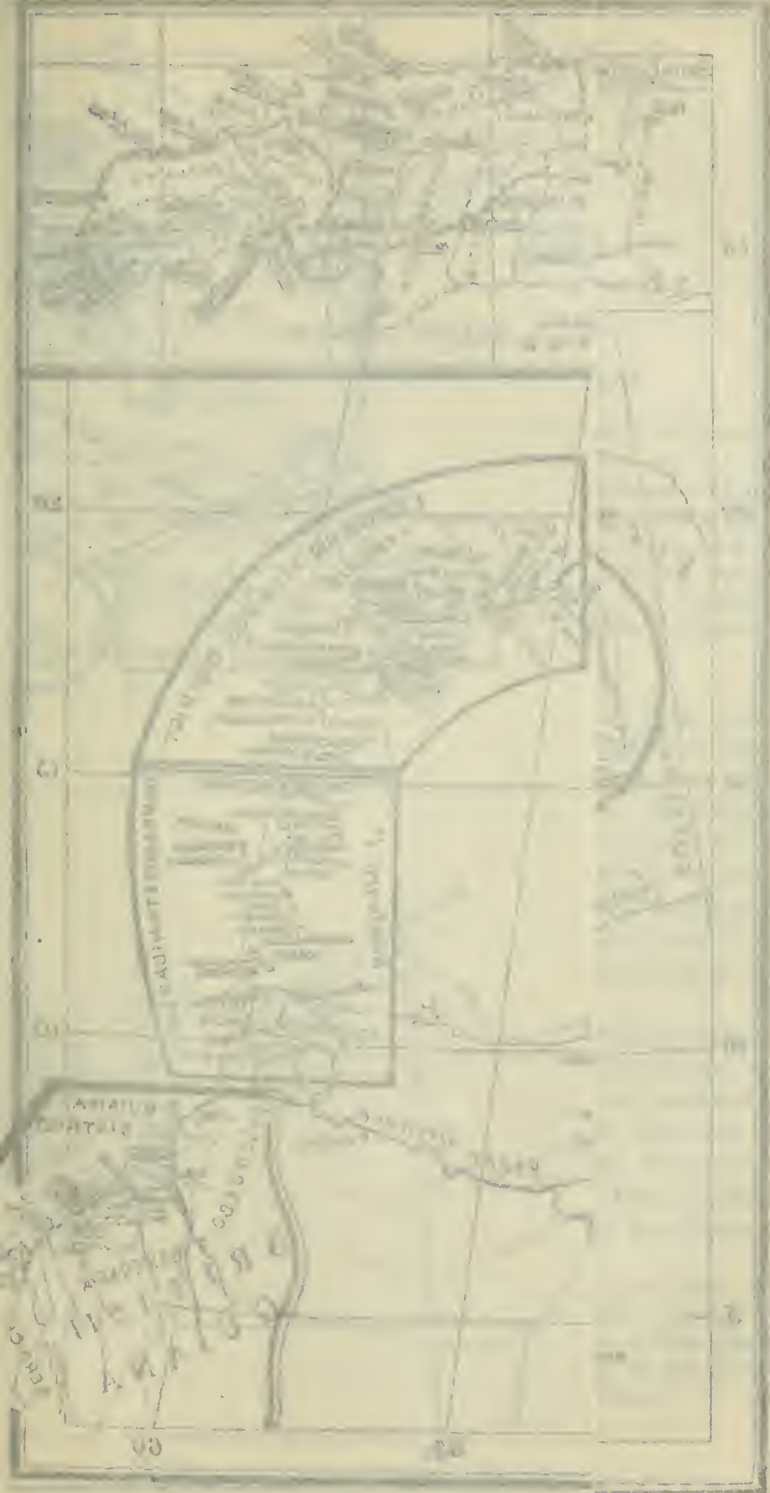
Map of the San Joaquin River and surrounding region, showing the Cajon Mountains and Arizona Territory.