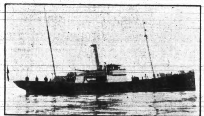
FISHERY CRUISER NEWINGTON.

Nuernberg had joined the company of small vessel, having formerly