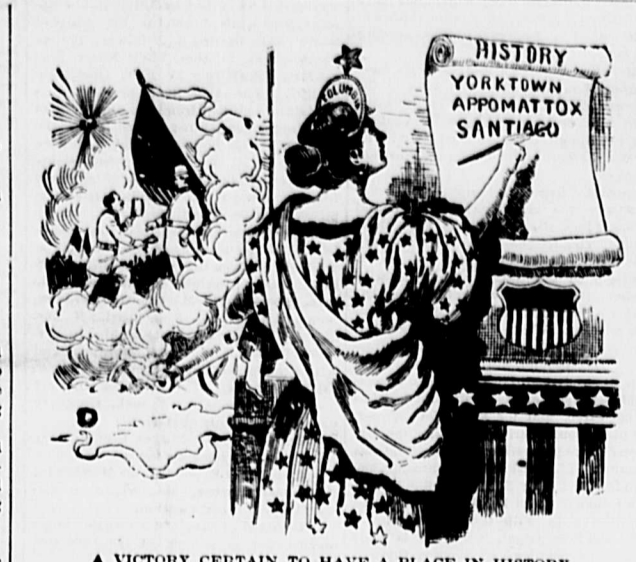
HISTORY YORKTOWN APPOMATOX SANTIAGO

TO CRESCENT PARK. An opportunity for passing a day at Crescent Park is afforded by the popular excursion, to take place on Thursday, August 13th next, from South Weymouth and all principal stations to Plymouth and on the Plymouth and Middlesex Branch, to Crescent Park and return, by special train and at exceedingly low rates of fare. Crescent Park has become a famous summer resort, and justly so, for it is a larger and best equipped shore resort in the Narragansett neighborhood. It has 300 acres of pleasure grounds and groves, and its presentation of amusement, entertainment and pleasant features is practically unlimited. Excursionists can band be regularly engaged here; and for shore dinners and blankets the place is well equipped. For excursion the number of round-trip tickets is strictly limited.