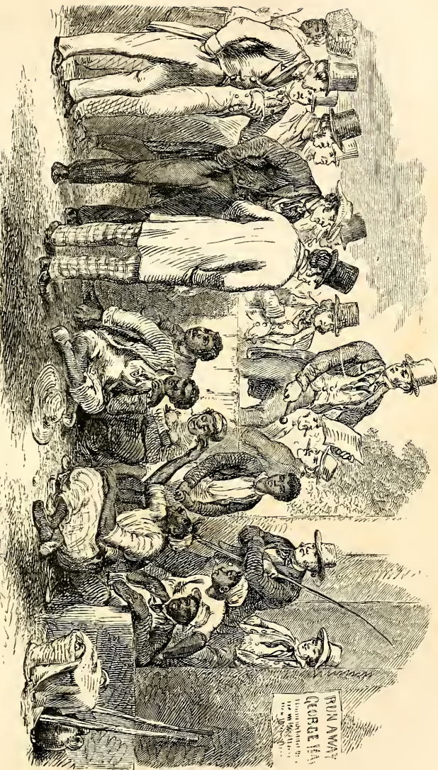
THE AUCTION SALE. Page 171.