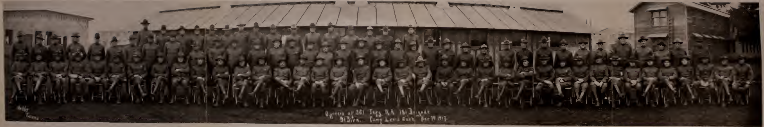
Officers of 361 Togg. N. A. 181 Brigade 9131st. Camp Lewis Wash. Mar 20 1917.