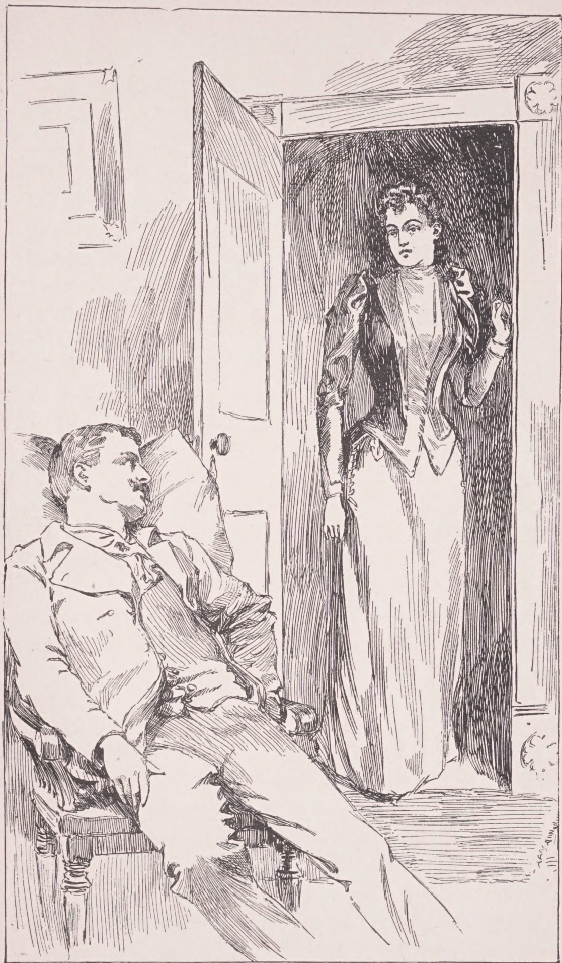
MISS WARREN STOOD IN THE DOORWAY.