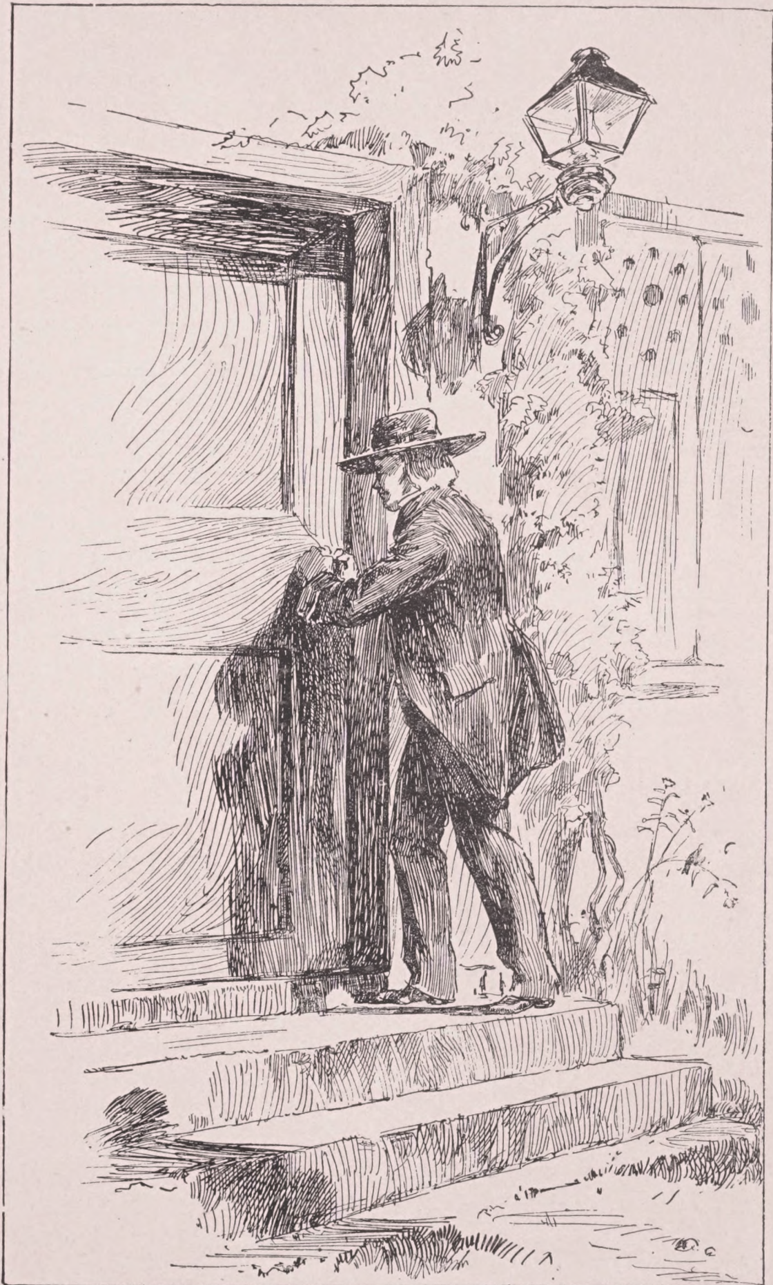
A MAN WAS IN THE ACT OF UNLOCKING THE DOOR.