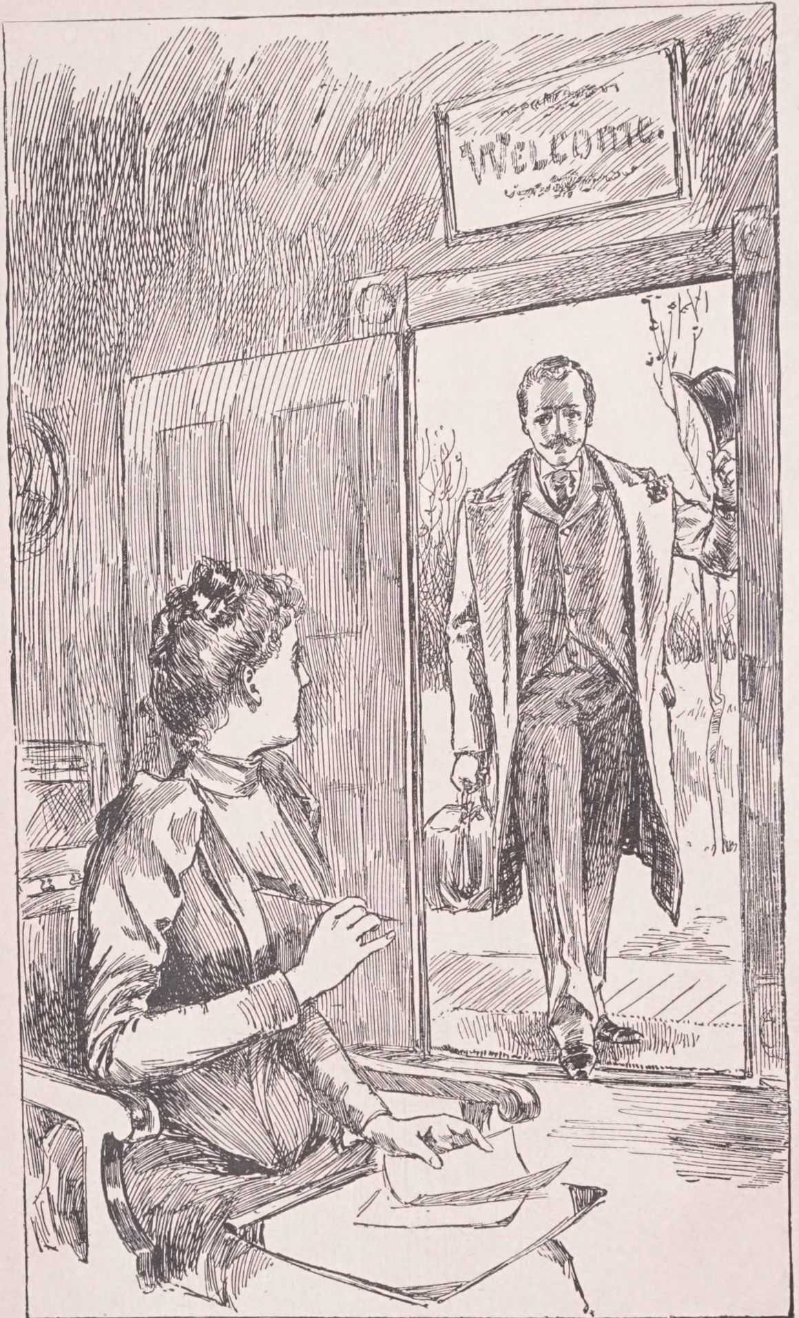
“SHE FELT MY PRESENCE AND LOOKED UP QUICKLY.”