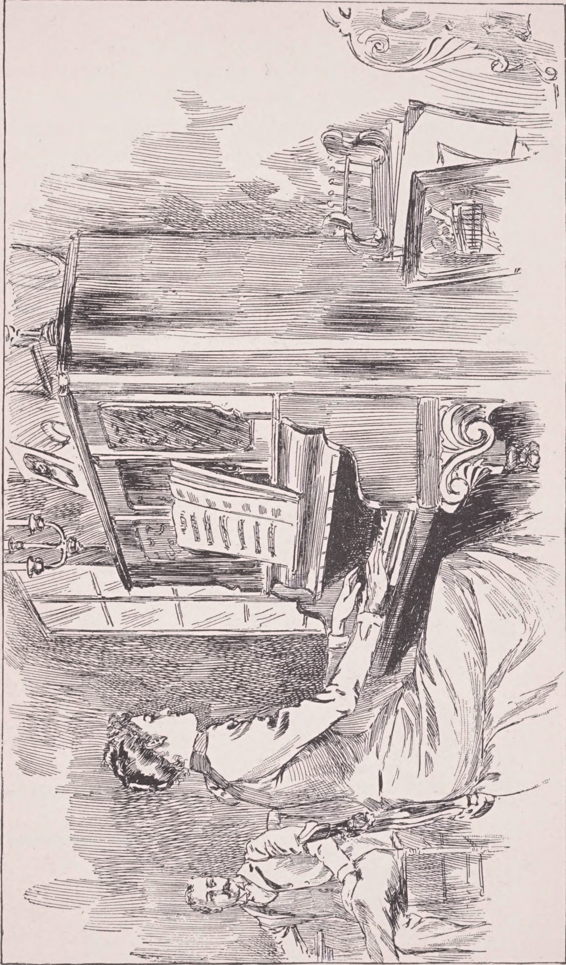
SHE TURNED QUIETLY TO HER PIANO.