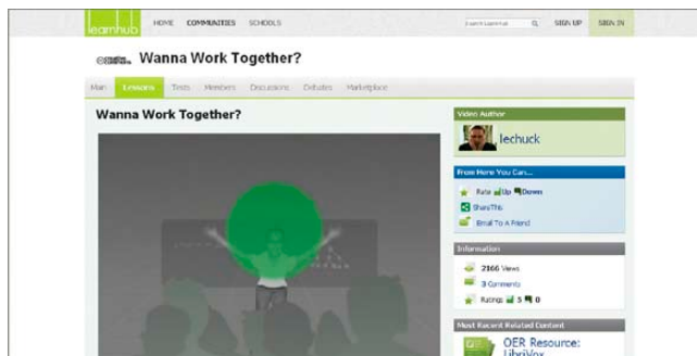
Logo & Screenshot © LearnHub