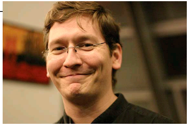
"Creative Commons reception thingy"

It's the abject complexity of the human system and the reality of the knowledge gap about the system. Human bodies