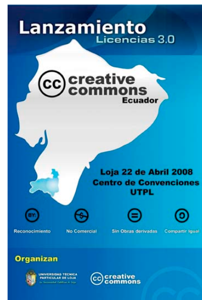
Below

The Universidad Técnica Particular de Loja was founded by the Ecuadorian Marist Association (AME) on May 3rd, 1971. UTPL was officially recognized by the State of Ecuador under Executive Decree 646, in which it was constituted as an autonomous legal entity on the basis of