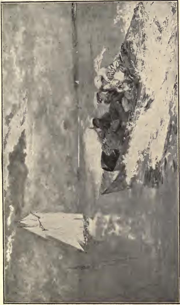
“They eloped in ‘The Geisha,’ leaving New London hurriedly at half past six”