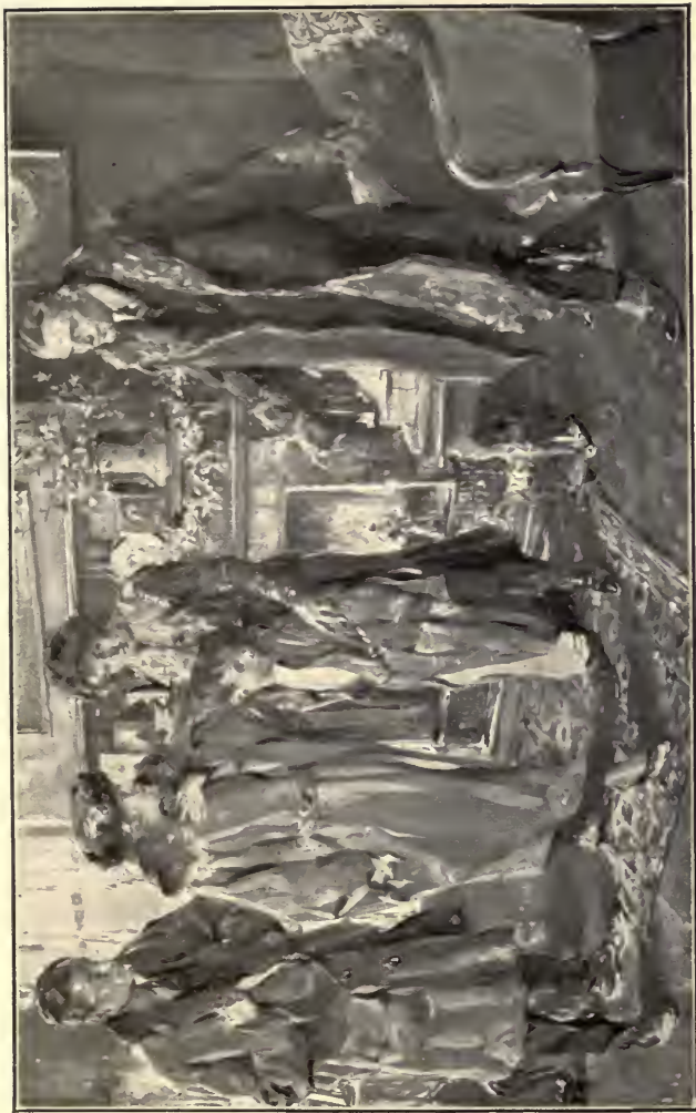
“Richard Carter unexpectedly confronted her in her sister’s home, and begged her to return to ‘Crownlands.’”