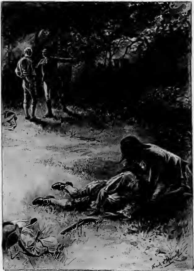
Copyright, 1897, by D. Appleton & Company