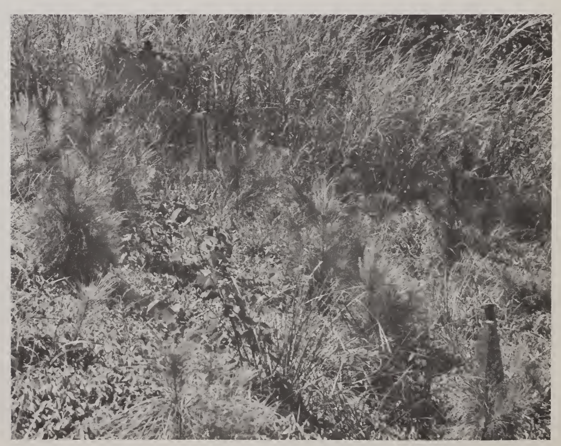
Figure 12. – Volcanic site 12.7 months after planting. Treatment B plot (front) was cleaned 1.4 months earlier and treatment C plot (rear) was cleaned 5.4 months earlier. B still had a ground cover of Centella , while Pennisetum had developed heavily in C.