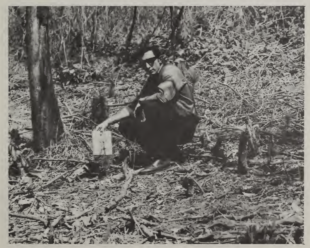
Figure 14. – Volcanic site 4.3 months after planting. This plot had an overstory of hardwoods and received treatment A. It was last cleaned 0.3 month earlier.