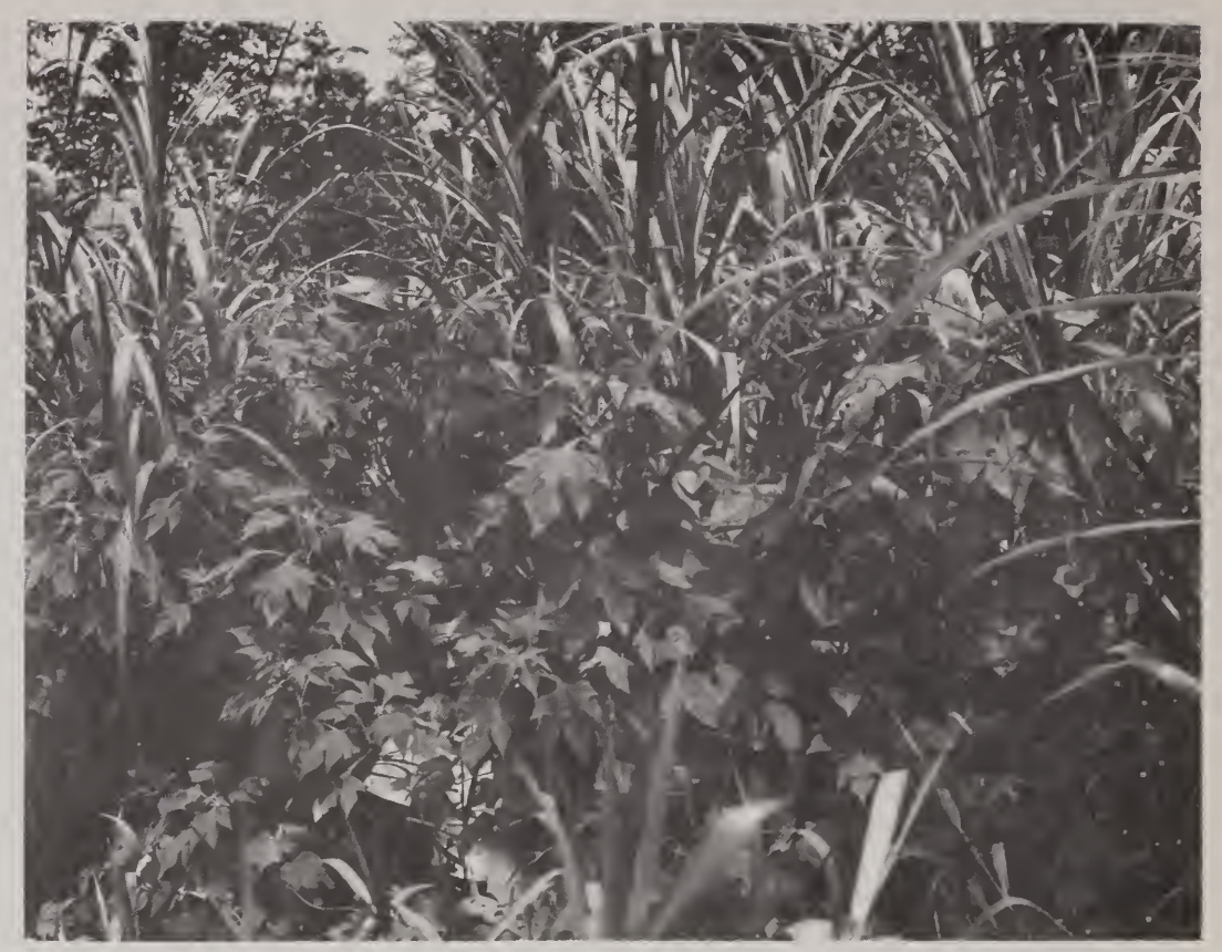
Figure 11. – Volcanic site 9.6 months after planting. Pines in one plot of treatment D were killed by a dense stand of Pennisetum (masked by edge cover of Neuroloena ). Man in center shows weed height.