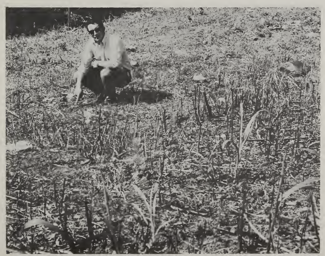
Figure 8. – Volcanic site 0.5 month after planting. This plot quickly became covered with tall grasses. Pennisetum was resprouting 1.1 months after the pre-planting weeding.