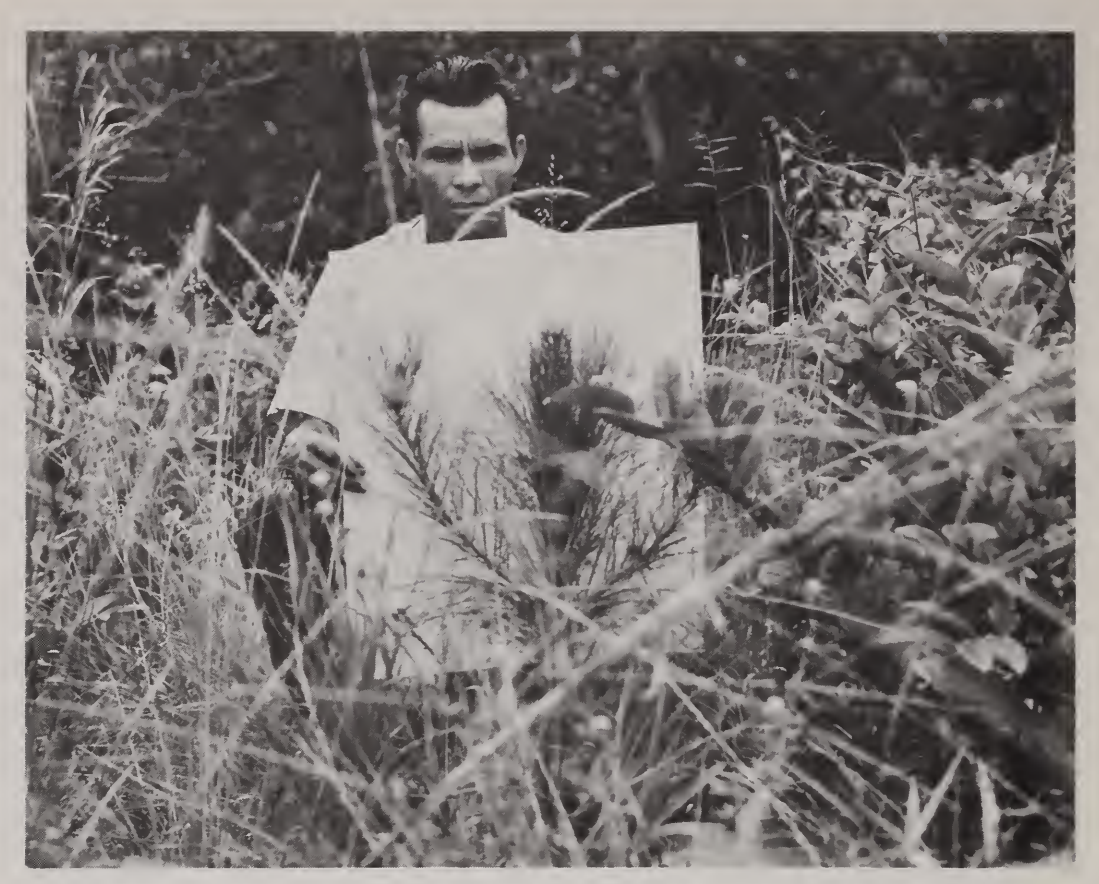
Figure 3. – Granitic site 6.6 months after planting. Pine growing through several grasses and Psidium in a plot unweeded after planting.