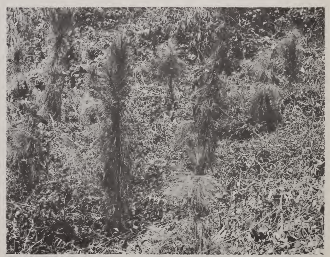
Figure 16. – Volcanic site 17.1 months after planting. Same plot as figures 14 and 15, 0.2 month after the fifth cleaning. Several pines were deformed by weeds and falling limbs.