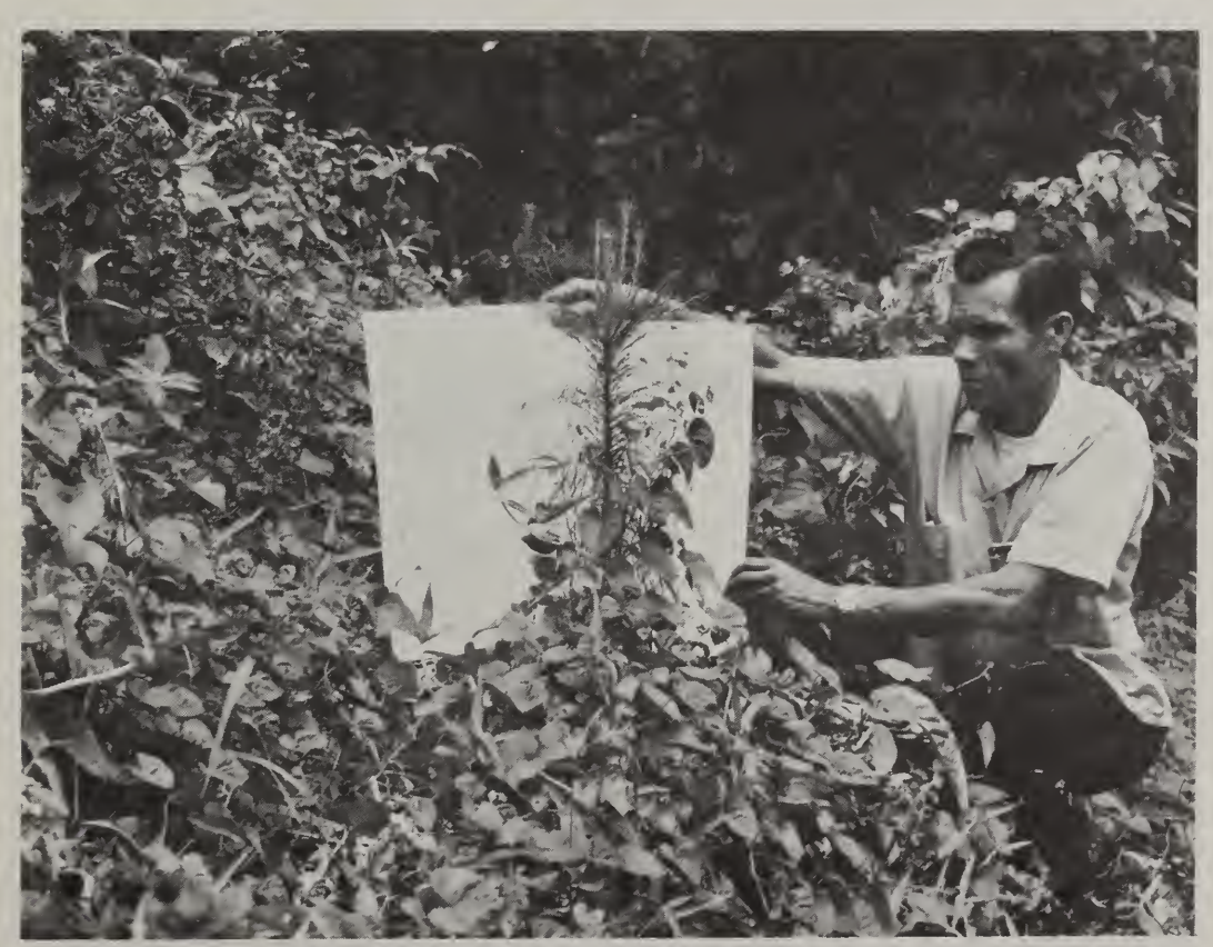
Figure 6. – Granitic site 6.6 months after planting. This pine was one of few in the area beneath the Mangifera that wasn't completely covered by Ipomoea vines.