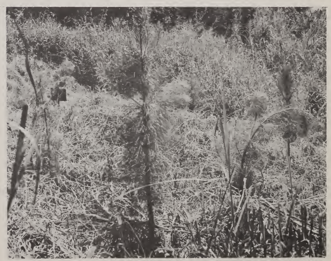
Figure 10. — Volcanic site 20.8 months after planting. Same plot as figure 9. Many pines were deformed by the heavy cover of Panicum and Eriochloa removed a week earlier in a fifth cleaning.