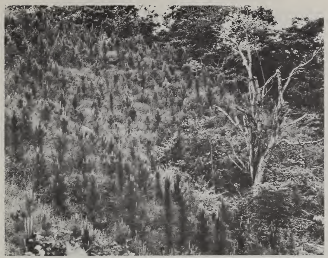
Figure 5. — Granitic site 19.7 months after planting. Pines outgrew the competition except beneath the dead Mangifera and along the lower edge adjacent to woodland.