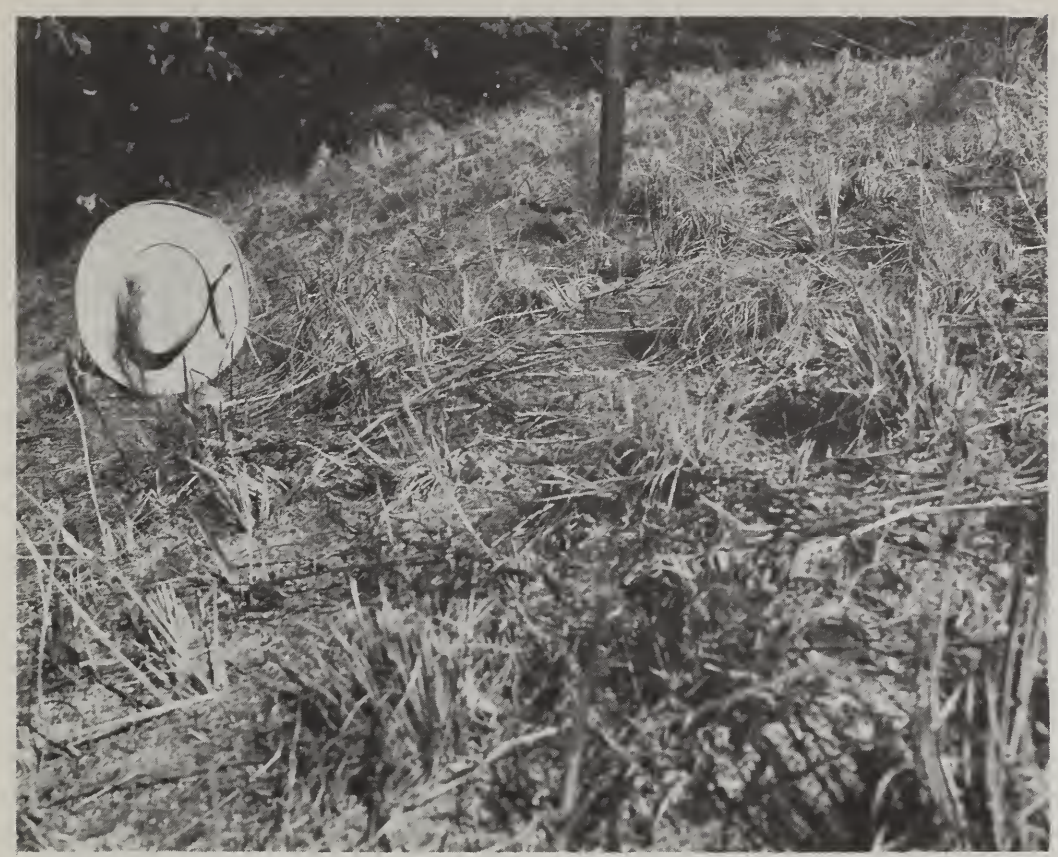
Figure 1. – Granitic site 0.5 month after planting. The site was machete cleaned 2.1 months earlier and MSMA was applied 0.9 months earlier.