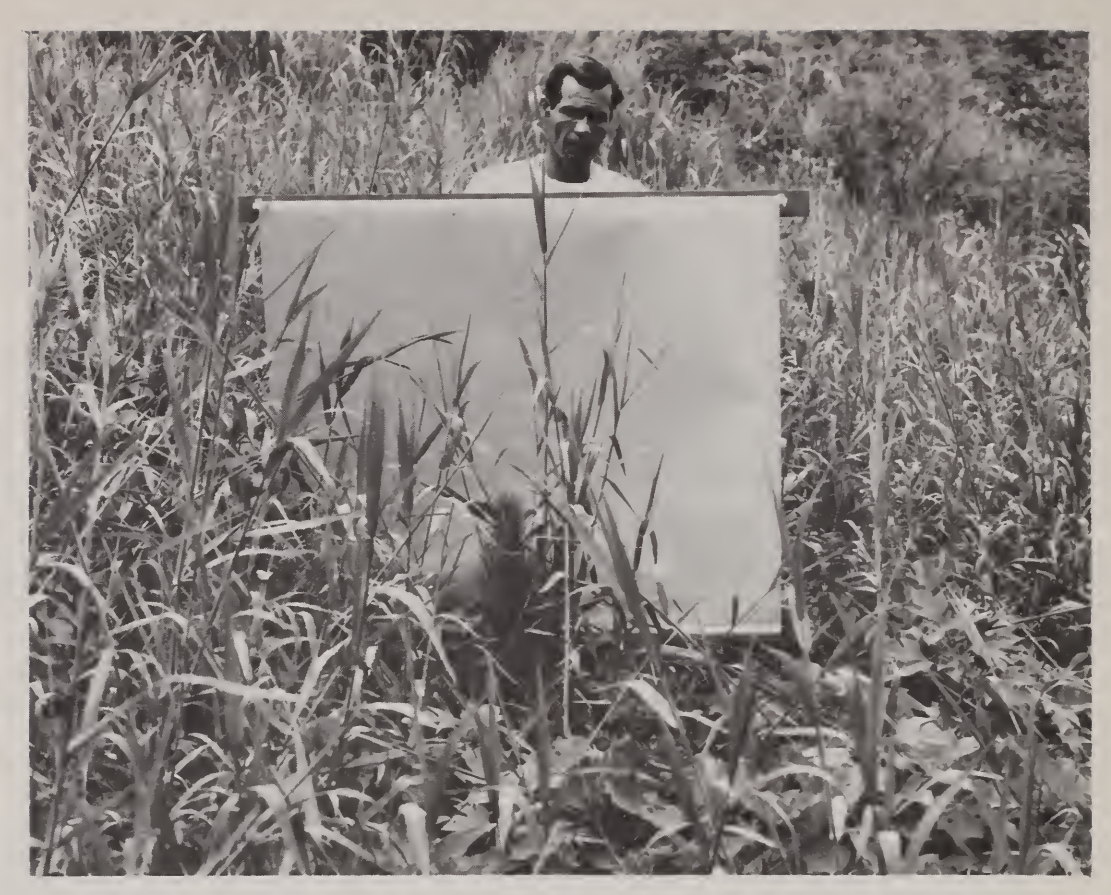
Figure 9. – Volcanic site 9.6 months after planting. Treatment A plot on lower slope 2.3 months after the third post-planting cleaning. Few pines were ahead of the weeds, of which Panicum , Eriochloa , and Urena were prominent.