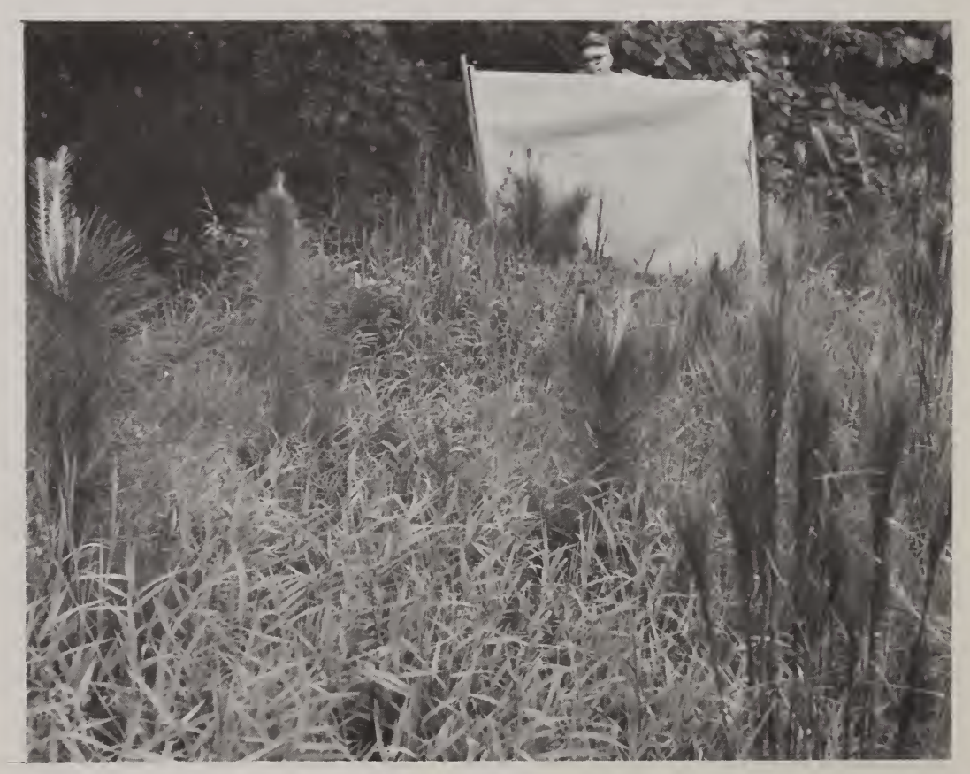
Figure 4. – Granitic site 9.4 months after planting. Pine growing through Melinis and Andropogon in a plot unweeded after planting.