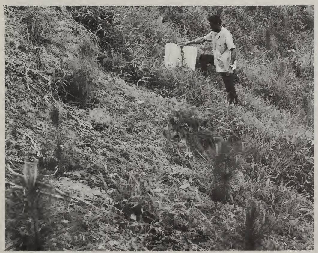
Figure 2. – Granitic site 6.6 months after planting. The foreground was machete cleaned 2.6 months earlier and MSMA was applied 1.6 months earlier. The background wasn't weeded after planting.