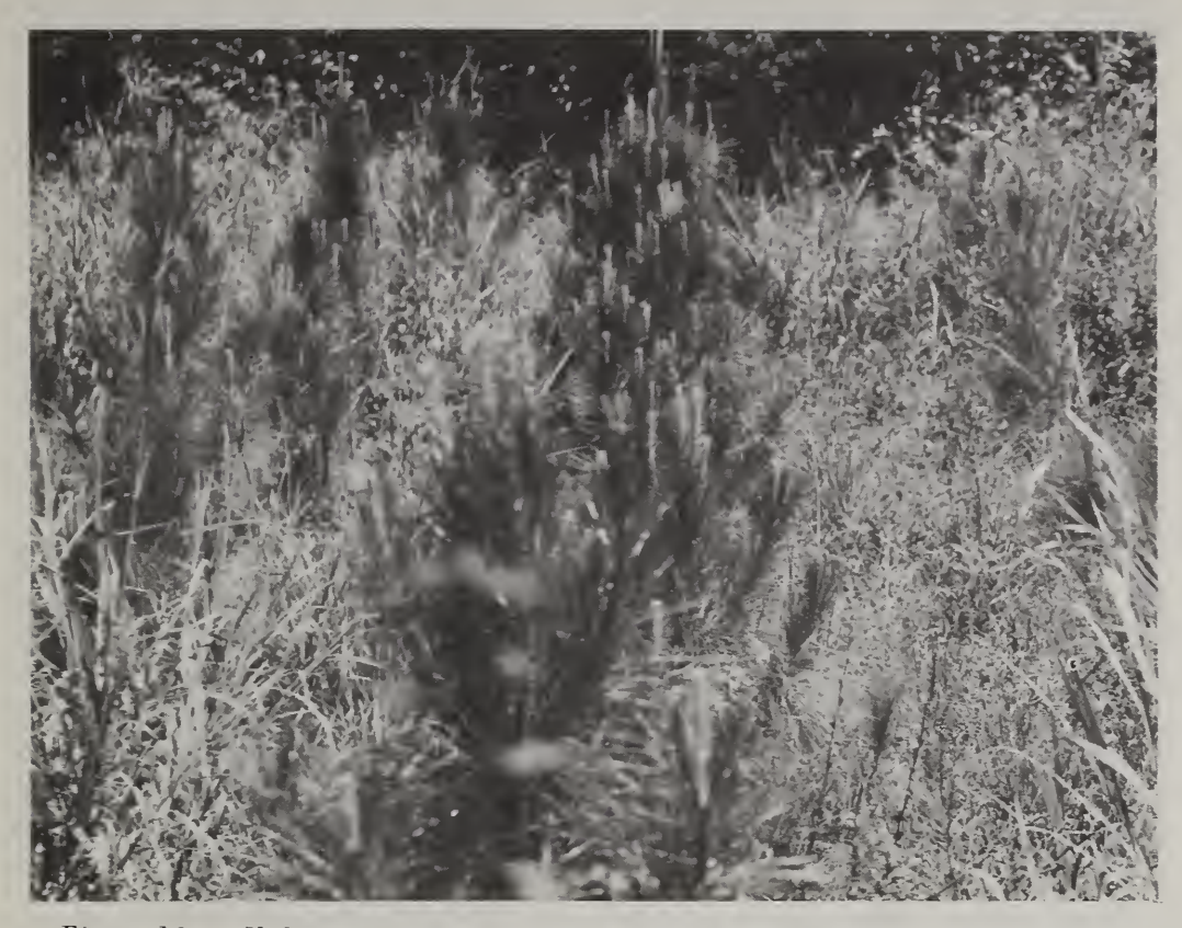
Figure 13. – Volcanic site 17.1 months after planting. Pennisetum did not develop in this plot of treatment B, which was last cleaned 6 months earlier.