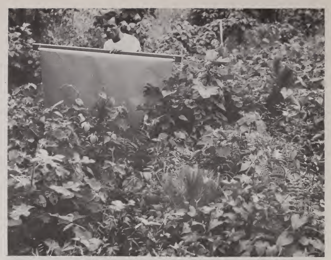
Figure 15. — Volcanic site 9.6 months after planting. Same plot as figure 14, 2.3 months after the third cleaning. Ipomoea was the dominant weedd.