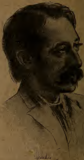
ROBERT LOUIS STEVENSON