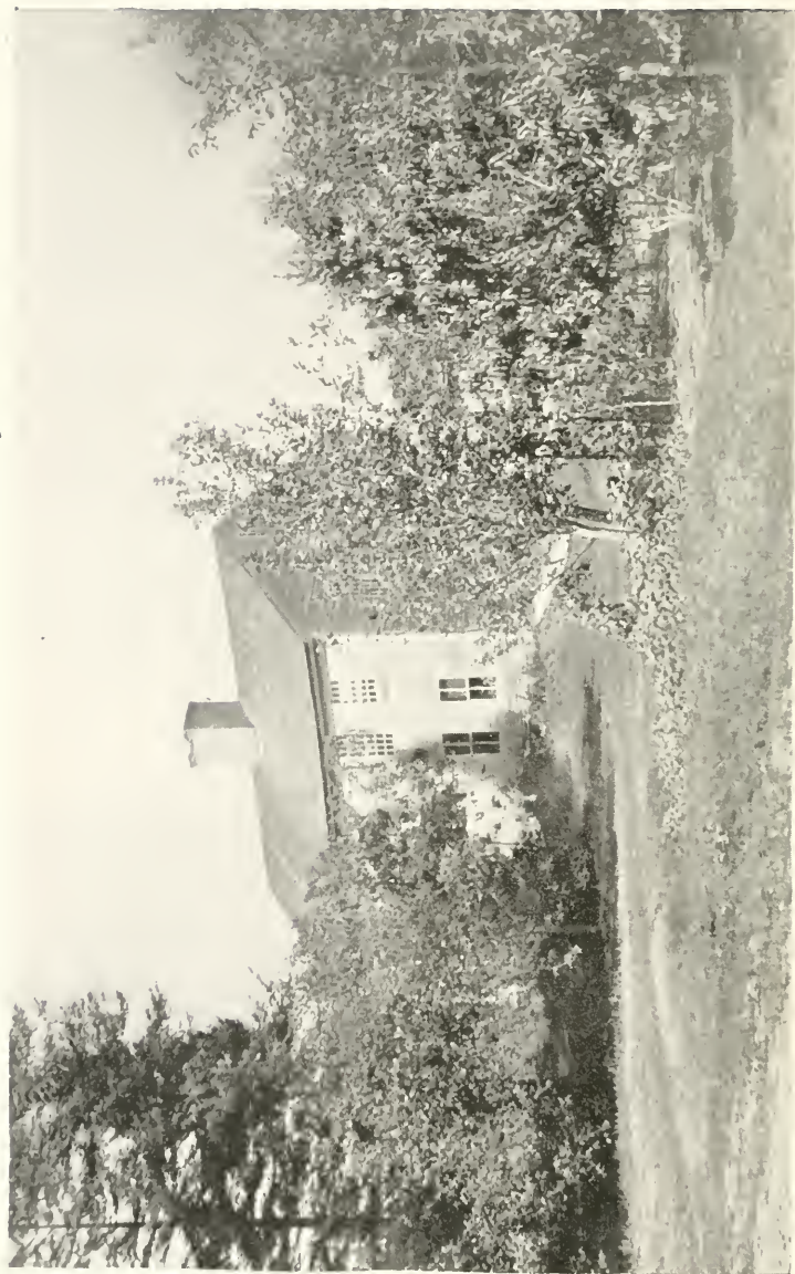
THE STEPHEN LINCOLN HOMESTEAD, OAKHAM, MASS.