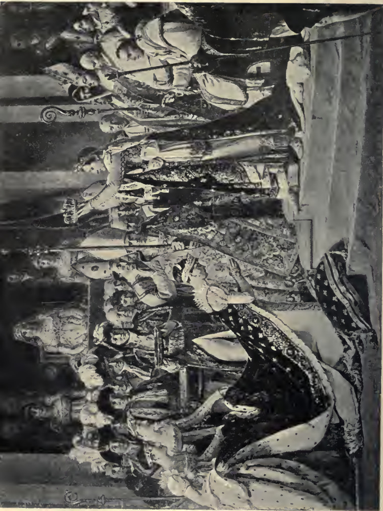
THE CORONATION OF JOSEPHINE.