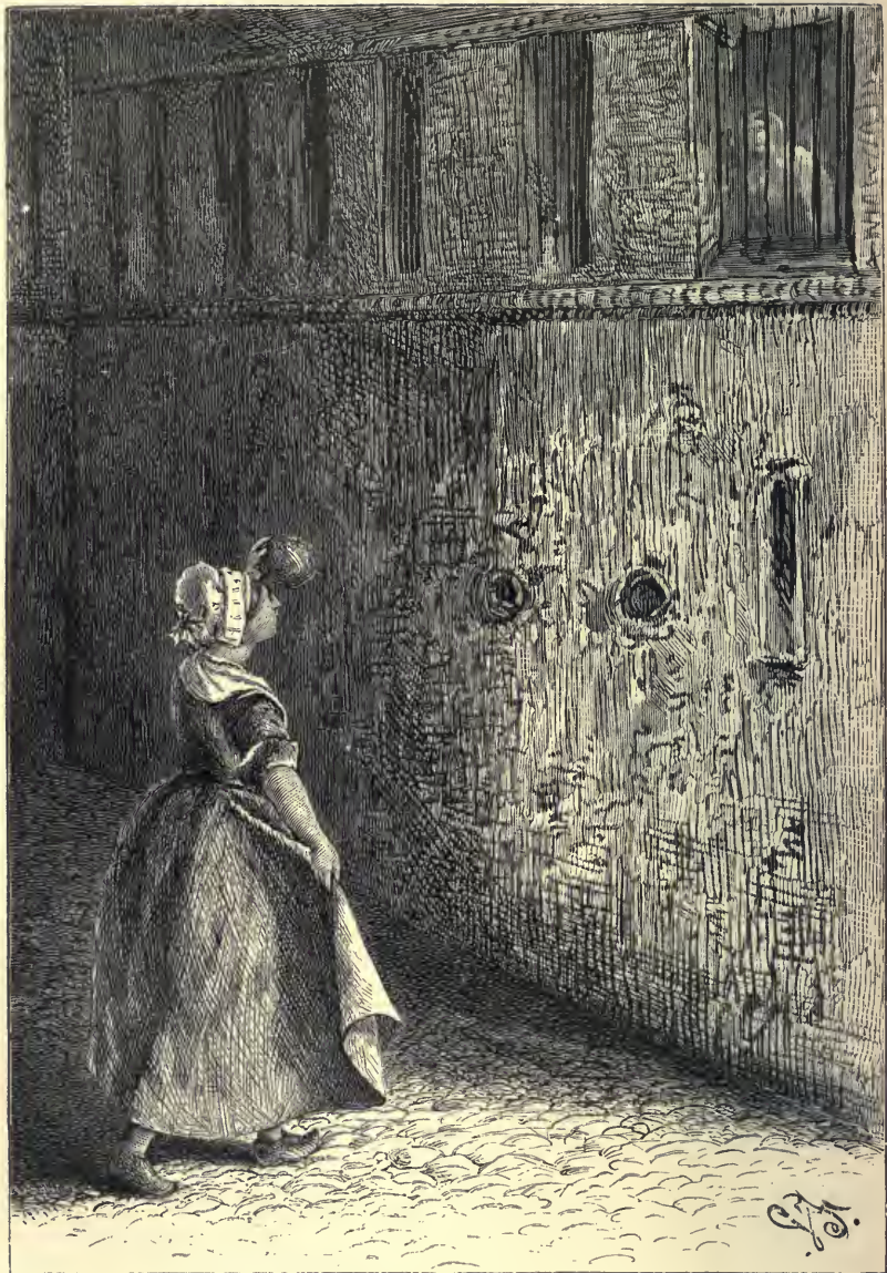
“ ROBES-PIERRE EST MORT.”