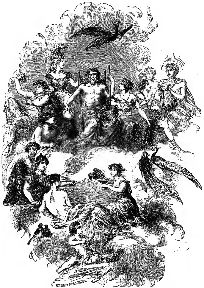
THE COUNCIL OF THE GODS.