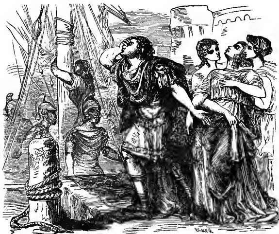
Ceyx and Halcyone.