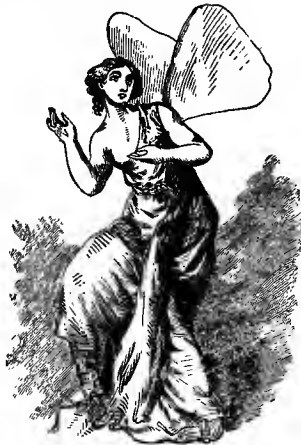
Psyche, in terror of Venus.

Psyche obeyed the commands of Ceres and took her way to the temple of Venus, endeavoring to fortify her mind and ruminating on what she should say and how best propitiate the angry goddess, feeling that the issue was doubtful and perhaps fatal.