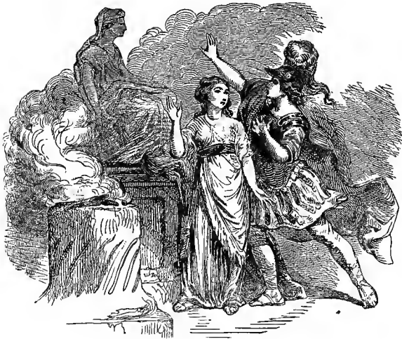
Medea and Jason.