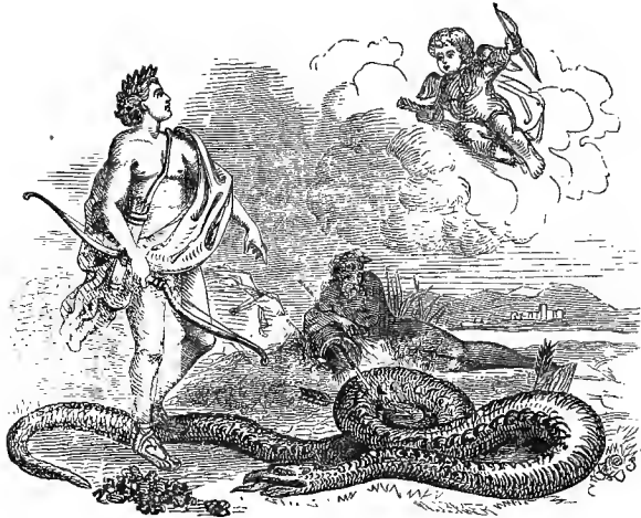
Apollo and Python