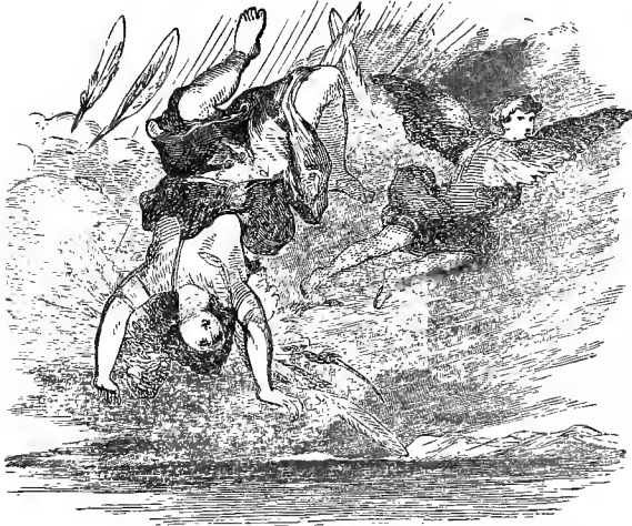
Fall of Icarus.

a gentle curvature like the wings of a bird. Icarus, the boy, stood and looked on, sometimes running to gather up the feathers which the wind had blown away, and then handling the wax and working it over with his fingers, by his play impeding his father in his labors. When at last the work was done, the artist, waving his wings, found himself buoyed upwards and hung suspended, poising himself on the beaten air. He next equipped his son in the same manner, and taught him how to fly, as a bird tempts her young ones from the lofty nest into the air. When all was prepared for flight he said, "Icarus, my son, I charge you to keep at a moderate height, for if you fly too low the damp will clog your wings, and if too high the heat will melt them. Keep near me and you will be safe." While he gave him these instructions and fitted the wings to his shoulders, the face of the father was wet with tears, and his hands trembled. He kissed the boy, not knowing