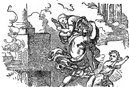
Æneas bearing Anchises from the flames of Troy.