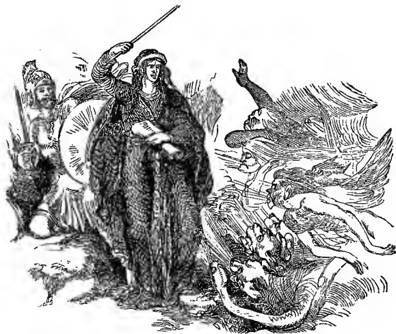
Aeneas and the Sibyl at the entrance to the Infernal Regions.