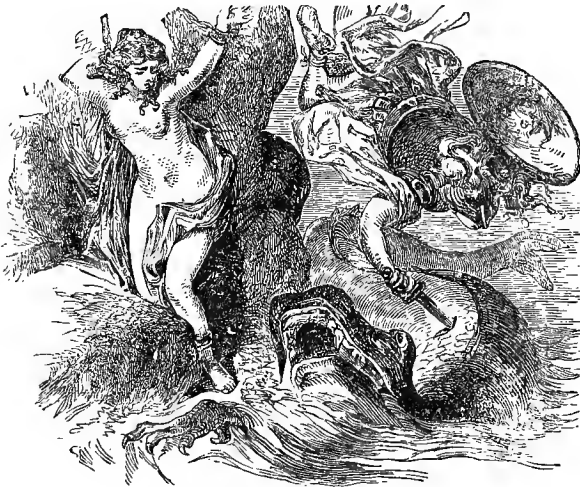
Perseus and Andromeda.

Perseus, continuing his flight, arrived at the country of