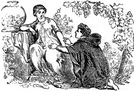
Vertumnus and Pomona.