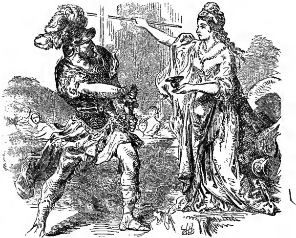
Ulysses and Circe.

Eurylochus hurried back to the ship and told the tale. Ulysses thereupon determined to go himself, and try if by