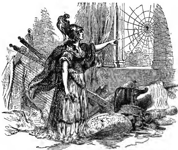
Minerva and Arachne.