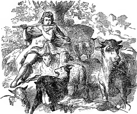
· Apollo keeping the flocks of Admetus.

“— That Nyseian isle, Girt with the river Triton, where old Cham, Whom Gentiles Ammon call, and Libyan Jove, Hid Amalthea and her florid son, Young Bacchus, from his stepdame Rhea's eye.”