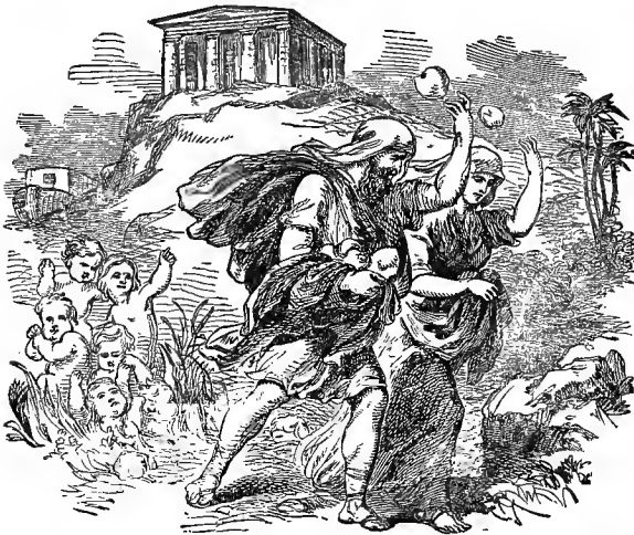
Deucalion and Pyrrha.