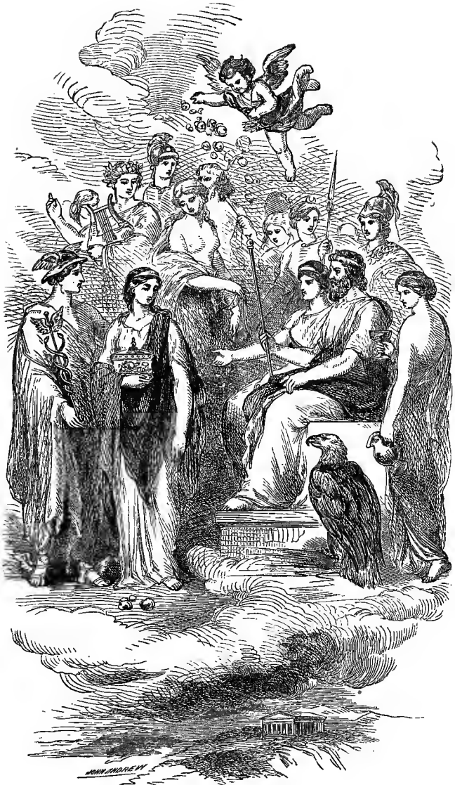
PANDORA. Page 26.