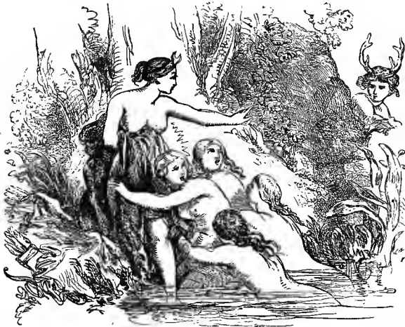
Diana and Actæon.