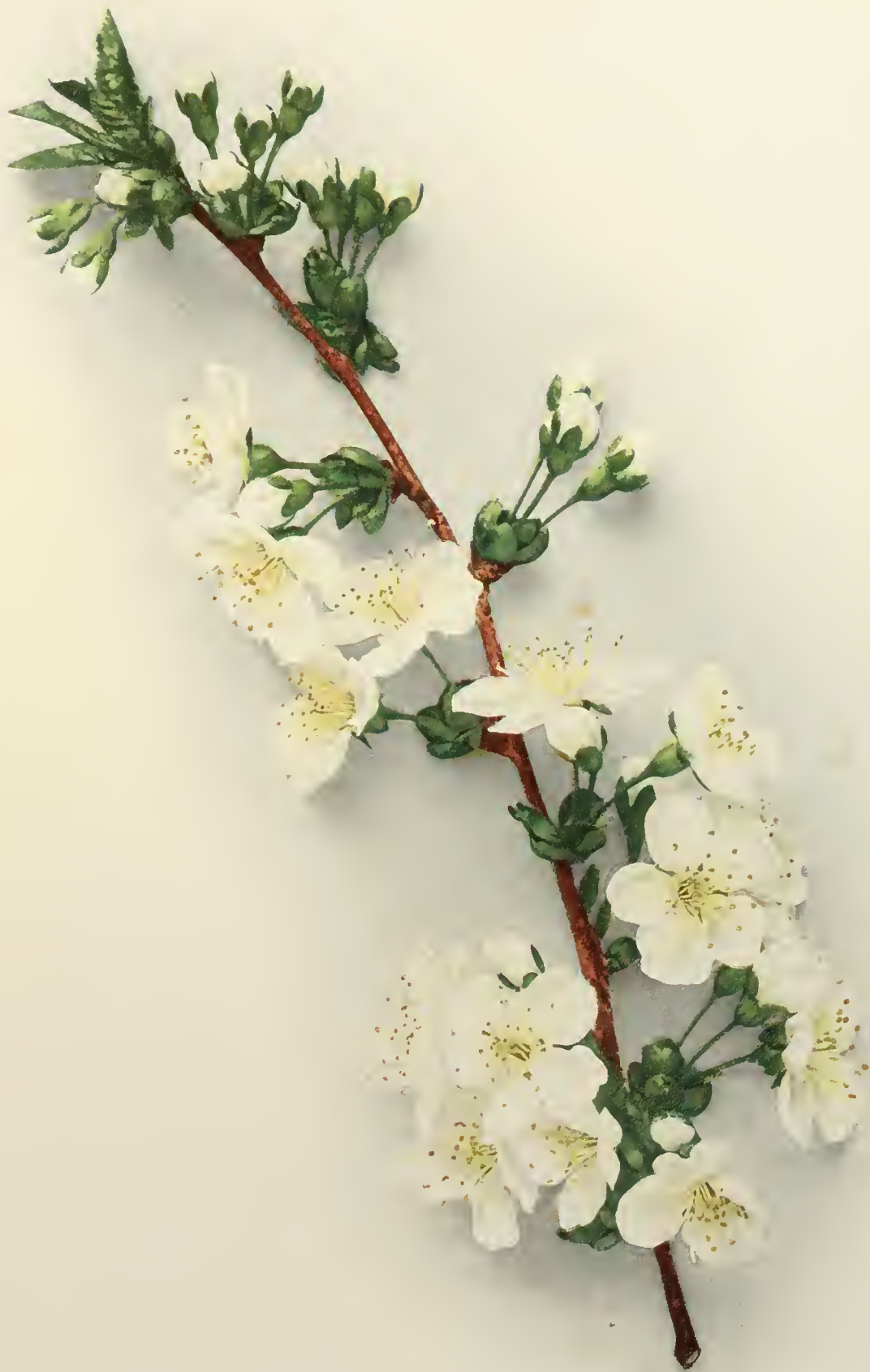
PRUNUS CERASUS (MORELLO GROUP)