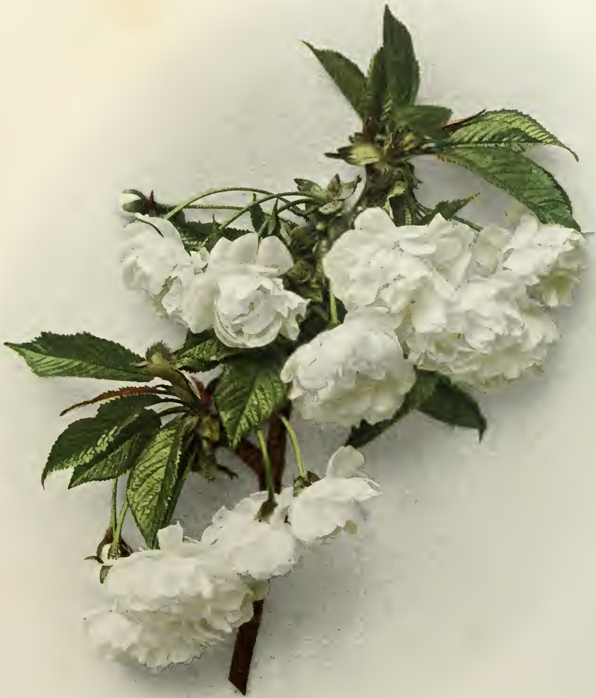
PRUNUS AVIUM (DOUBLE FLOWERING)