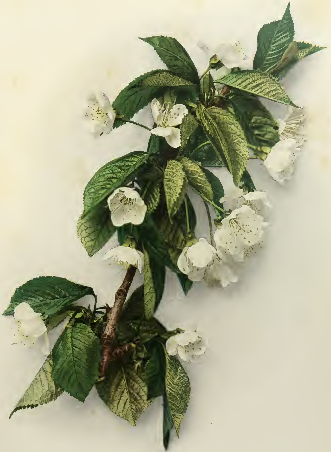
PRUNUS AVIUM (MAZZARD)