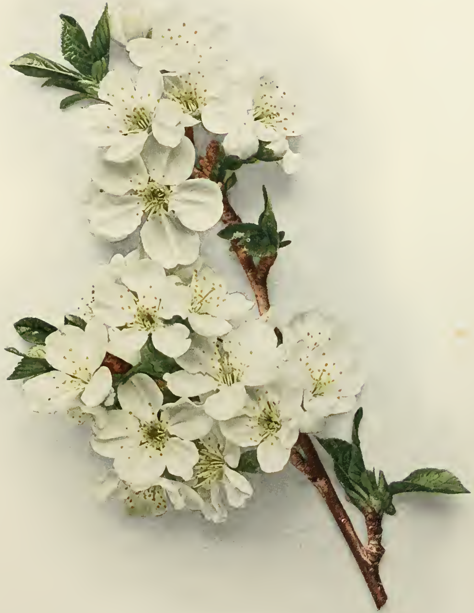
PRUNUS CERASUS (AMARELLE GROUP)