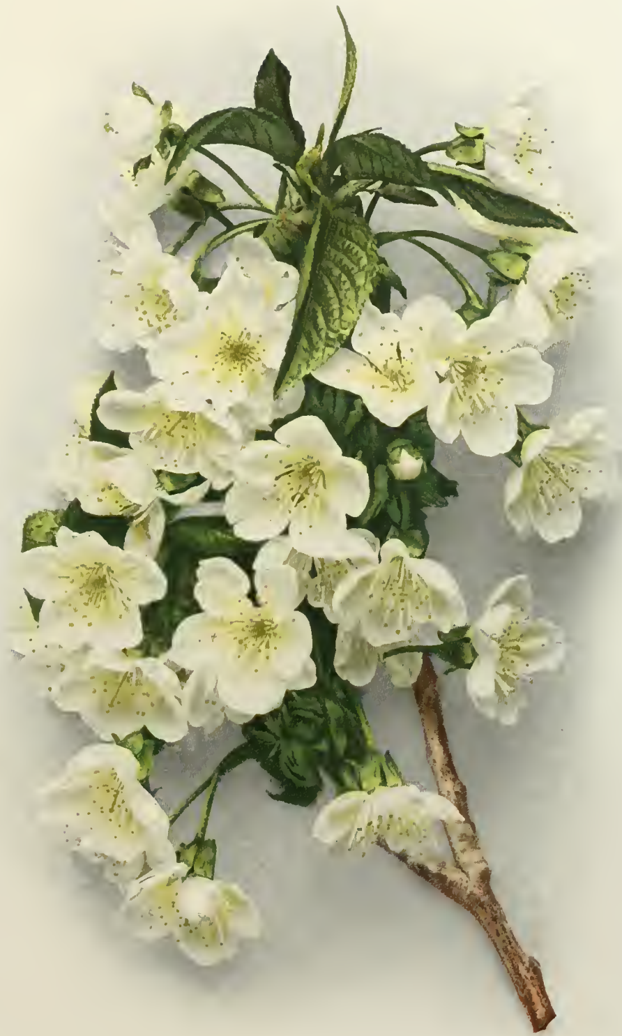
PRUNUS AVIUM X PRUNUS CERASUS (REINE HORTENSE)