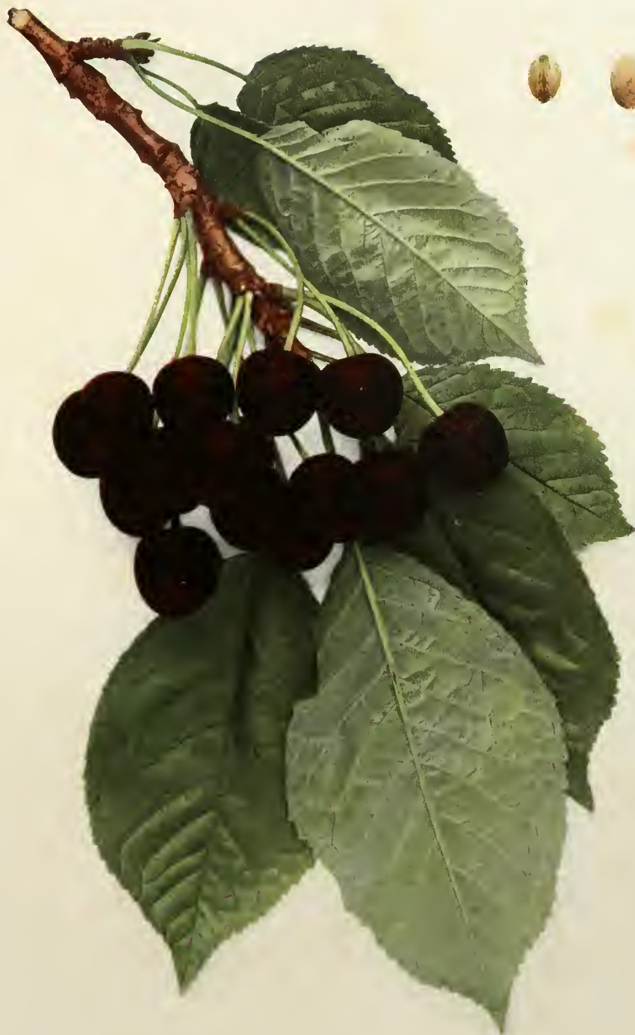
PRUNUS AVIUM (MAZZARD)