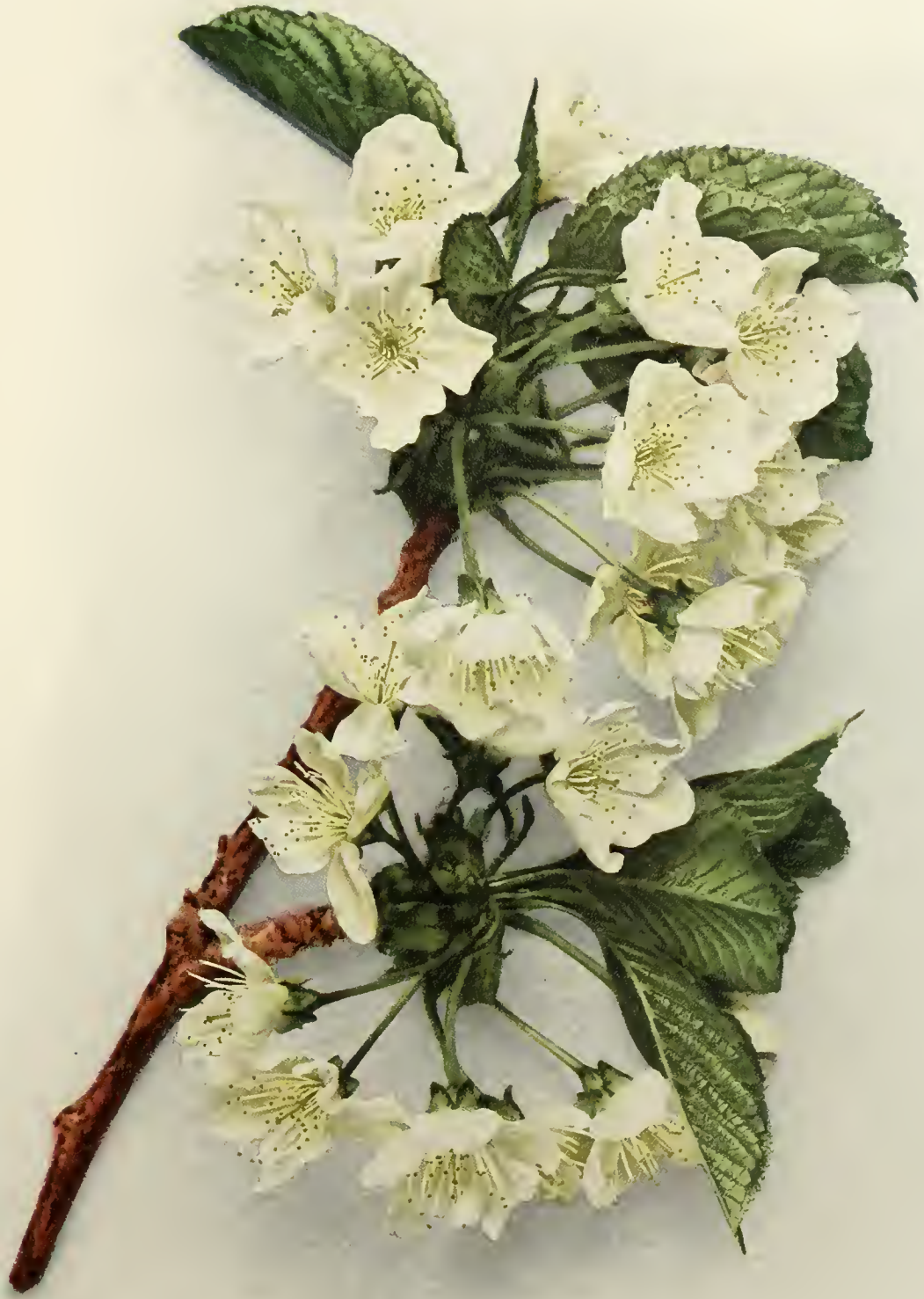
PRUNUS AVIUM (YELLOW SPANISH)