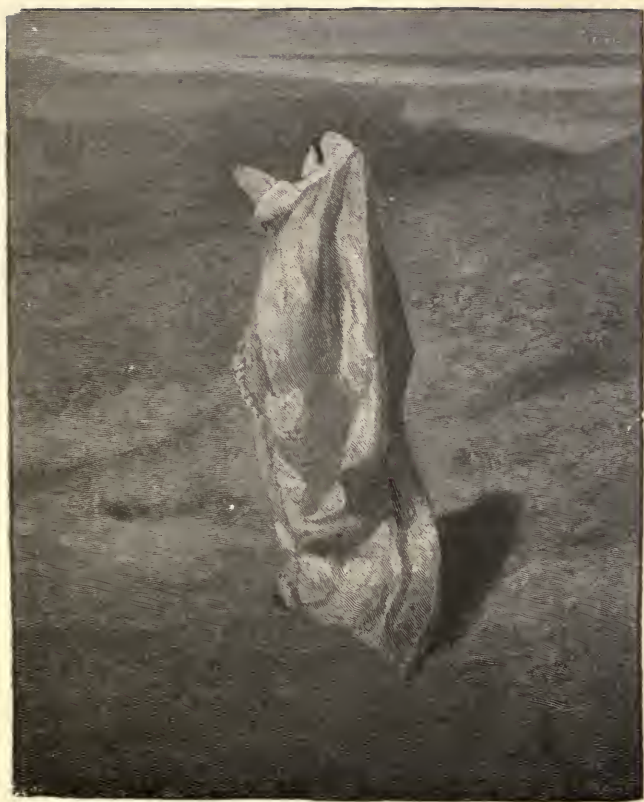
"JUDITH." Page 173.