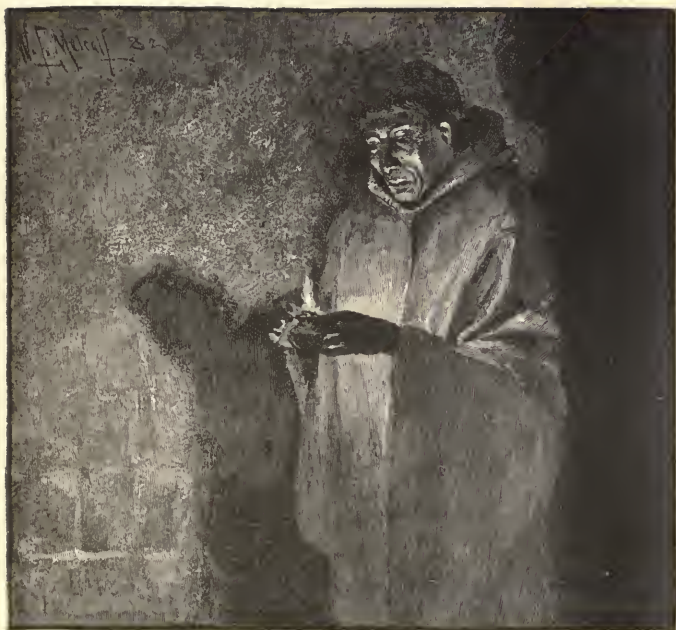
"FRIAR JEROME." Page 116.