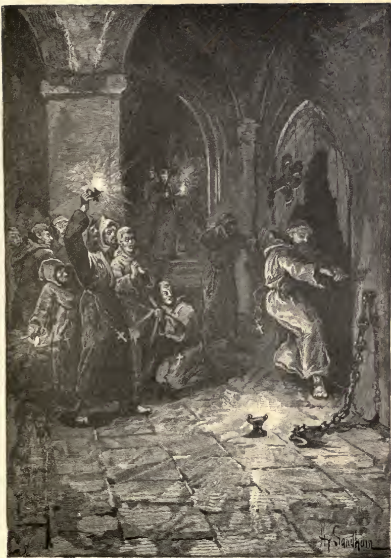
"LEGEND OF ARA-CÆLI," Page 163.