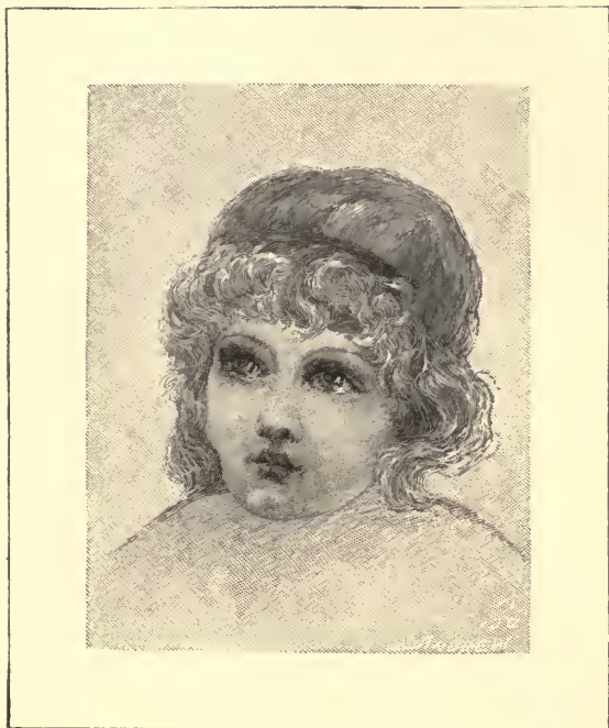
"BABY BELL." Page 73.