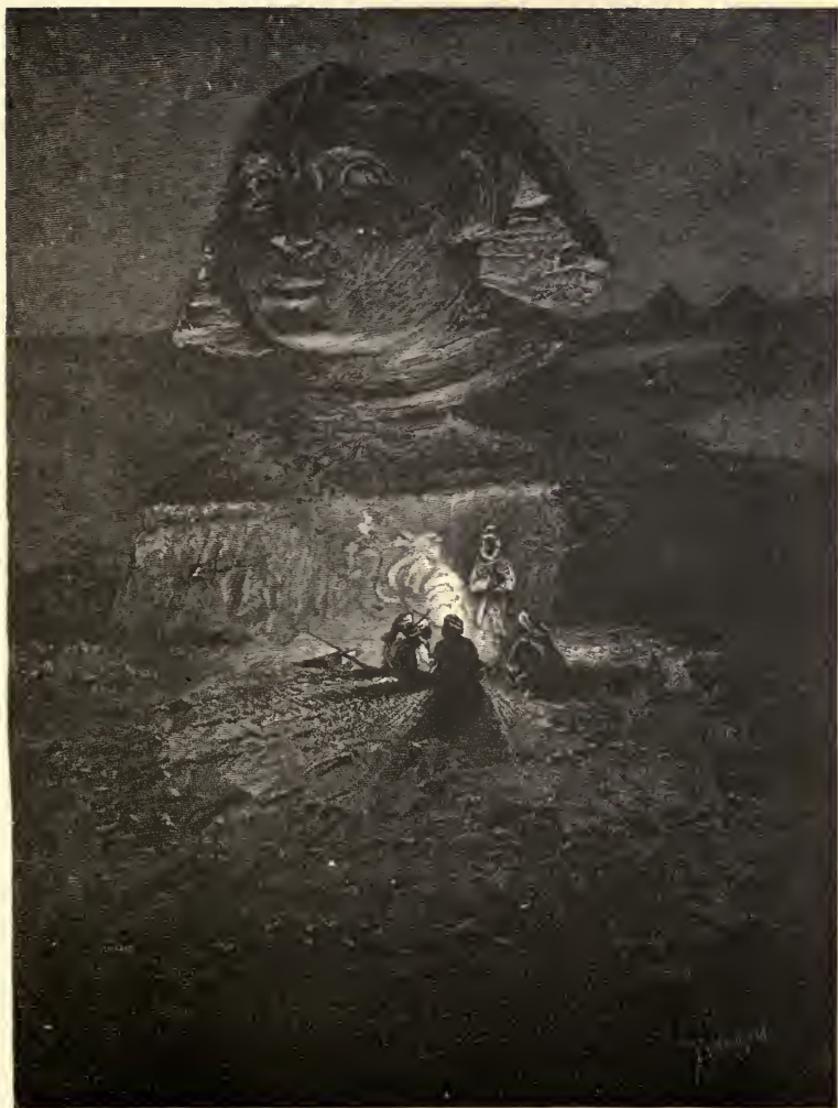
"EGYPT." Page 203.