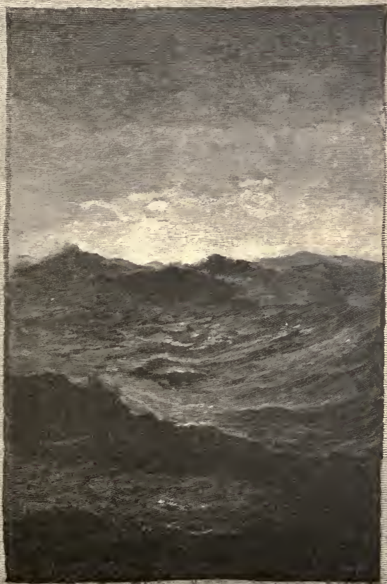
"MOONRISE AT SEA." Page 223.