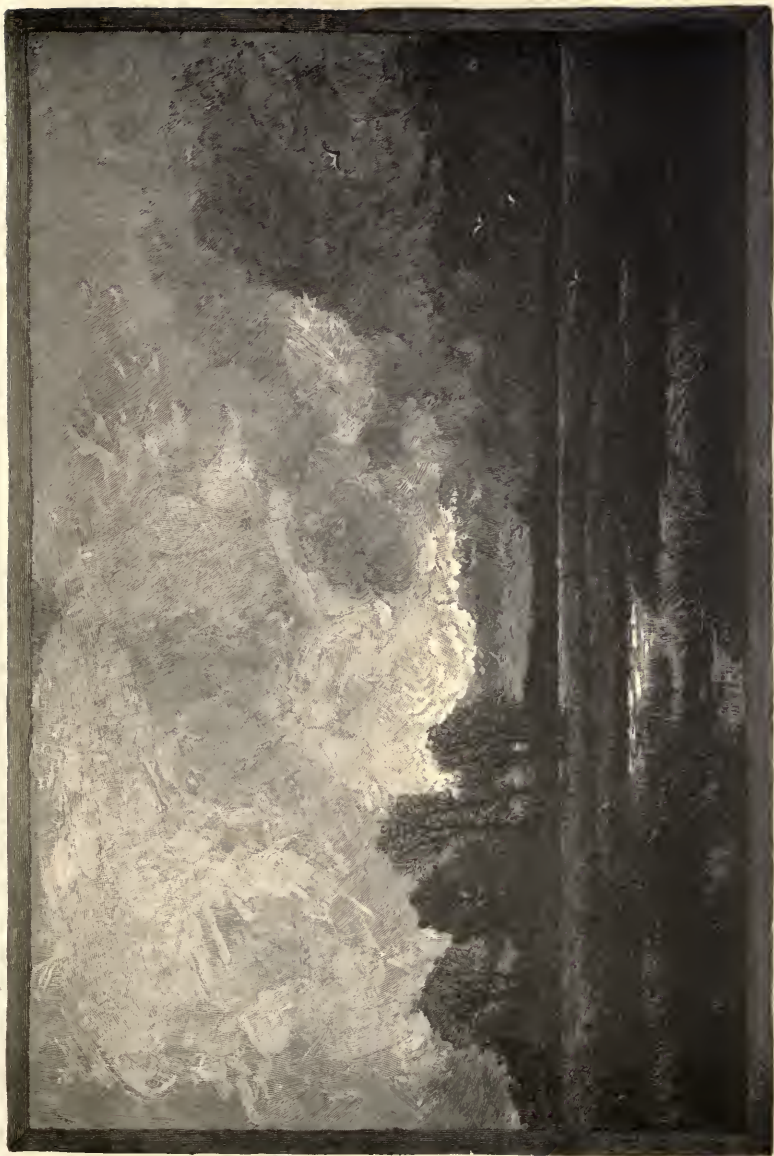
"SPRING IN NEW ENGLAND." Page 68.