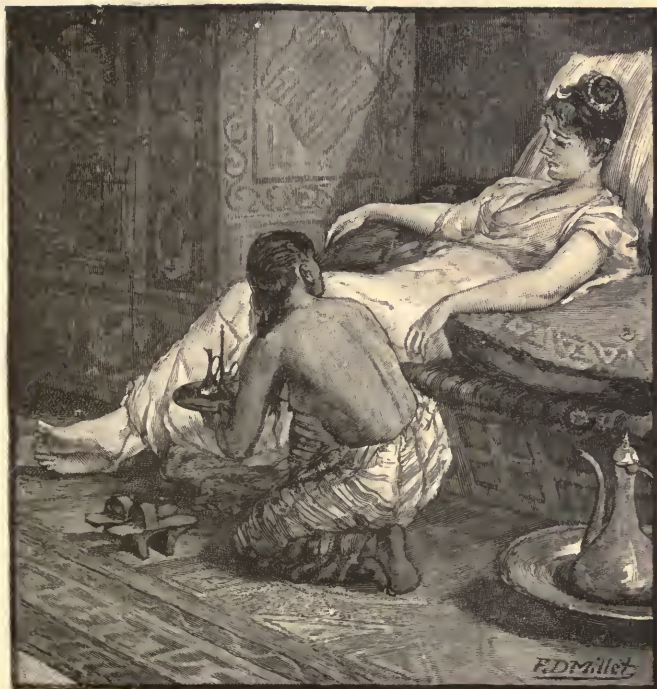
"DRESSING THE BRIDE." Page 21.