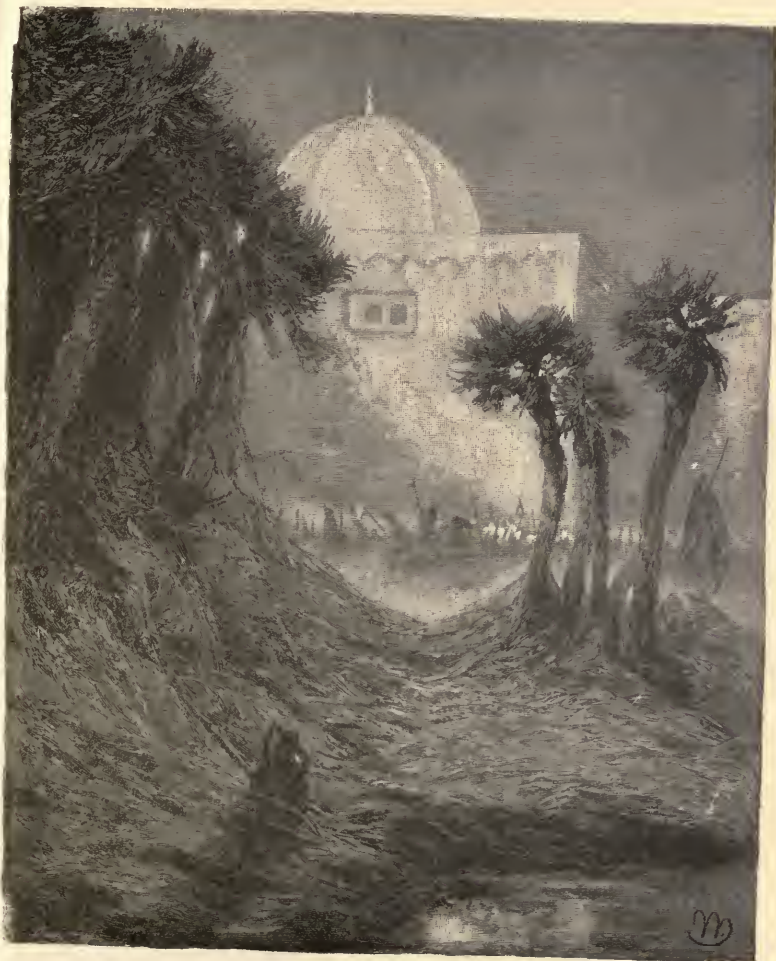
"WHEN THE SULTAN GOES TO ISPAHAN." Page 28.