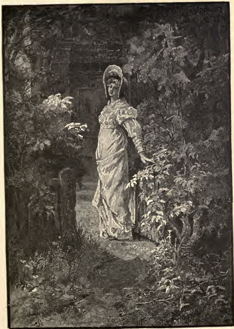
"THE QUEEN'S RIDE." Page 08.