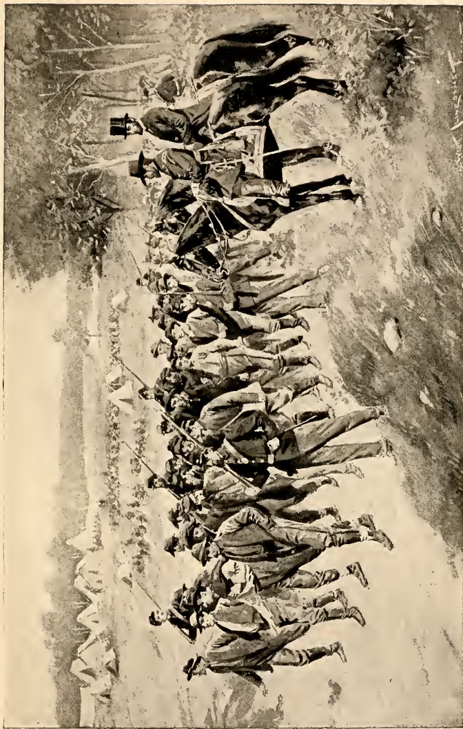
PRESIDENT LINCOLN AND GENERAL GRANT INSPECTING A BODY OF PRISONERS