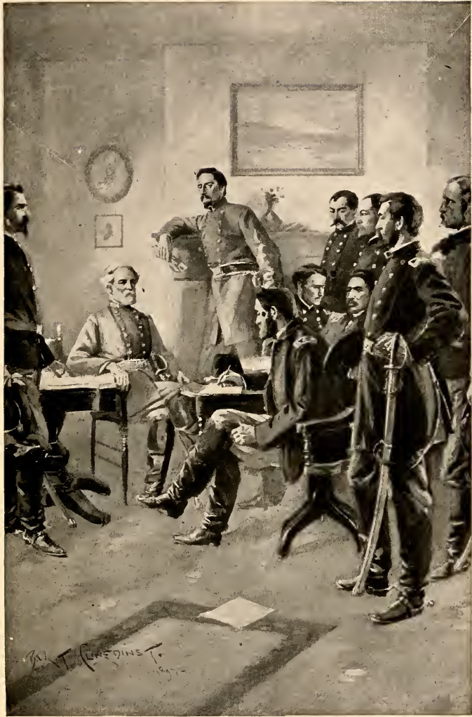
THE SURRENDER: GENERAL GRANT AND GENERAL LEE AT APPOMATTOX