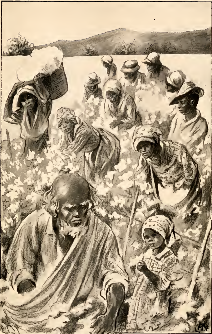
SLAVES AT WORK IN THE COTTON FIELDS