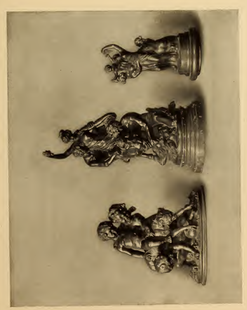
Nos. 76, 77 and 78. GROUP OF BRONZES By Clodion