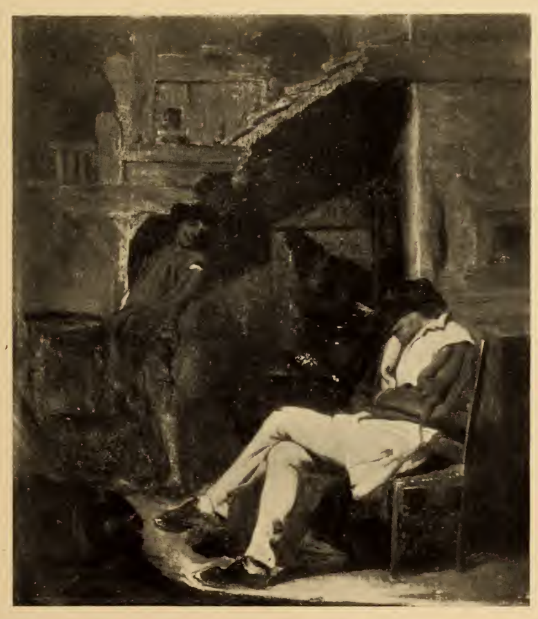
No. 605. THE SIESTA Honoré Daumier