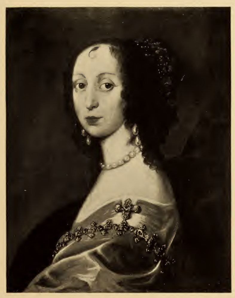
No. 598. MARGUERITE, DUCHESS OF CLEVELAND By Sir Antony Van Dyck