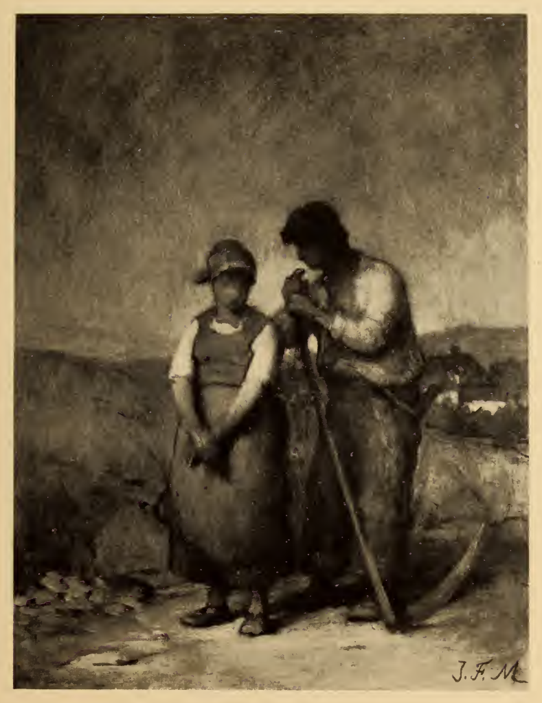
No. 602. LOVERS IN THE HARVEST FIELD By Jean François Millet