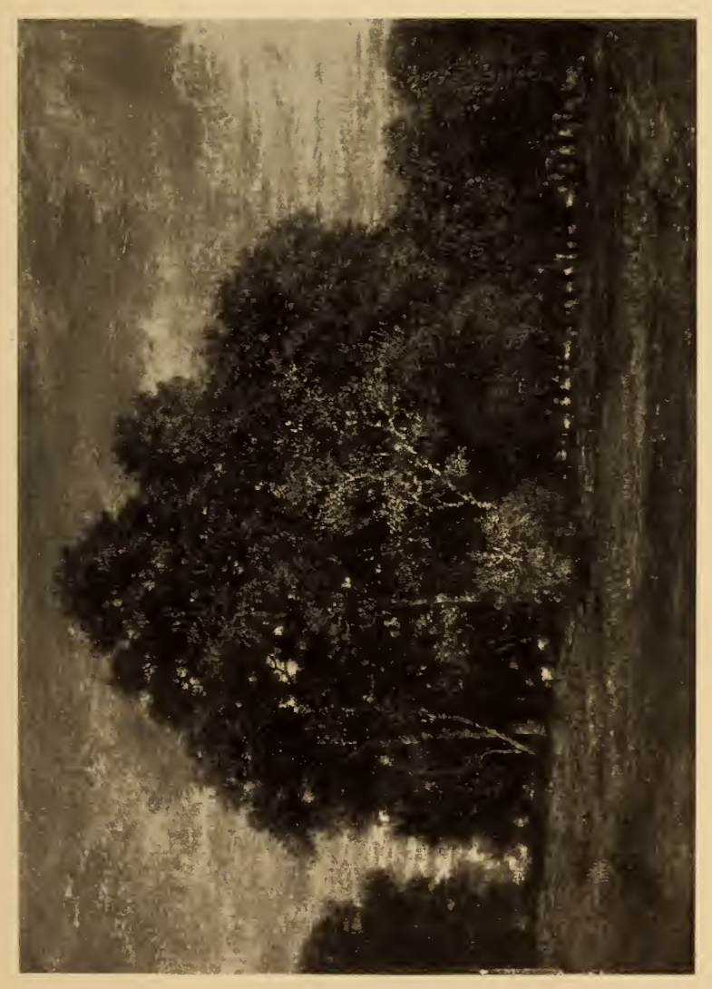
No. 180. SUNSET By Théodore Rousseau