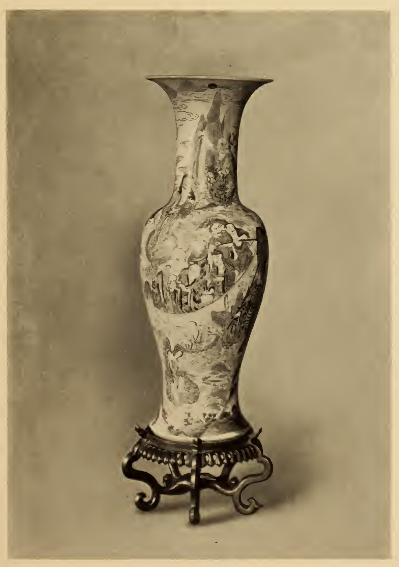
No. 522. SAN TSAI CHINESE PORCELAIN VASE OF THE KANG-SI PERIOD