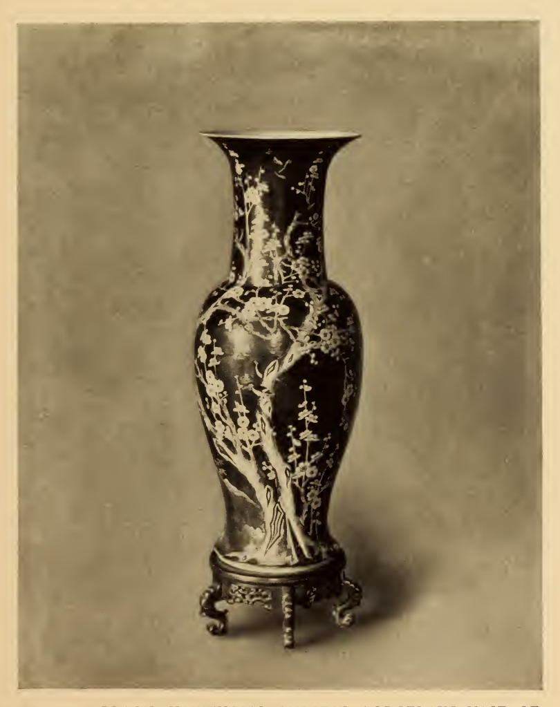
No. 546. BLACK HAWTHORN CHINESE PORCELAIN VASE OF THE KANG-SI PERIOD