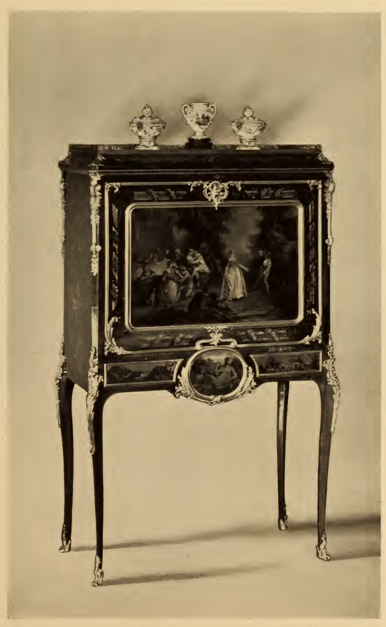
No. 327. LOUIS XVth SECRETARY IN VERNIS MARTIN No. 35. CROWN DERBY GARNITURE OF THREE PIECES