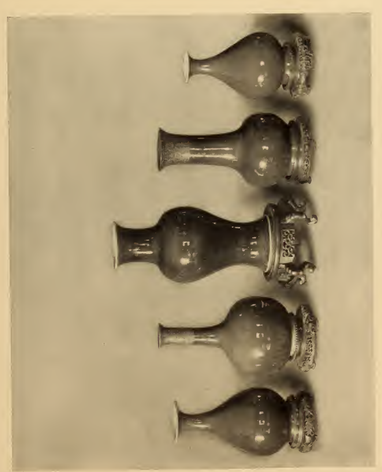
GROUP OF CHINESE PORCELAINS OF SINGLE COLOR