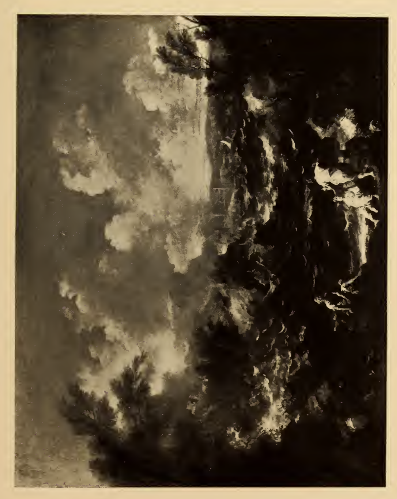
No. 411. THE STORM ON THE COAST By Salvator Rosa