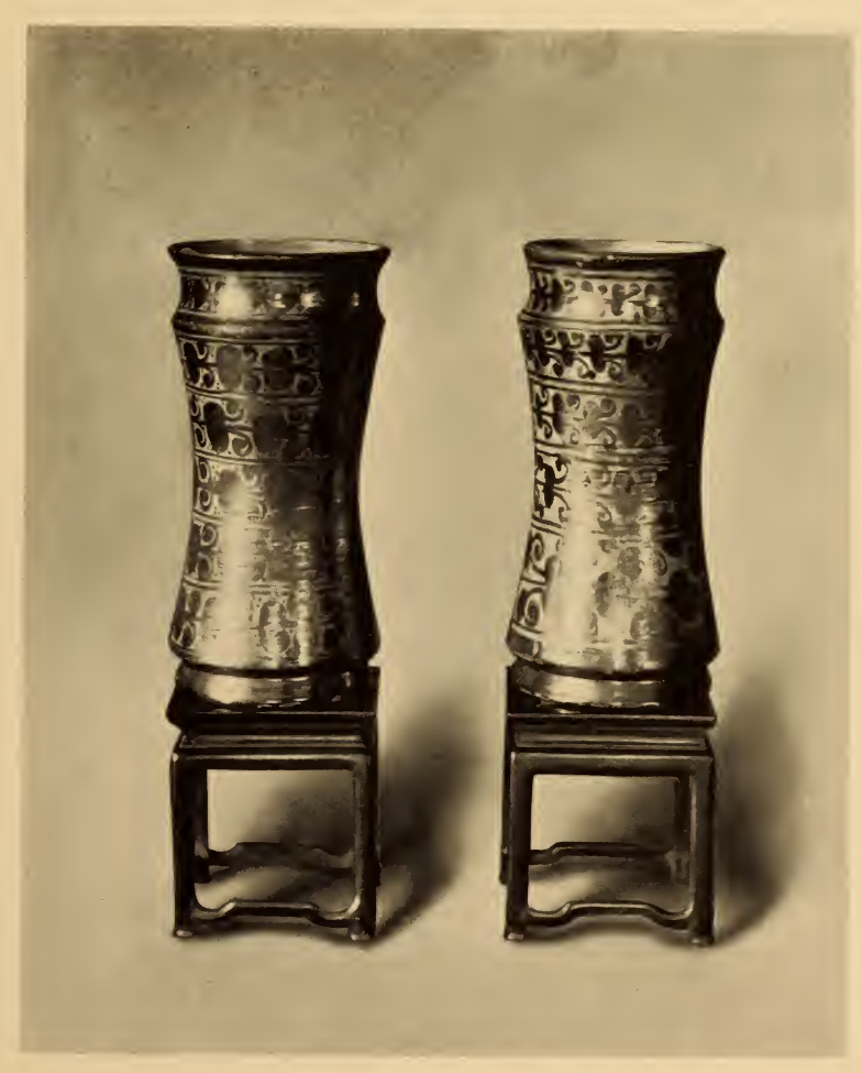
No. 37. ORIGINAL HISPANO-MAURESQUE VASES