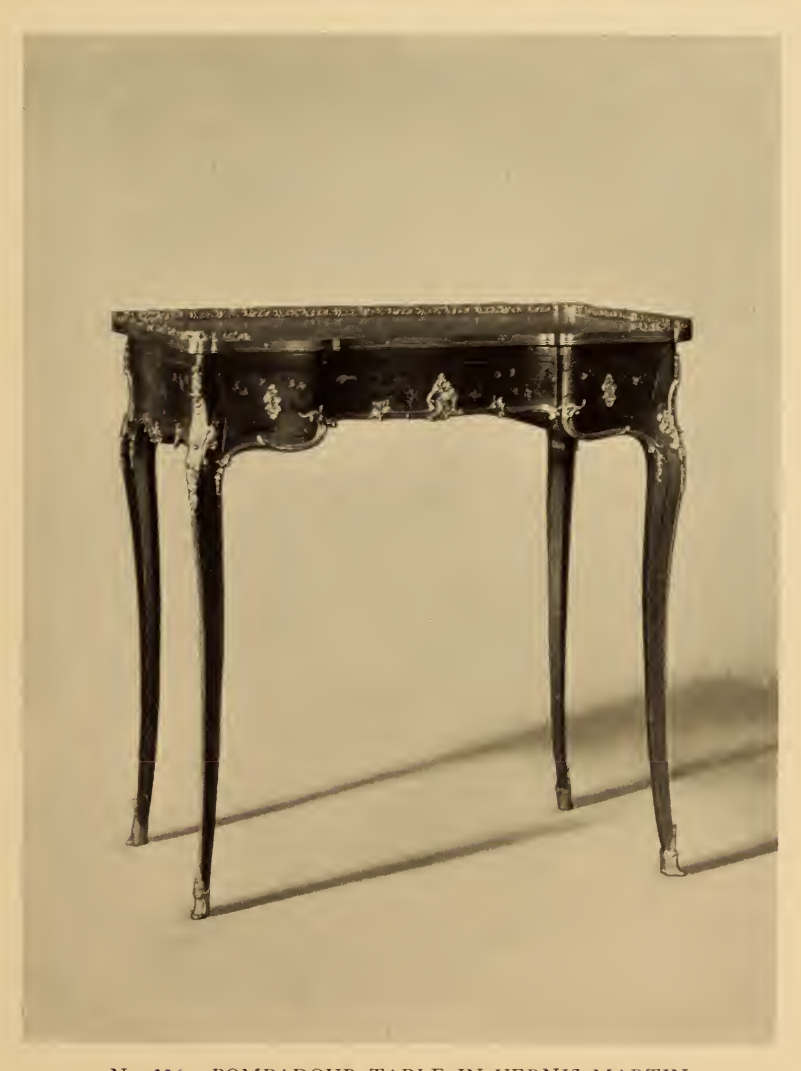
No. 326. POMPADOUR TABLE IN VERNIS MARTIN