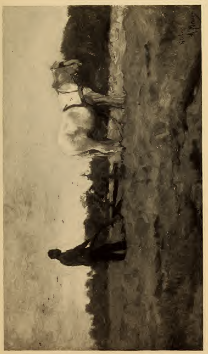
No. 601. PLOUGHING By Anton Mauve