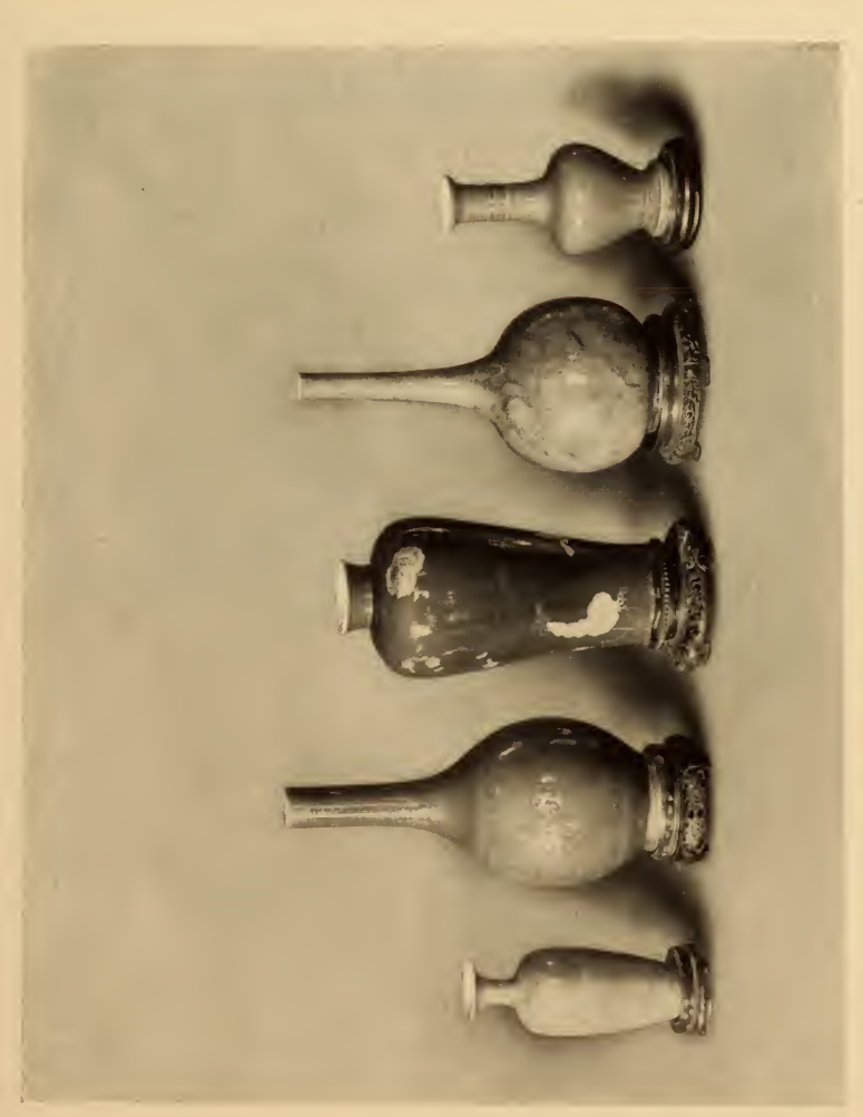
GROUP OF DECORATED CHINESE PORCELAIN VASES