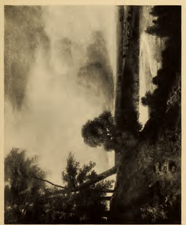
No. 630. LANDSCAPE By Georges Michel