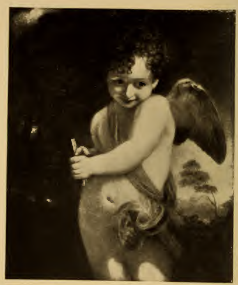
No. 396. CUPID By Sir Joshua Reynolds