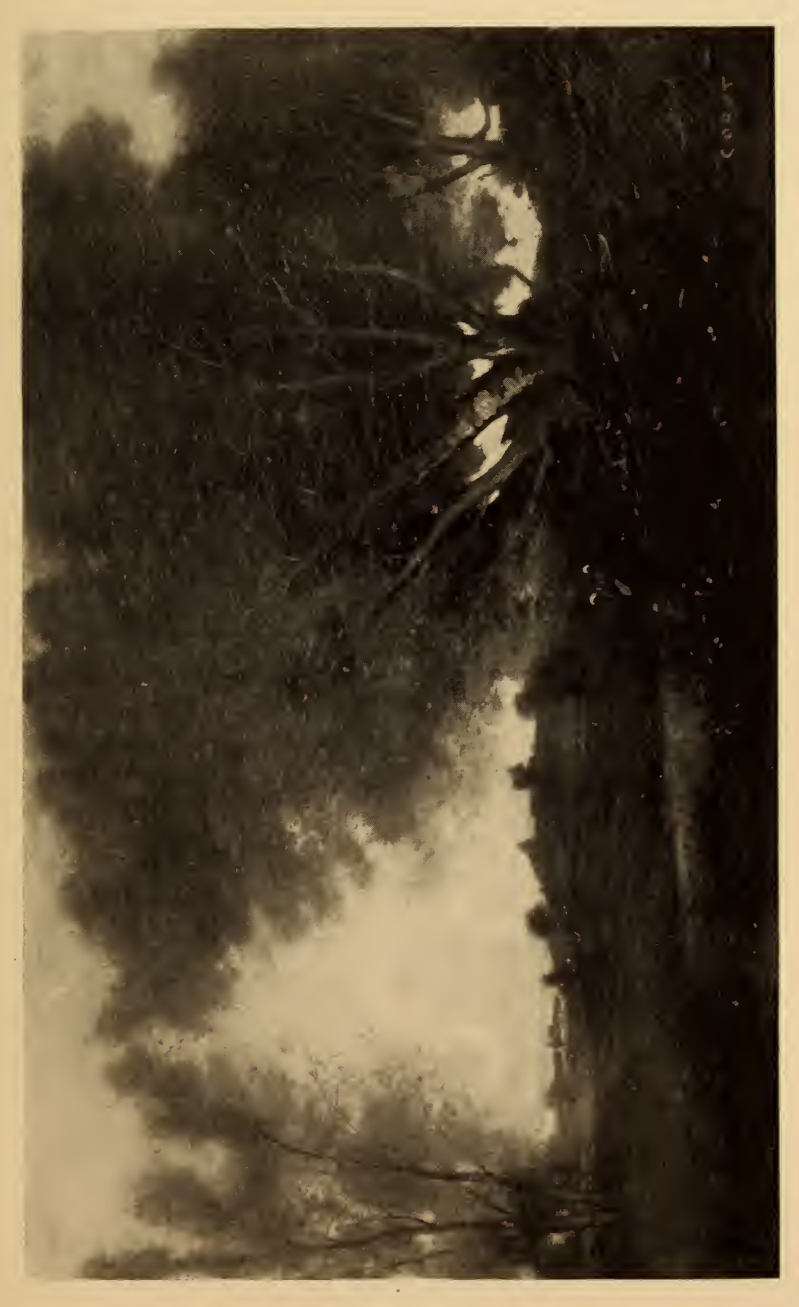
No. 627. THE GIANT WILLOWS By J. B. C. Corot