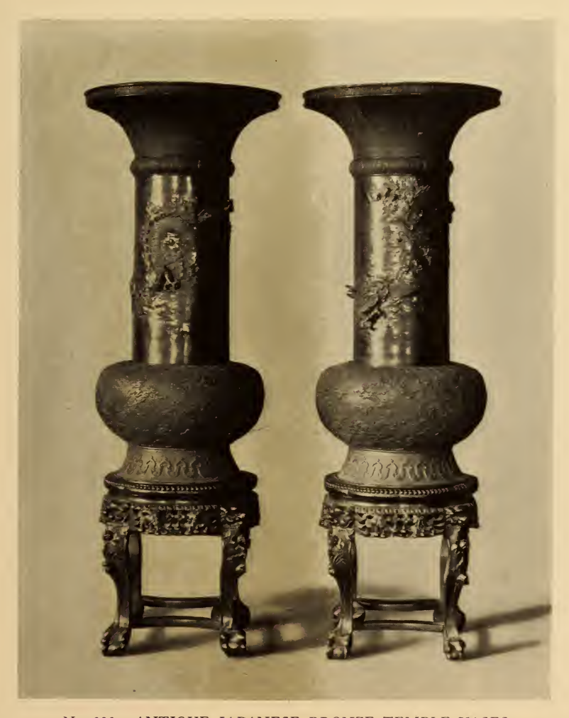
No. 323. ANTIQUE JAPANESE BRONZE TEMPLE VASES