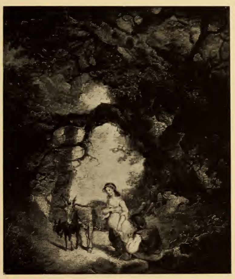
No. 177. THE REST AT THE ROADSIDE By George Morland