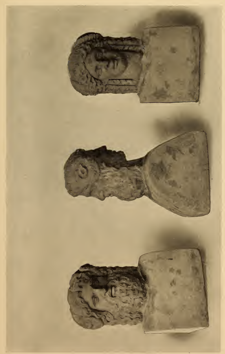
No. 336. ANCIENT GRAECO-EGYPTIAN BUST OF JUPITER AMMON AND JUNO