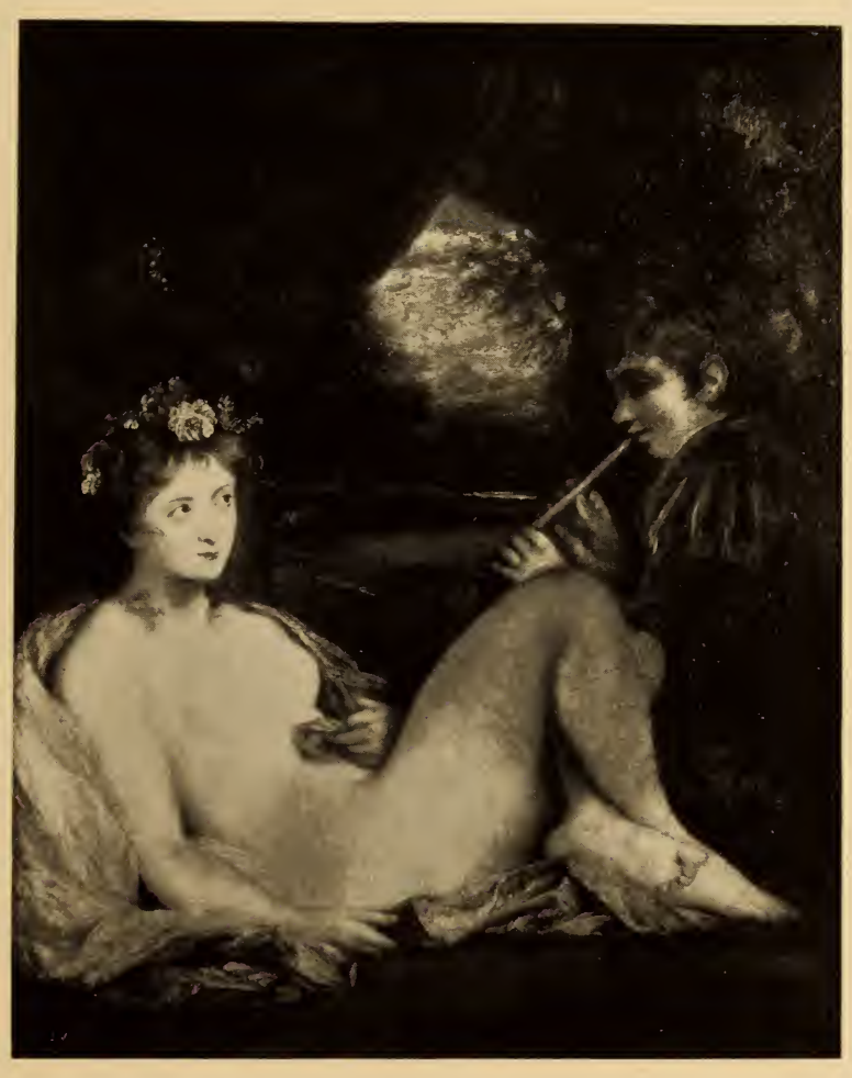
No. 628. THE NYMPH AND PIPING BOY By Sir Joshua Reynolds