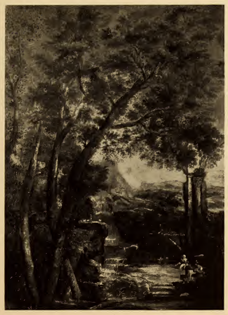
No. 638. A CLASSICAL LANDSCAPE By Salvator Rosa