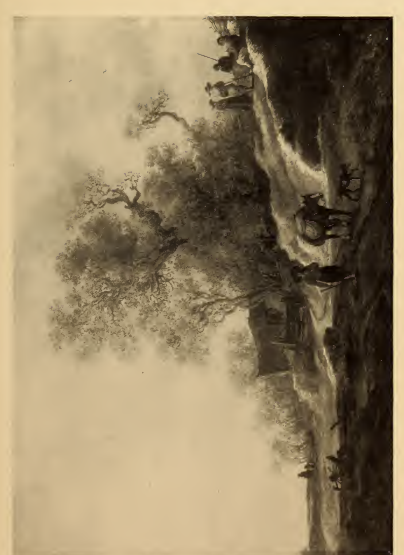
No. 403. HARVEST TIME By Jan Van Goyen