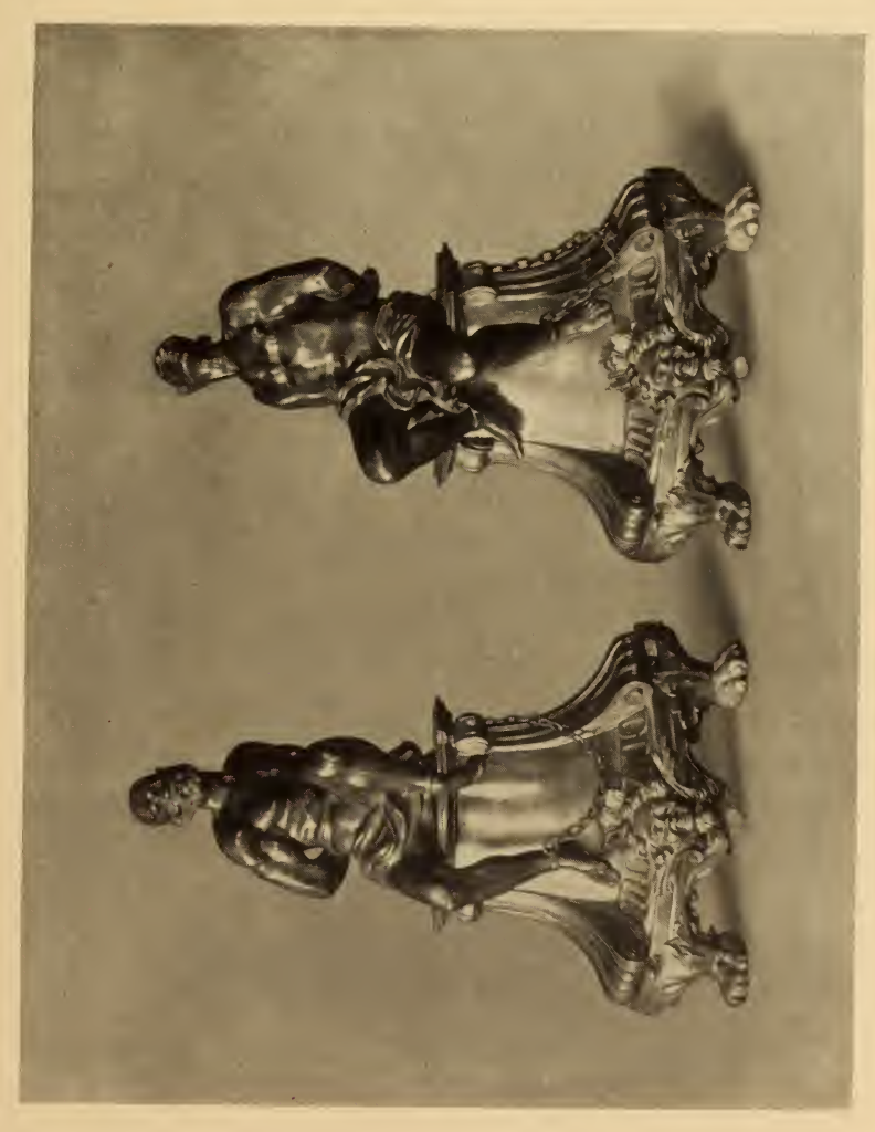
No. 91. FRENCH BRONZE FIRE DOGS OF THE XVIIIth CENTURY