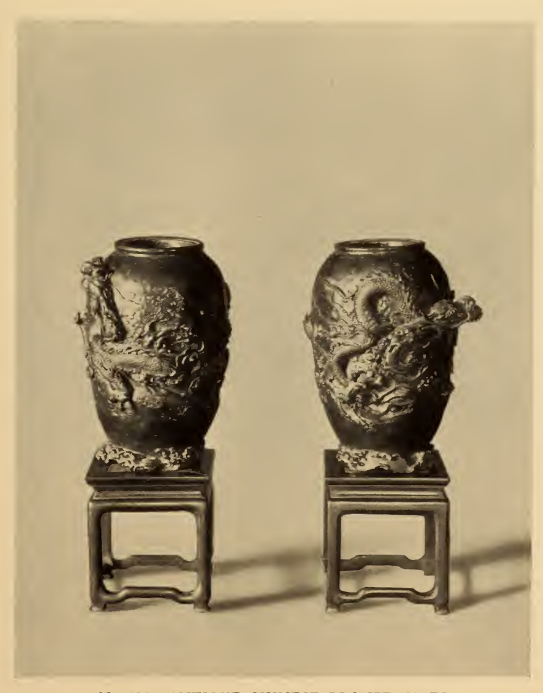
No. 305. ANTIQUE CHINESE BRONZE VASES