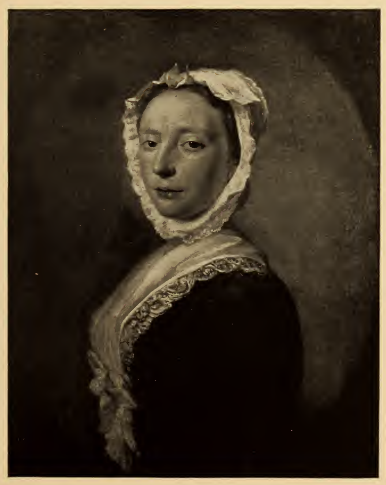
No. 582. PEG WOFFINGTON By William Hogarth