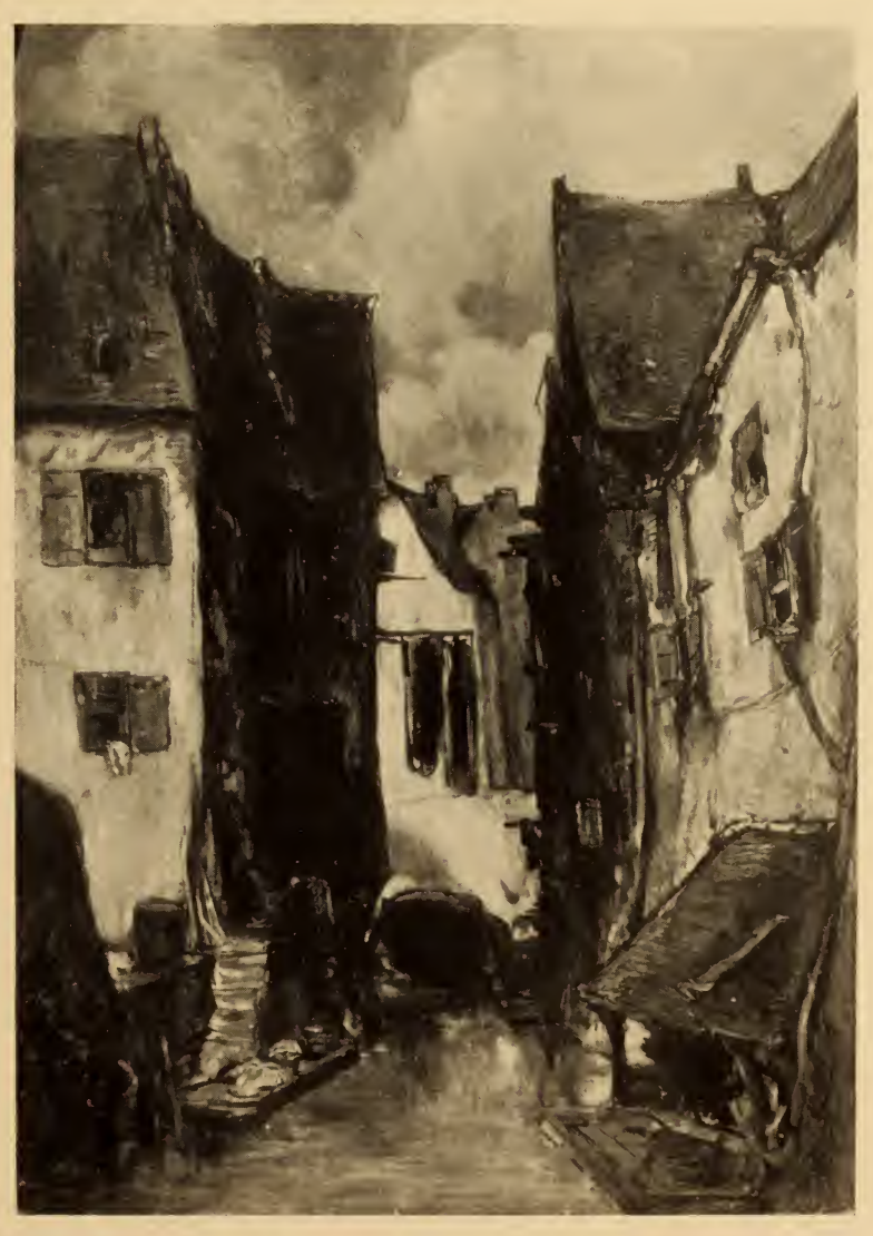
No. 383. STREET SCENE By Eugene Isabey