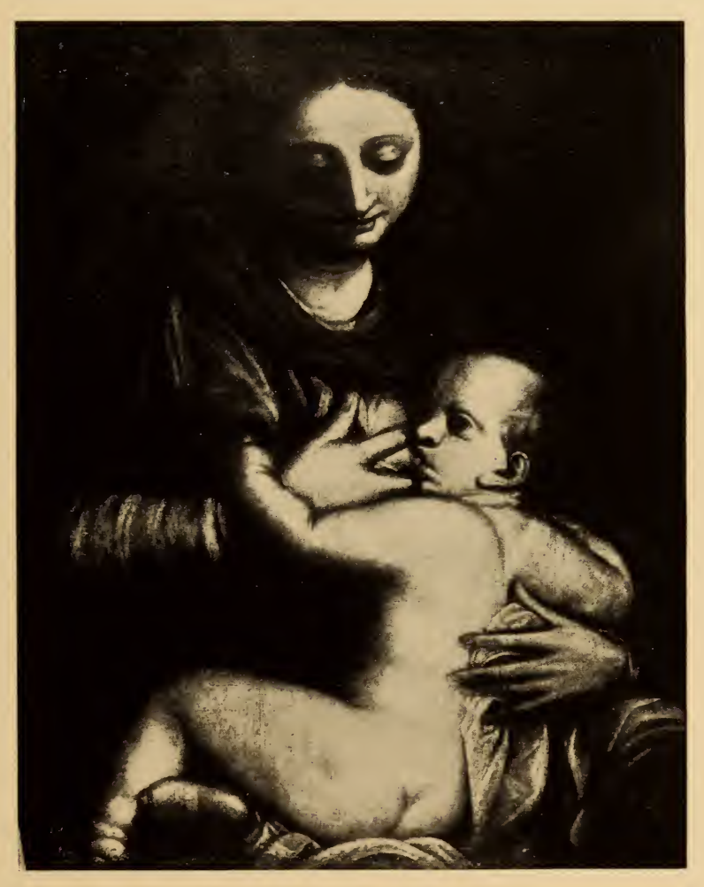
No. 626. MADONNA AND CHILD By Sebastiano del Piombo