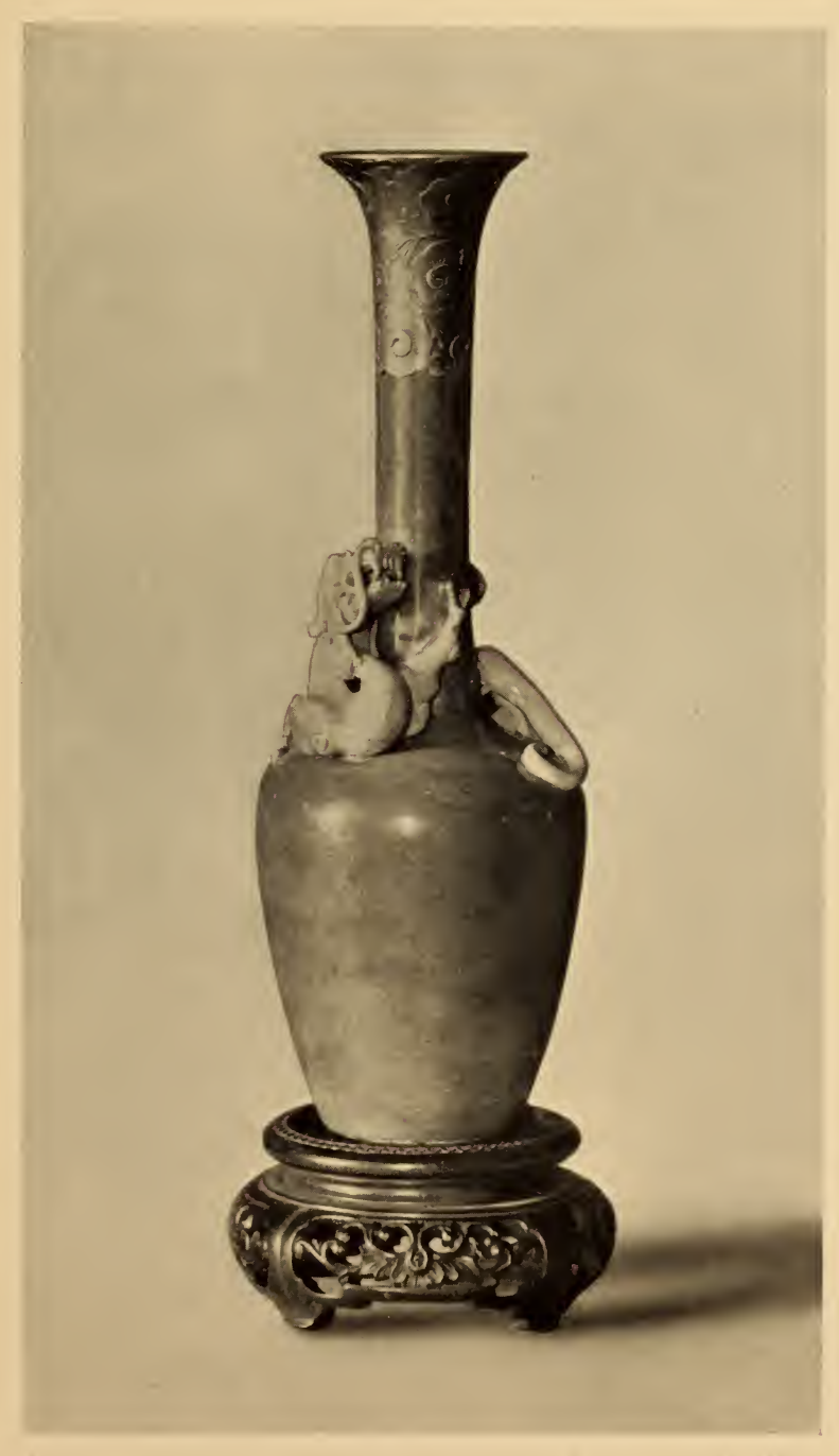
No. 526. EXQUISITE CHINESE PORCELAIN PEACH BLOW VASE WITH GREEN DRAGON ON THE NECK. YUNG-CHÊNG PERIOD