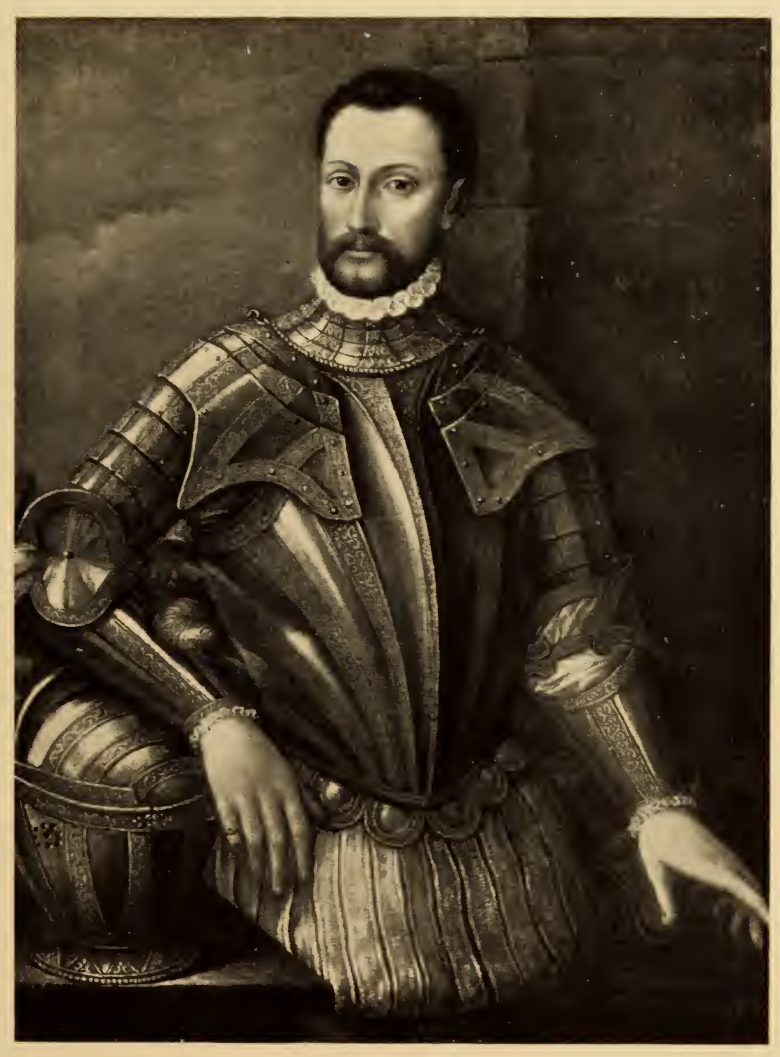
No. 624. COUNT BEVILACQUA By Paolo Veronese