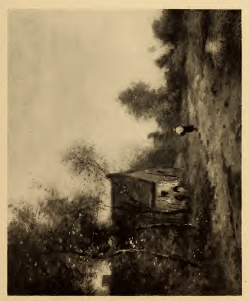
No. 370. THE ROADSIDE COTTAGE By J. B. C. Corot