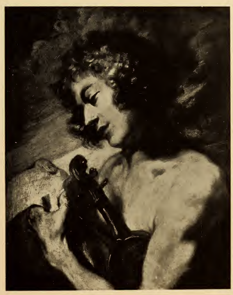
No. 402. ORPHEUS By Geraerd Pietersz Van Zyl