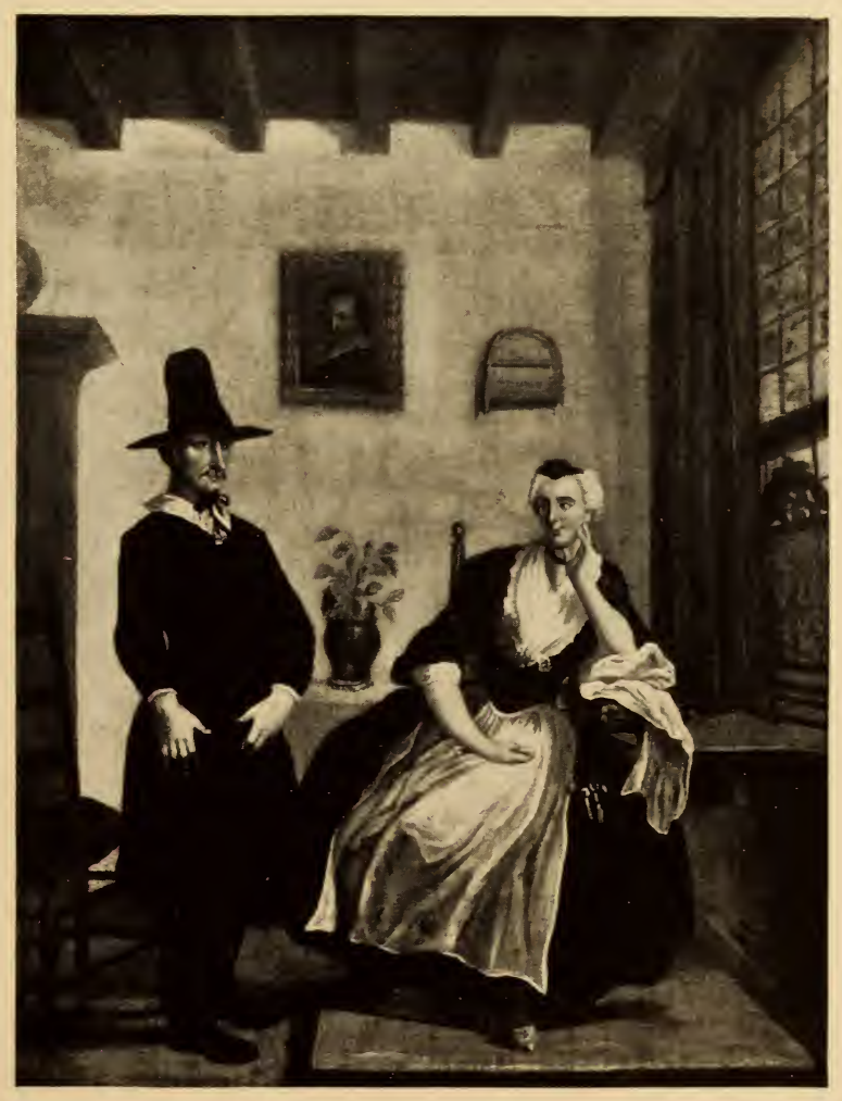
No. 388. THE COURTSHIP By Cornelis Troost