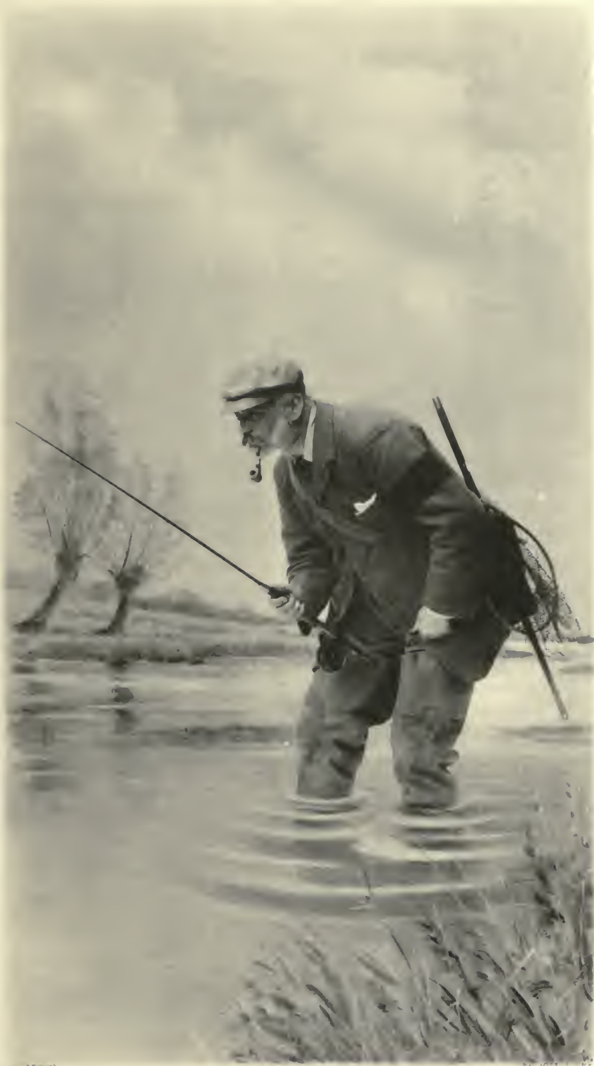
THE MIRROR OF GLENB