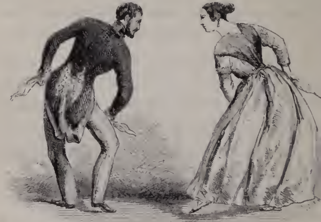
OFFICER AND GIRL DANCING.

would not bear inserting here. The guitars perform a peculiar part, the player sweeping the right hand across the full chord, and returning each time with a rap on the sounding-board. They sing in an extraordinarily high key, straining their throats until they almost rise off their seats to get higher. The dance is performed by a woman and a man,—any pair among the company who choose to exhibit: