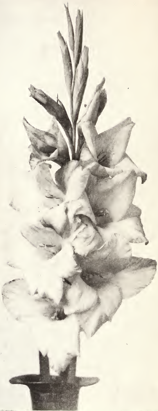
ORCHID LADY (From No. 5 bulb)