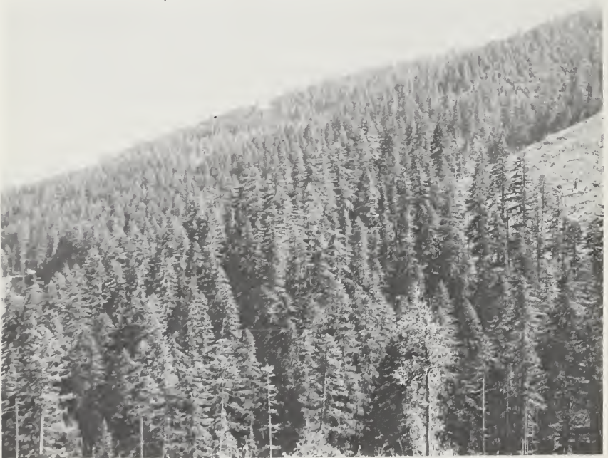
Fig. 4. Pseudotsuga menziesii on the western slope of the Cascade Mountains in Mixed Conifer Forest.

Pinus ponderosa and P. lambertiana (mostly secondary growth) associated with Pseudotsuga menziesii are dominant along the Upper Rogue River between Shady Cove to Prospect and east of Union Creek. Pinus lambertiana and Pseudotsuga menziesii are dominant from Prospect to Union Creek.