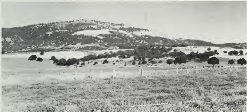
Fig. 3. Quercus groves and diversified farmland east of Medford. Ceanothus spp., Rhus diversiloba , and oak groves on the west slope of Mount Baldy are interrupted with open areas of short grasses and annuals.

The remaining portion of Jackson County is mountainous and dominated by coniferous forest. This upland part of the county is in the Oregonian Province (Dice 1943:31), which includes the Cascade Mountains of northern Jackson County west and north of Union Creek