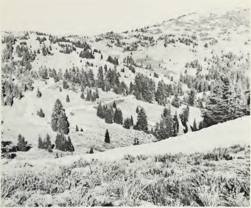
Fig. 7. Plants on the south side of Mount Ashland include Abies magnifica shastensis , A. procera , Chamaecyparis nootkatensis , and species of Ceonothus and Arctostaphylos .