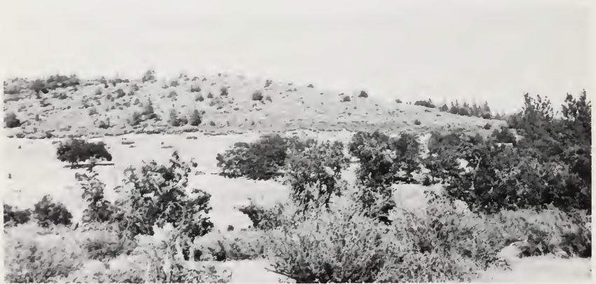
Fig. 2. Foothills east of Medford. Quercus groves and Pinus ponderosa are the predominate trees. Ceanothus and Arctostaphylos spp. occupy most of the foreground. Elevation, about 610 m.

The eastern Bear Creek foothills are characterized by larger and more abundant Quercus groves, scattered trees of Pinus ponderosa , and an understory of Rhus diversiloba (Fig. 2). Most of the southern and western slopes of Roxy Ann Peak and Baldy are dominated by nearly impenetrable Rhus diversiloba , often over 3 m high, interrupted only