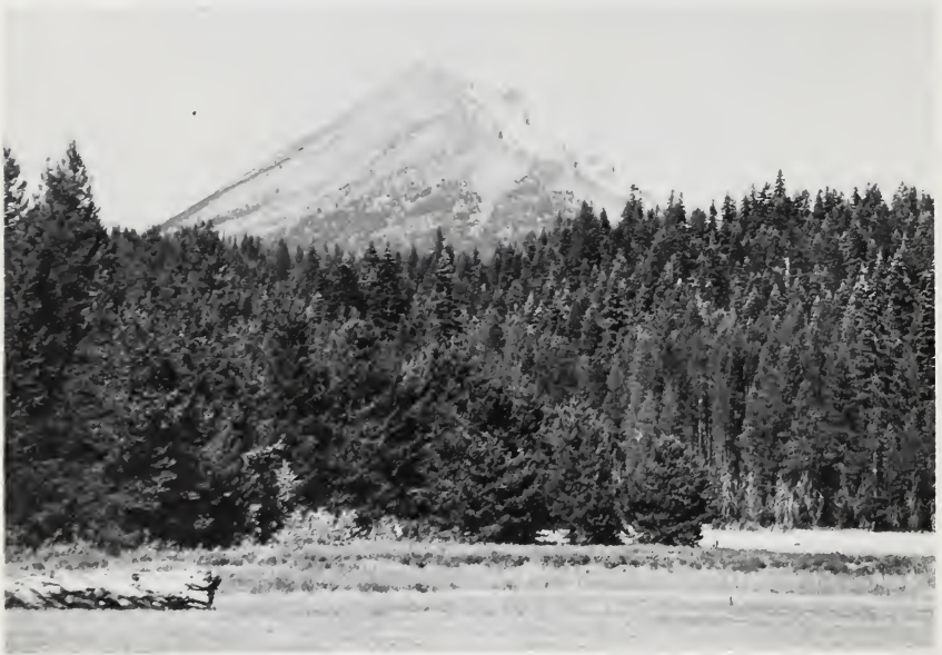
Fig. 6. True Fir Forest near Lake of the Woods (Klamath County) at 1,524 m. The summit of Mount McLoughlin is in the background.

Timberline Forest. —The highest elevations of Jackson County are typically forested by small subalpine forests; two Cascade Mountain peaks (Mount McLoughlin and Brown Mountain) are above timberline (Fig. 6). Pinus albicaulis , Tsuga mertensiana , Abies lasiocarpa , Cassiope spp., and Phyllococe spp. are the dominant plants above about 1,829 m. Juniperus communis , Pinus monticola , Cassiope spp., and Phyllodoce spp. are dominant plants in the higher Siskiyou Mountains. The Timberline Forest includes the Tsuga mertensiana Zone and the Alpine Zone of Franklin and Dyrness (1973).