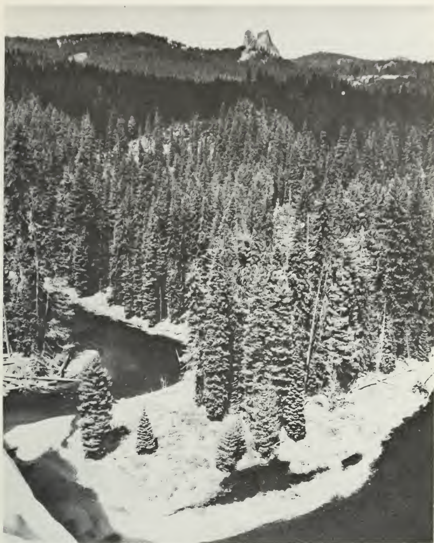
Fig. 5. Mixed Conifer Forest north of Union Creek at 1,219 m.

Franklin and Dyrness (1973) differentiated this community into two zones. The western Siskiyou Mountains are considered to be in the Mixed-Evergreen ( Pseudotsuga - Sclerophyll ) Zone. The most dominant tree species are Pseudotsuga menziesii and Lithocarpus densiflorus . The west slope of the Cascades and the eastern Siskiyou Mountains are considered in their Mixed-Conifer ( Pinus - Pseudotsuga - Libocedrus - Abies ) Zone, which includes as dominant trees Pseudotsuga