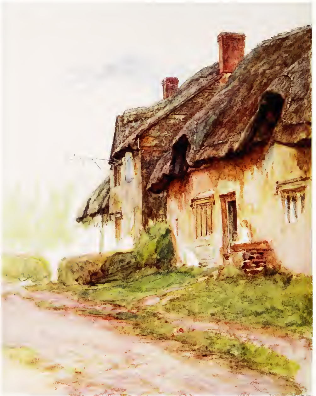
Helen Allingham, R.A.S.