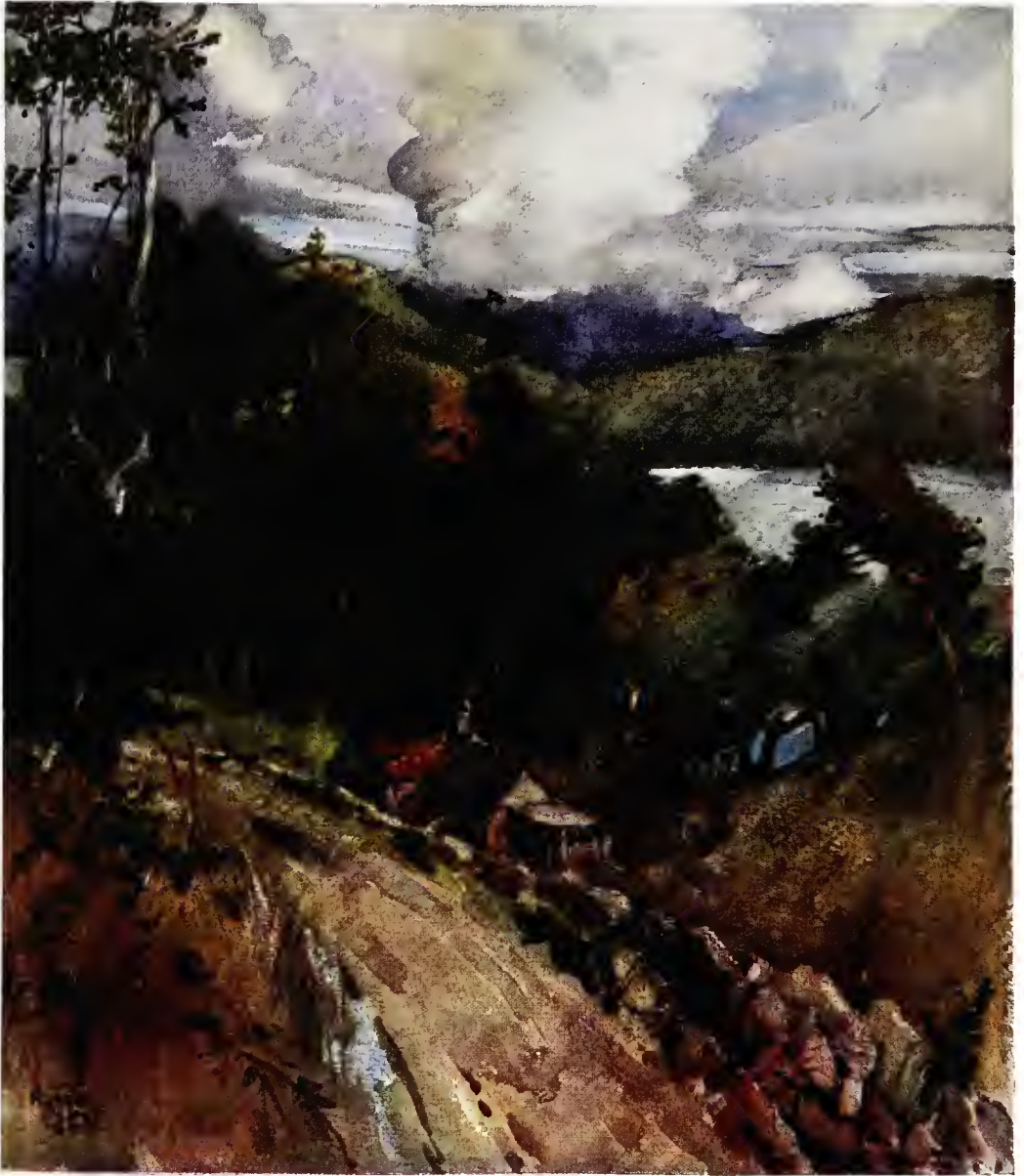
W. Russell Flint.