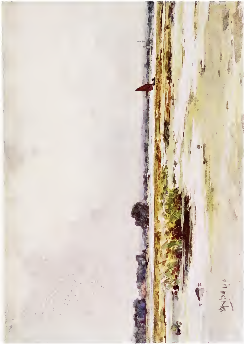
ON THE FLATS.