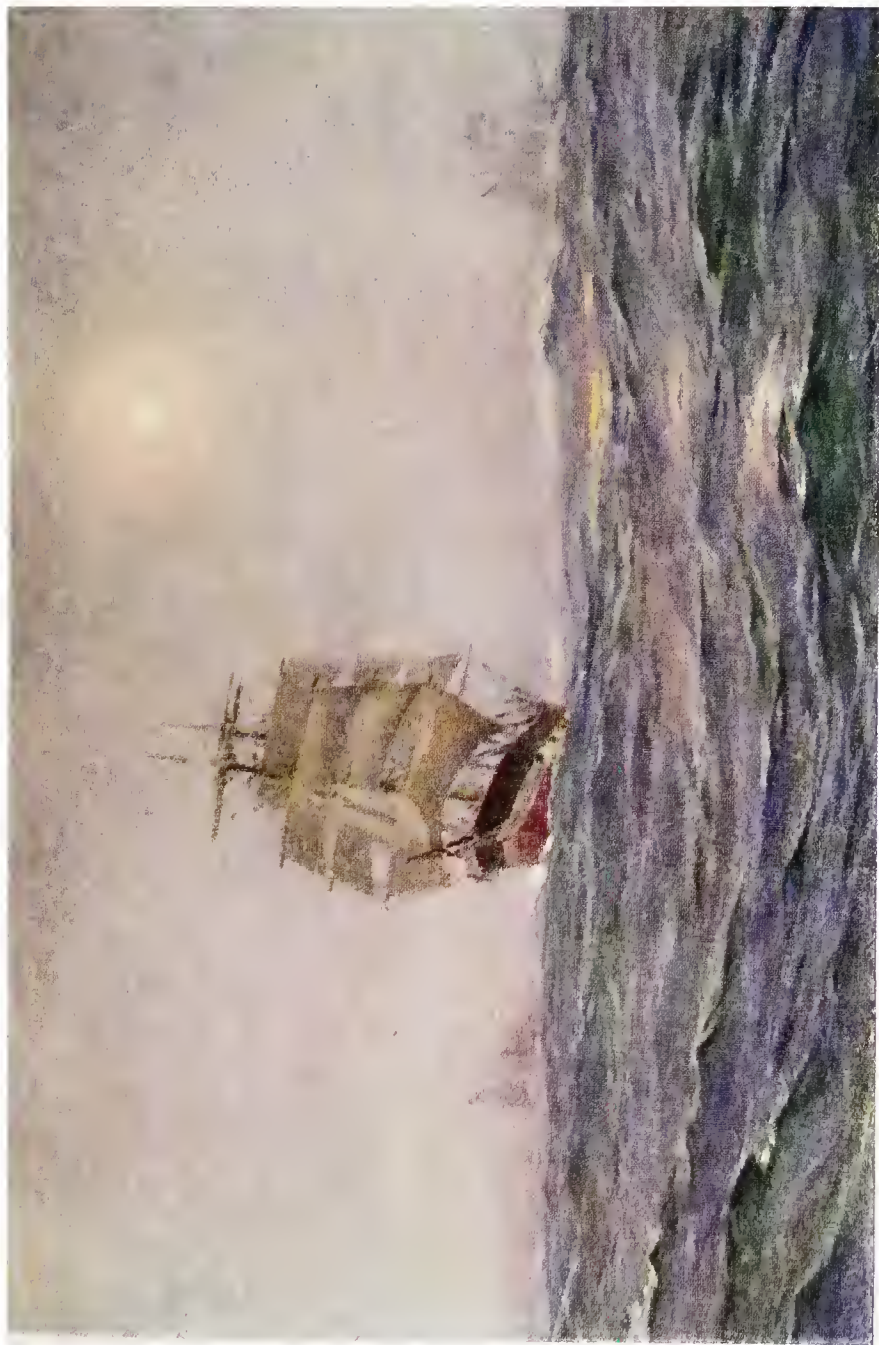
U. Speer's original, P.K. 160, N.Y.