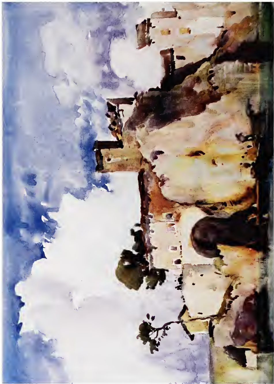
L'ank B'atagapin, L.R. 1.