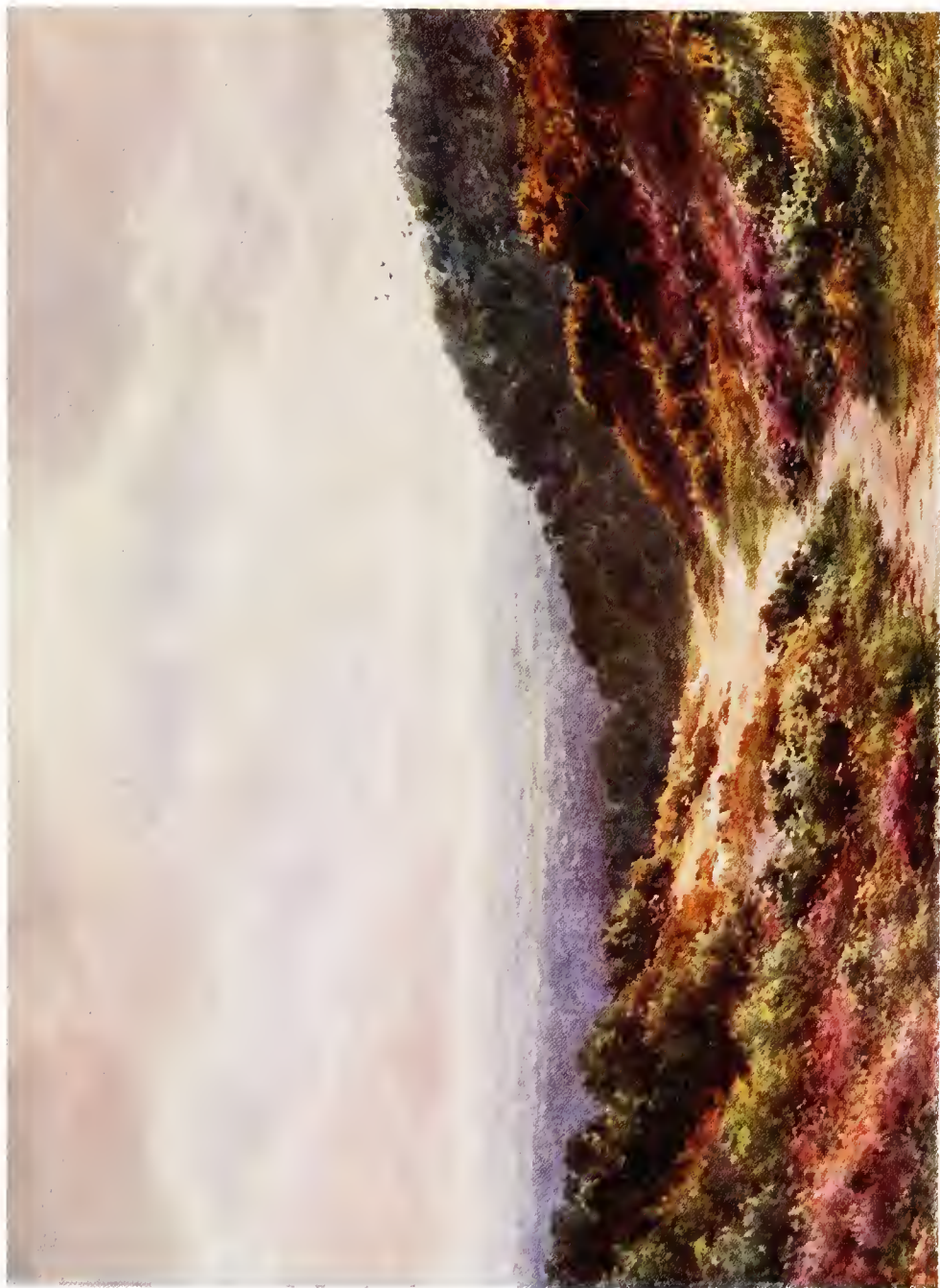
LEITH HILL, SURREY.