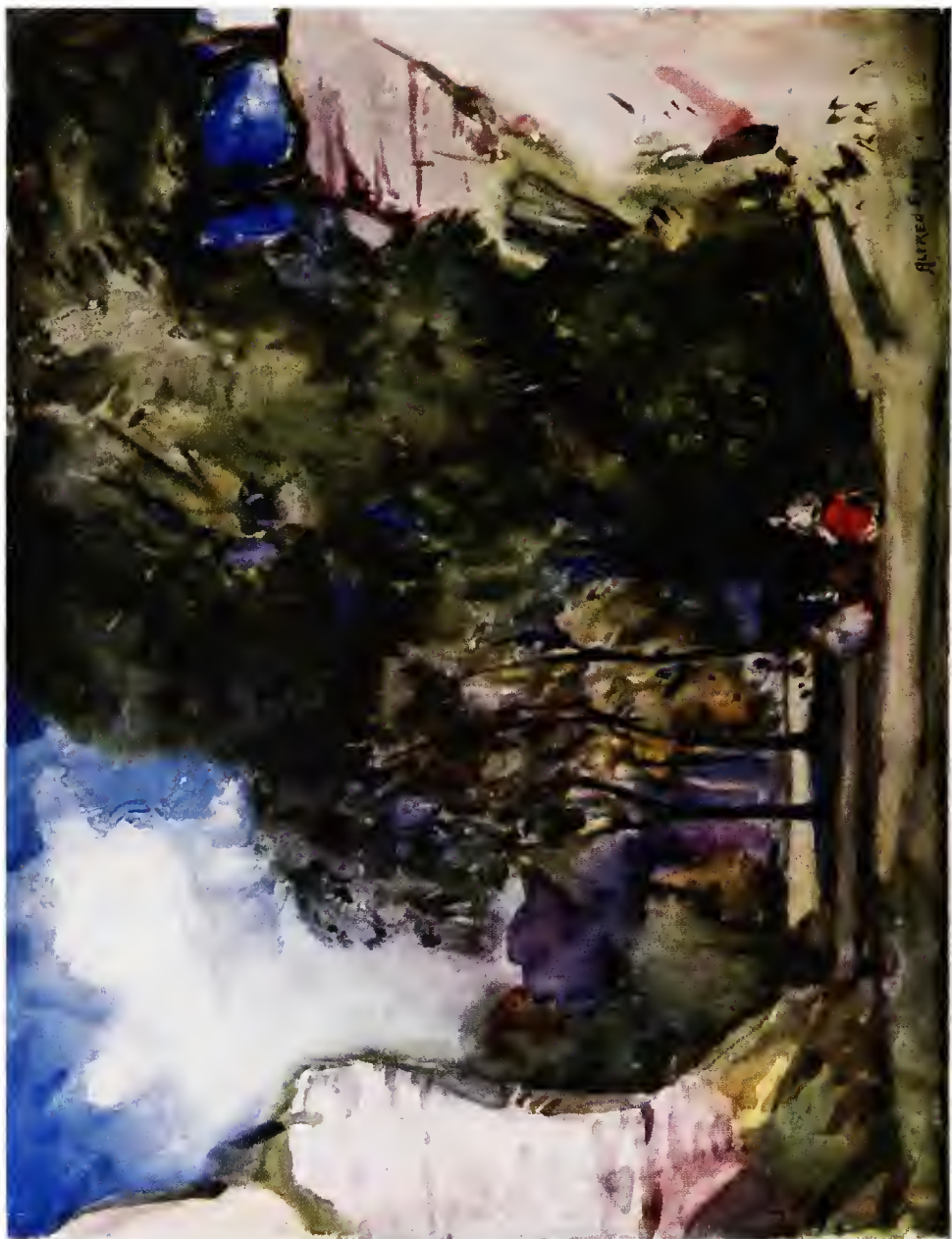
Sir Alfred East, 1861-1931, P. 62 B. 4