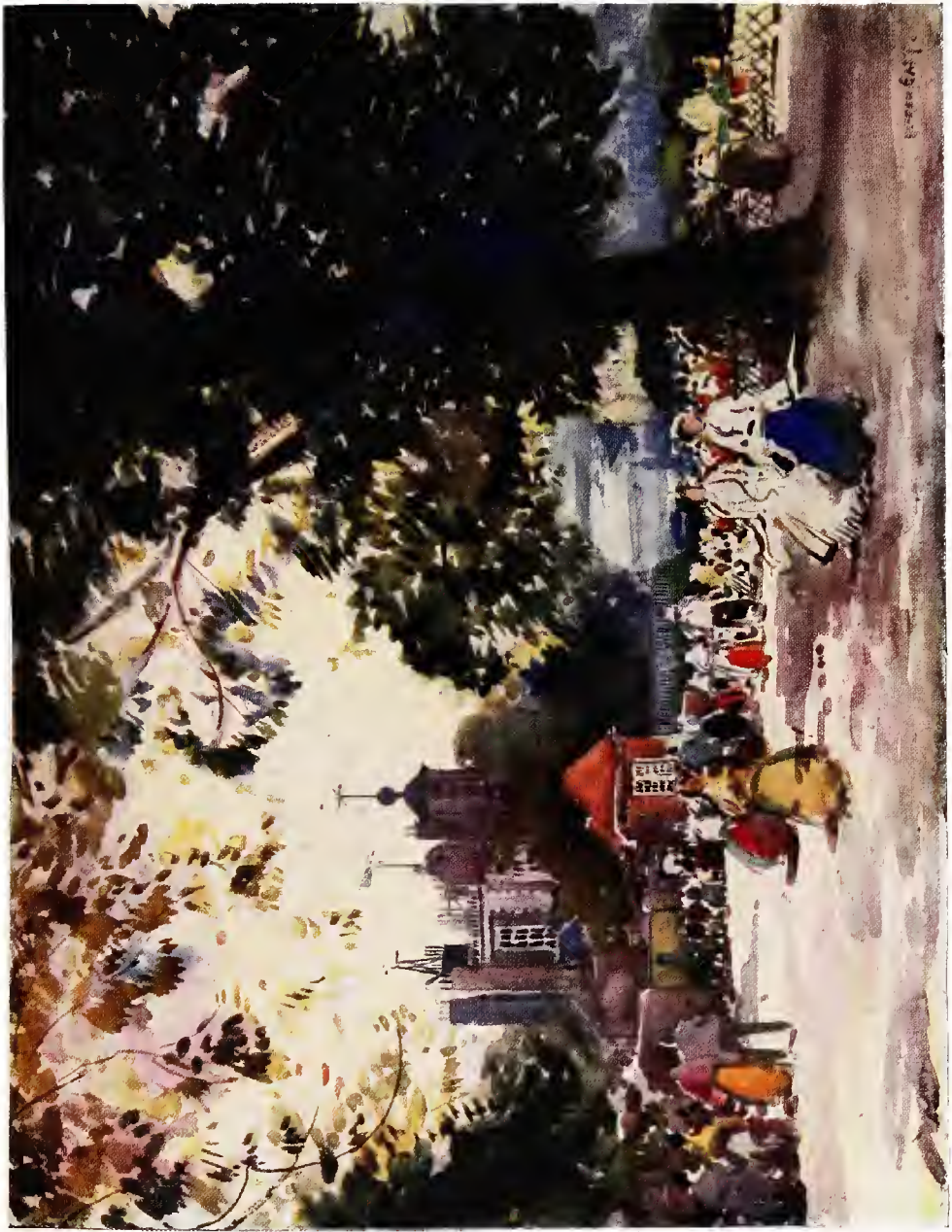
Sir Alfred East, J. R. S., P. A. S., R. A.