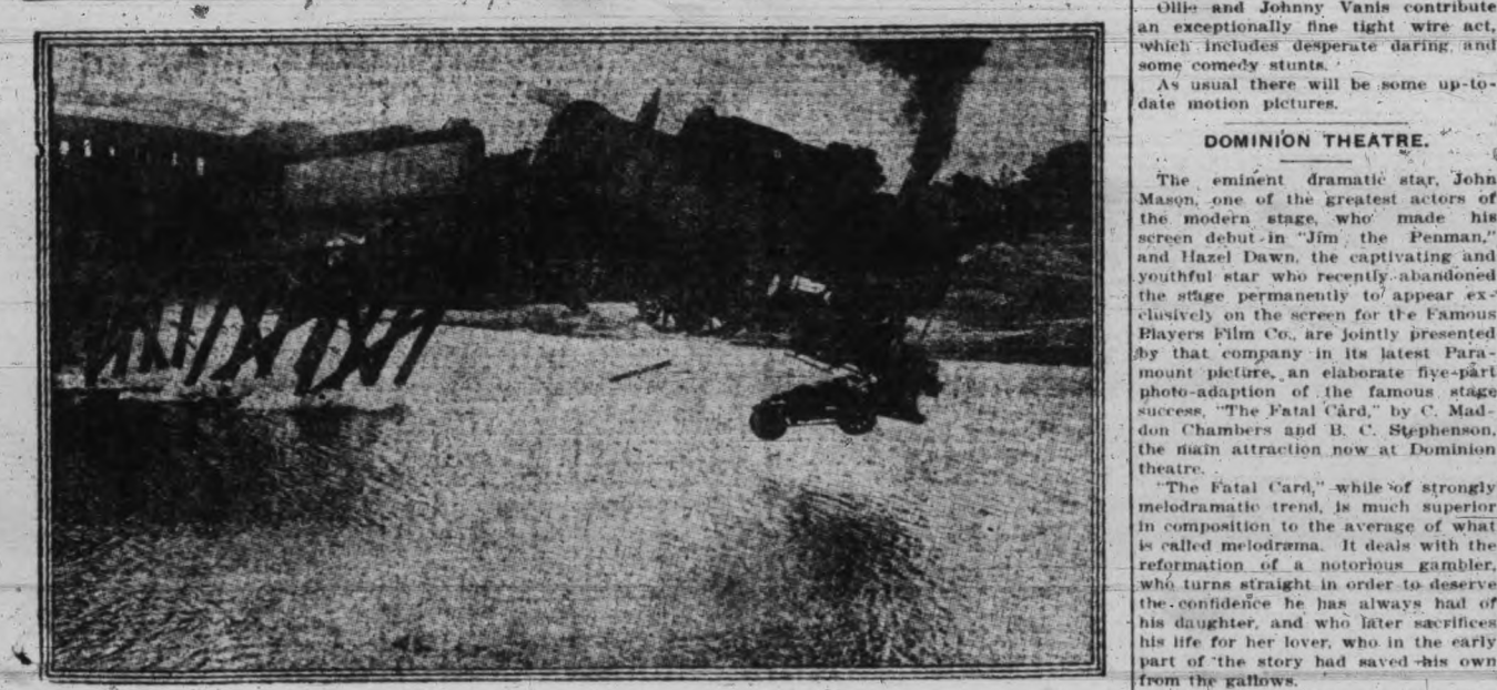
Seene from "The Juggernaut," the most spectacular play ever filmed, now running at the Columbia theatre.