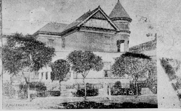
SOME HOMES IN SANTA CLARA COUNTY.