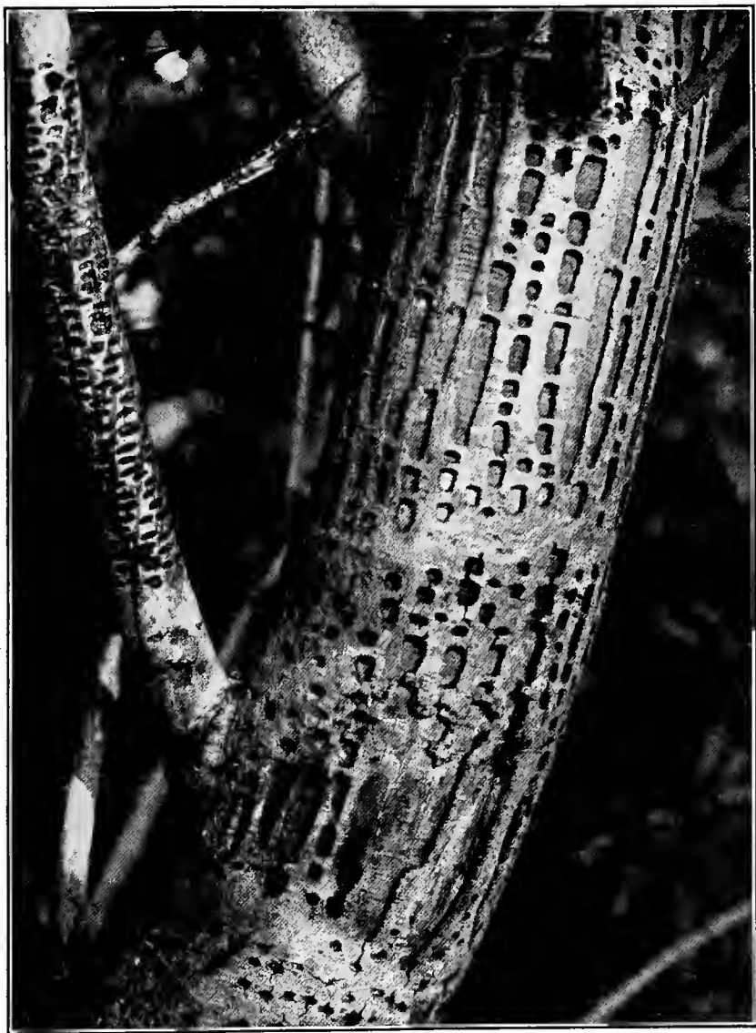
TYPICAL SAPSUCKER WORK ON WILLOW.