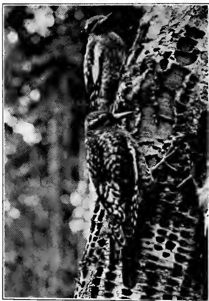
Sapsuckers and their work.