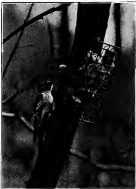
Downy Woodpecker.