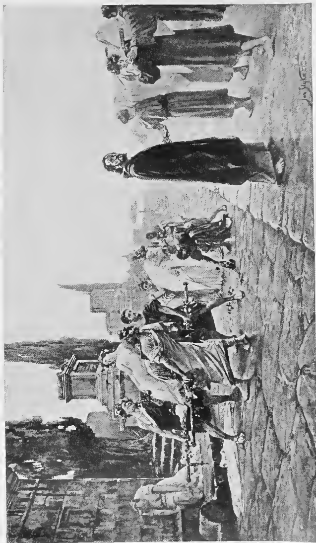
DEGENERATION AND REGENERATION