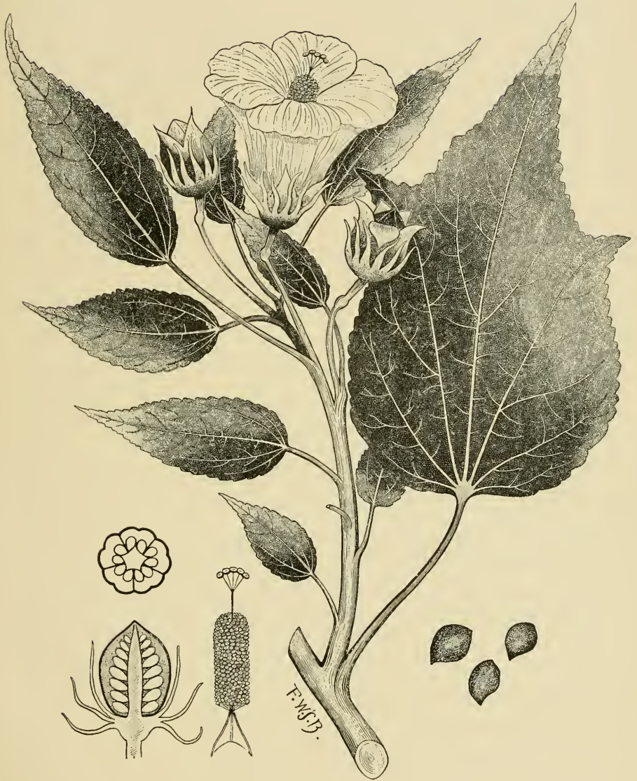
THE SWAMP ROSE MALLOW ( Hibiscus moscheutos ).