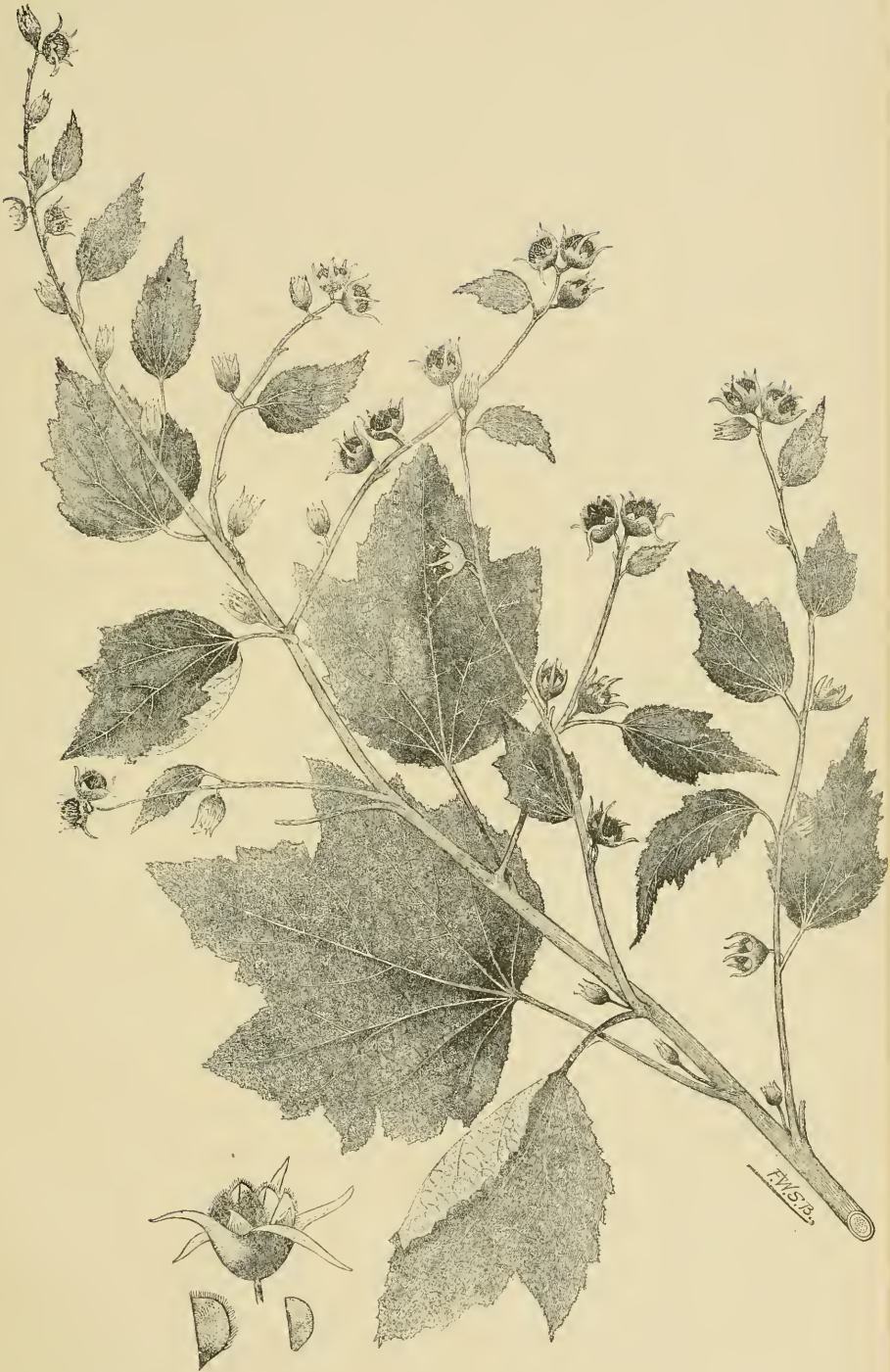
THE CÆSAR WEED ( Urena lobata ).