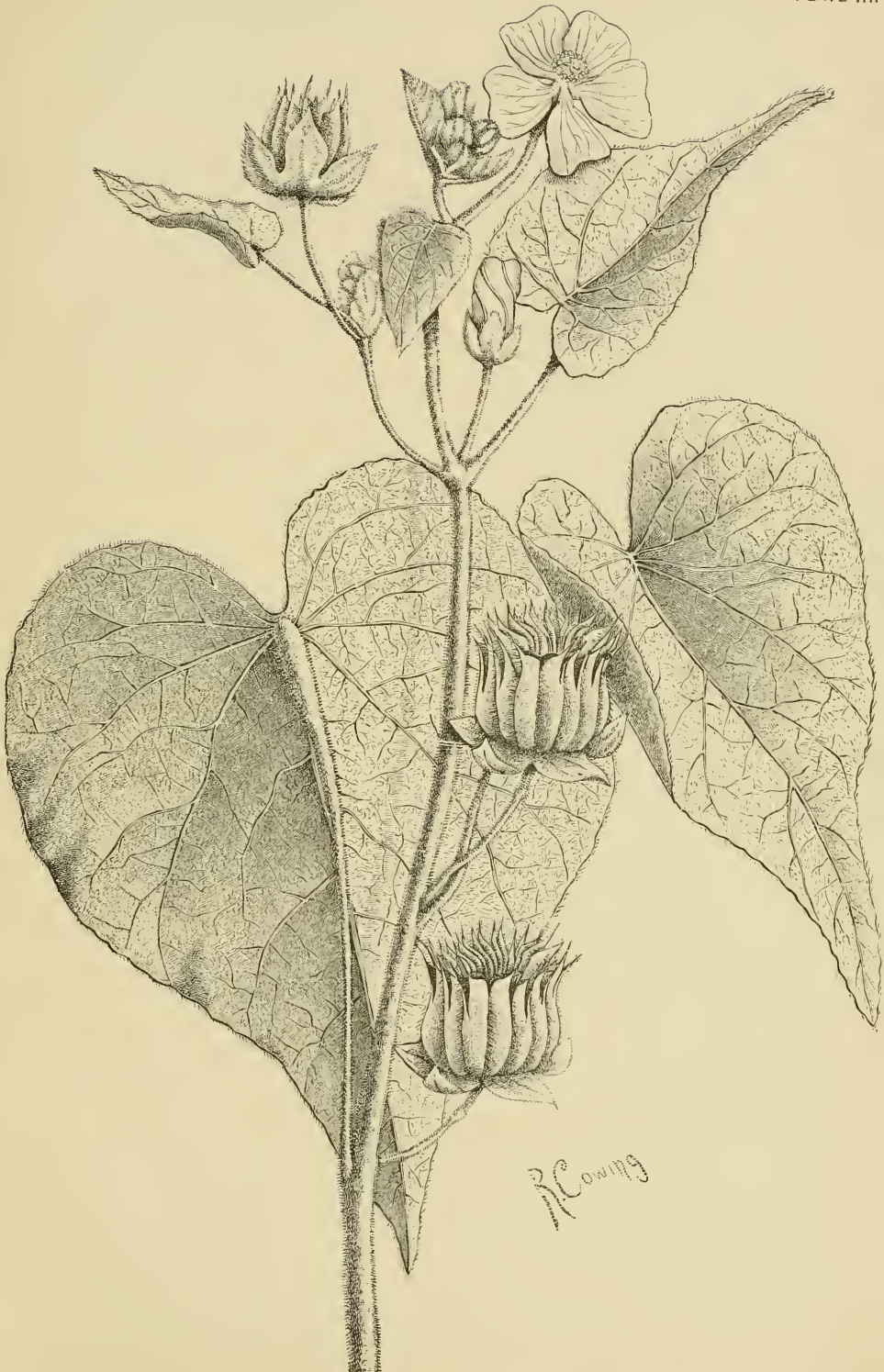
THE INDIAN MALLOW ( Abutilon avicennae ).