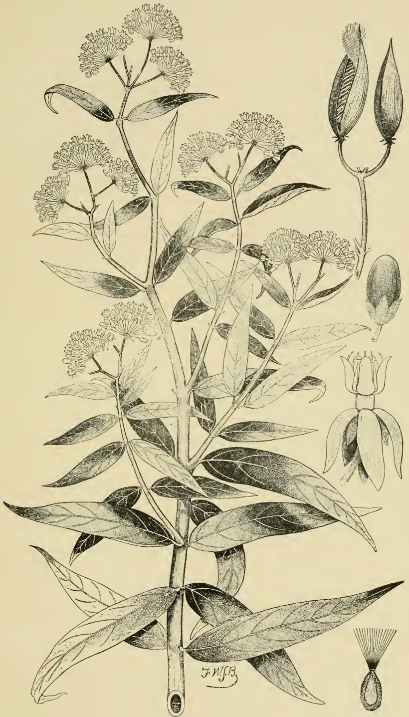
THE SWAMP MILKWEED ( Asclepias incarnata ).