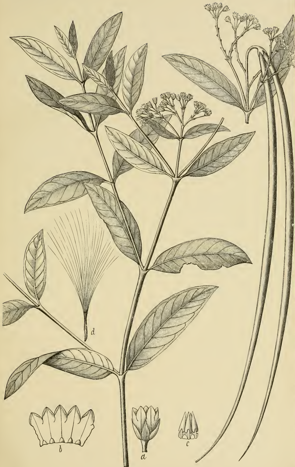
THE INDIAN HEMP PLANT ( Apocynum cannabinum ).