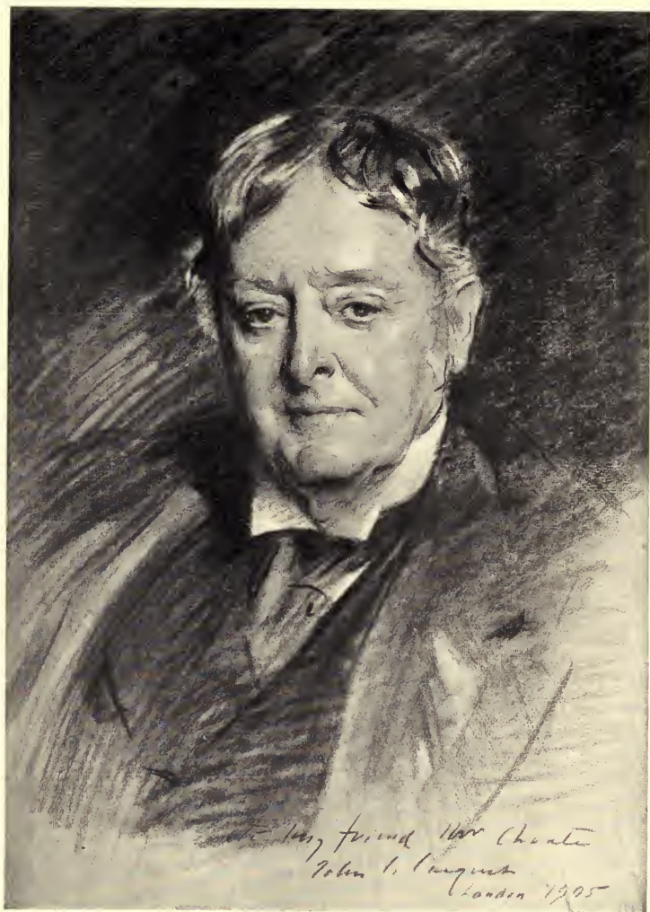
Joseph H. Choate