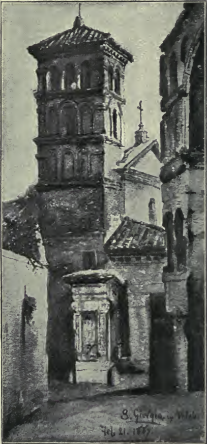
CHURCH OF S. GEORGE IN VELABRO.