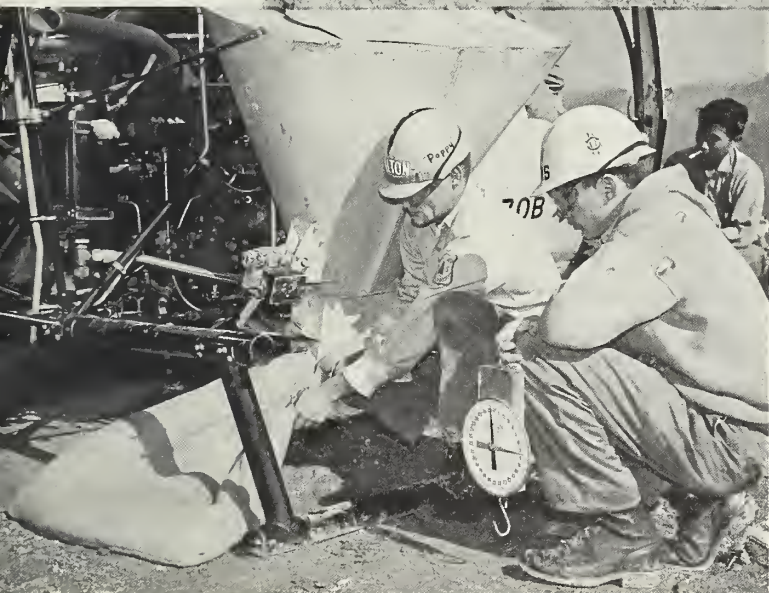
Catching seed in sack, with seed distributor removed, during calibration of the seeder.