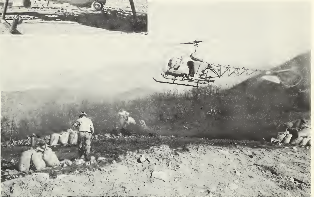
Helicopter landing at a temporary heliport.