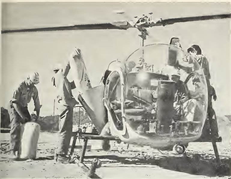
Loading and refueling the helicopter.