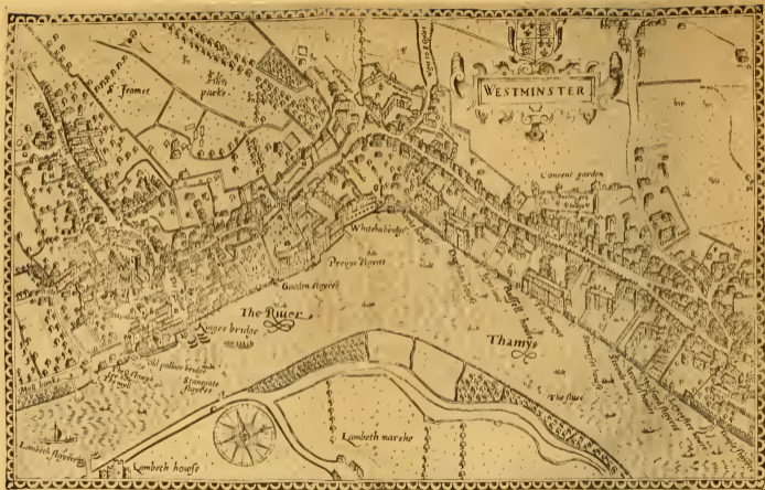
PLAN OF WESTMINSTER